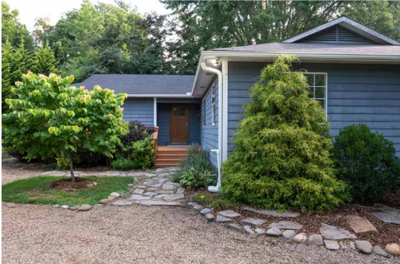
Summer Vibrancy Abounds

Amazing Asheville bungalow, mere steps to downtown's award-winning shopping, dining, and entertainment. This fantastic urban oasis boasts Western North Carolina one-level living at its best. Mature shade trees and shrubs create peaceful privacy, and established garden beds are ready for gardening. Lots of outdoor living with a sunny front deck, perfect for al fresco dining and a huge, private back deck. The open, flowing floor plan includes the spacious living room, a dining room with space for a large table, and the kitchen with a large pass-through window make entertaining easy. Primary suite features gleaming hardwood floors, a walk-in closet, and an ensuite full bathroom. Hallway connects three bright bedrooms and a second full bathroom. Large shed and ample attic space for tool, toy, and outdoor gear storage.