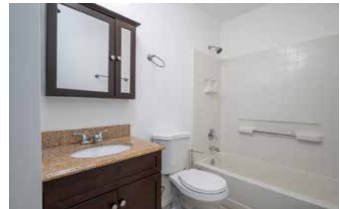
Second Full Bathroom