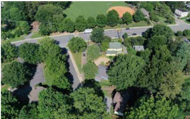
Mature Trees Provide Good Shade