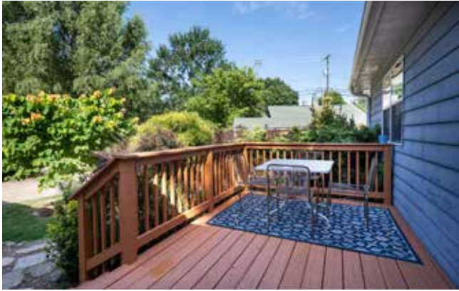
Sunny Front Deck, Perfect for Al Fresco Dining