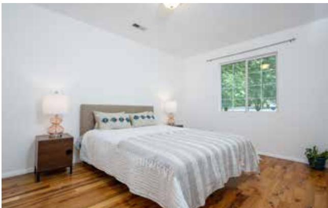
Bedroom Three with Neighborhood View