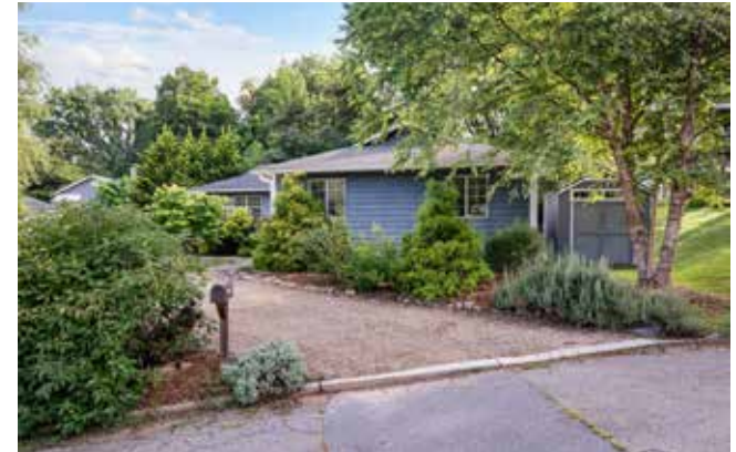
Lots of Native Plants and Trees Surround the Home