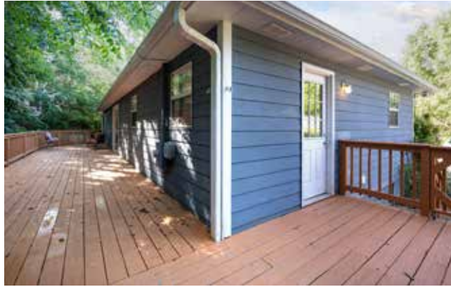
Wraparound Deck has Access to the Home