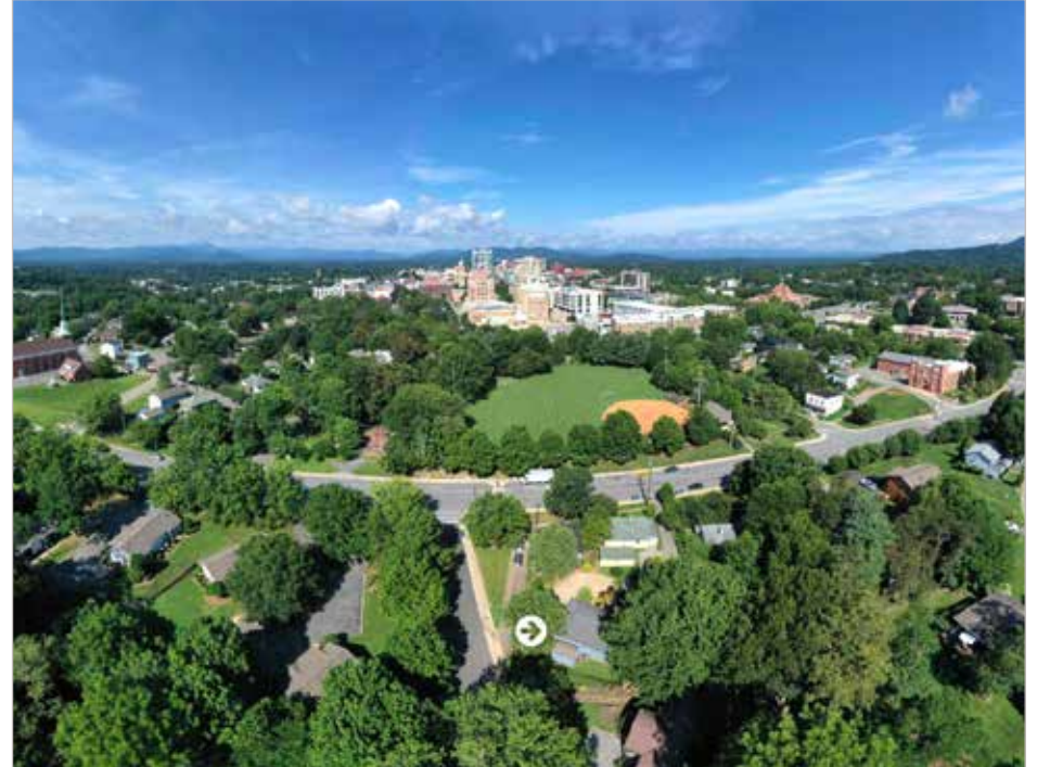
Amazing Proximity to Downtown Asheville