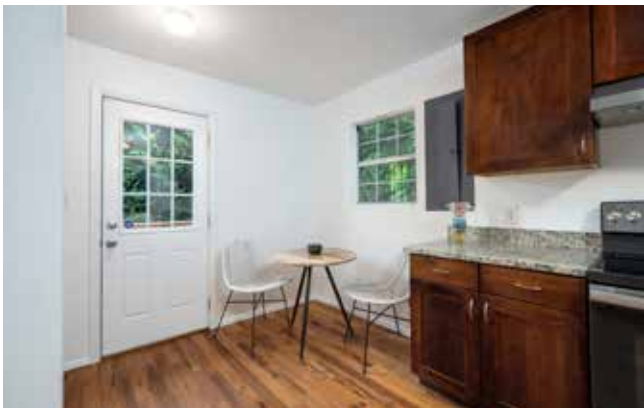
Breakfast Nook off of Kitchen