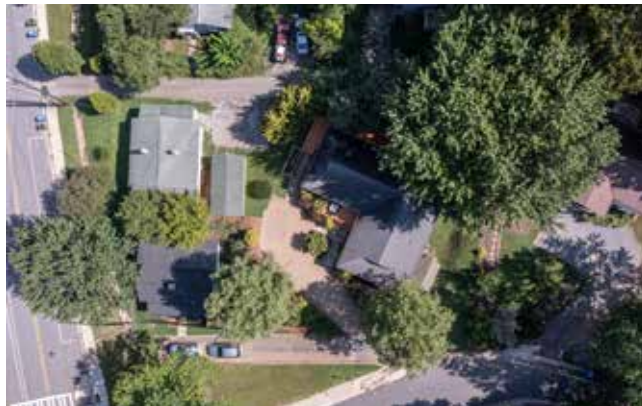
Urban Oasis in the Mountains