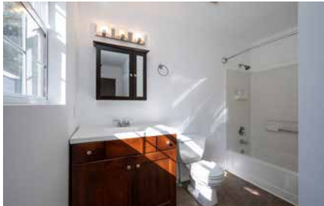
Ensuite Full Bathroom