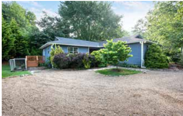
Plenty of Parking