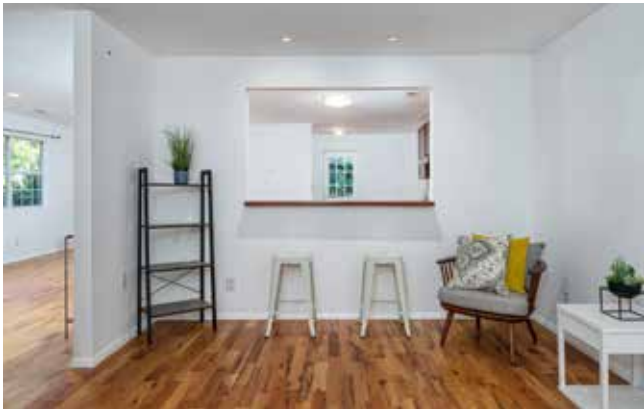
Gleaming Hardwood Floors