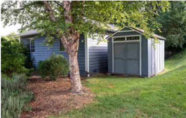
Storage Shed for Tools and Toys