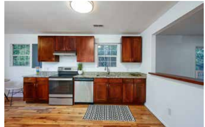
Kitchen Features Granite and Stainless Steel