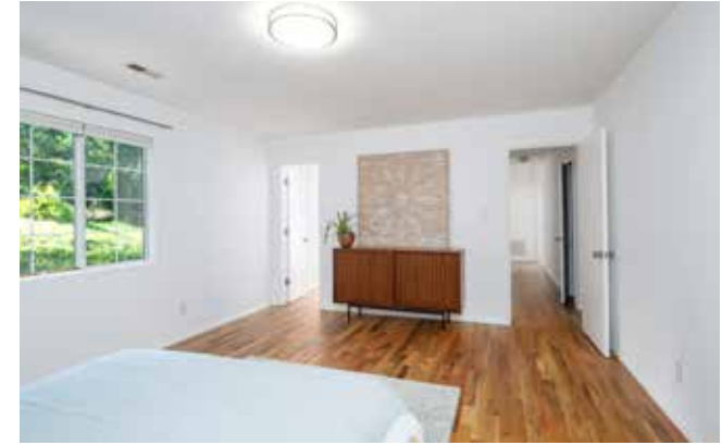
Primary Suite with Ensuite Bathroom