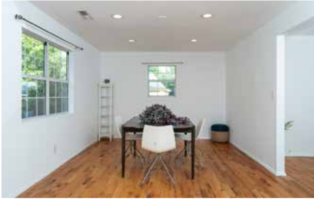
Dining Room with Space for Large Table