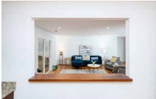
Pass-through Window Joins Kitchen and Living Room