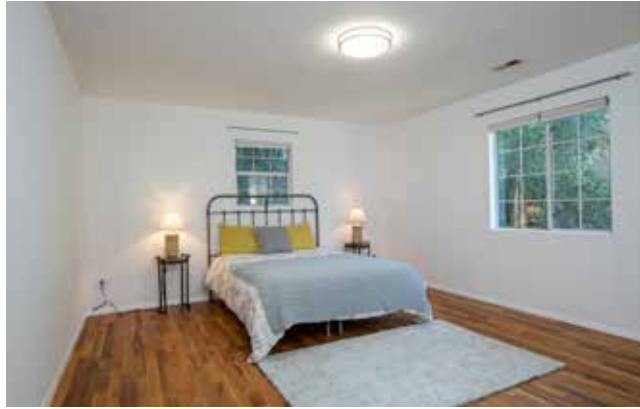
Primary Suite has Great Natural Light