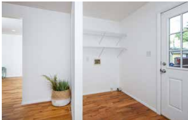
Laundry Nook with Storage Shelves