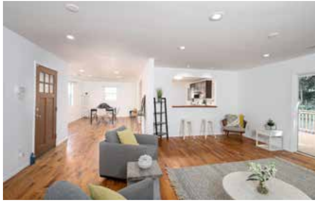
Light and Bright, Open Floor Plan