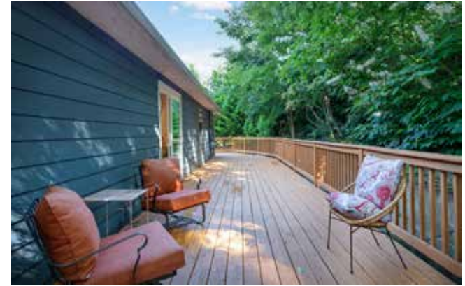
Huge Back Deck with Space to Gather