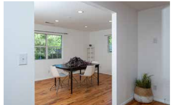
Oversized Doorway Opens to Dining Room