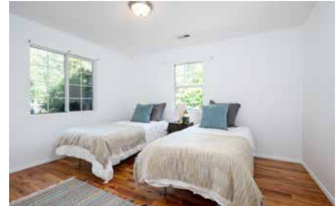
Bright Second Bedroom