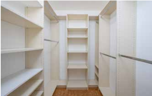
Walk-in Closet with Built-in Organization System