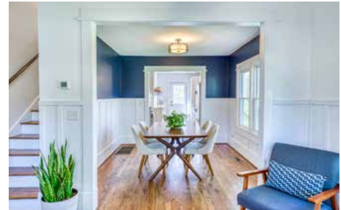
Flow from the Front Door