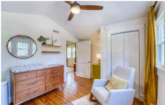
Beautiful Detail in Floors and Trim