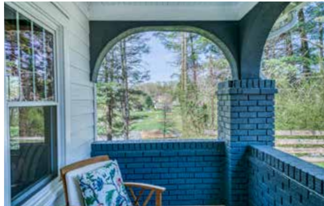
Arched Views in All Directions from the Front Porch