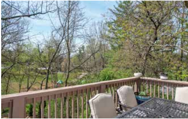
Dine on the Raised Deck