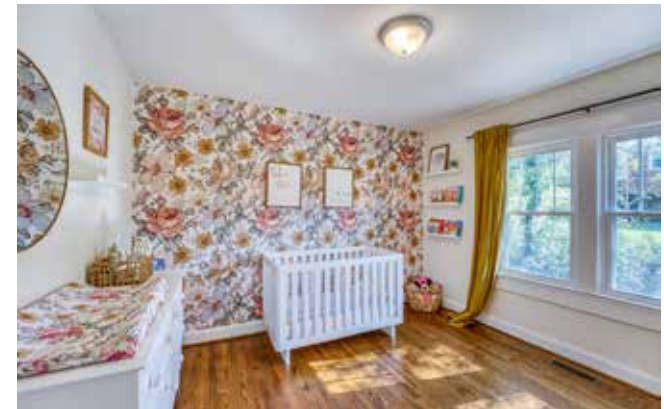
Bedroom on Lower Level