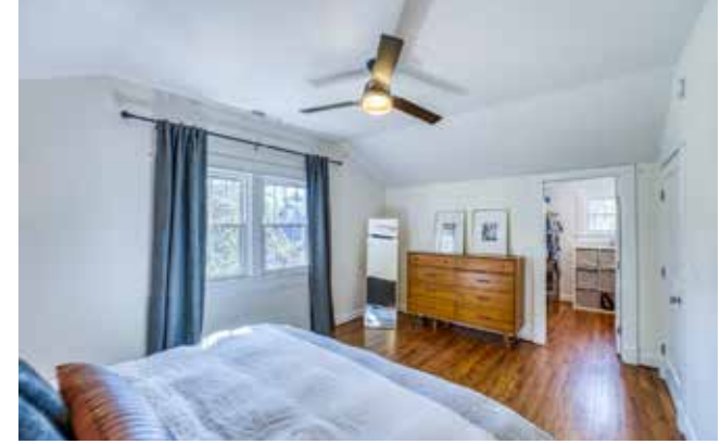
Flows into Walk-in Closet