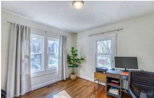
Office or Bedroom, You Choose