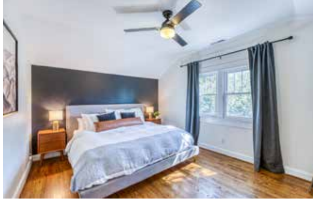
Spacious Primary Bedroom