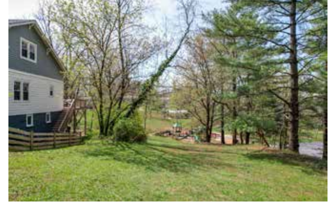
City-Owned Lot at the End of the Street