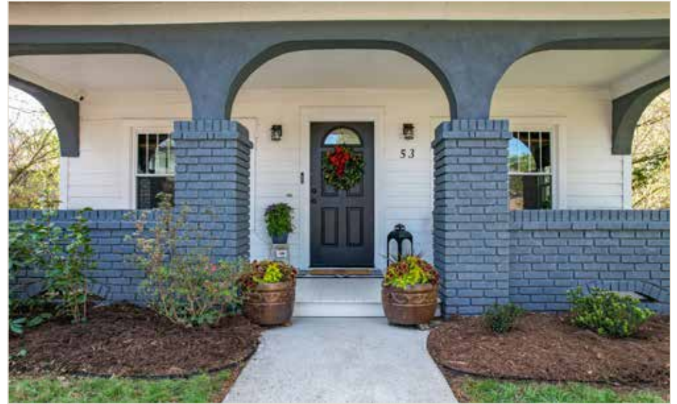
Old-Fashioned Covered Porch