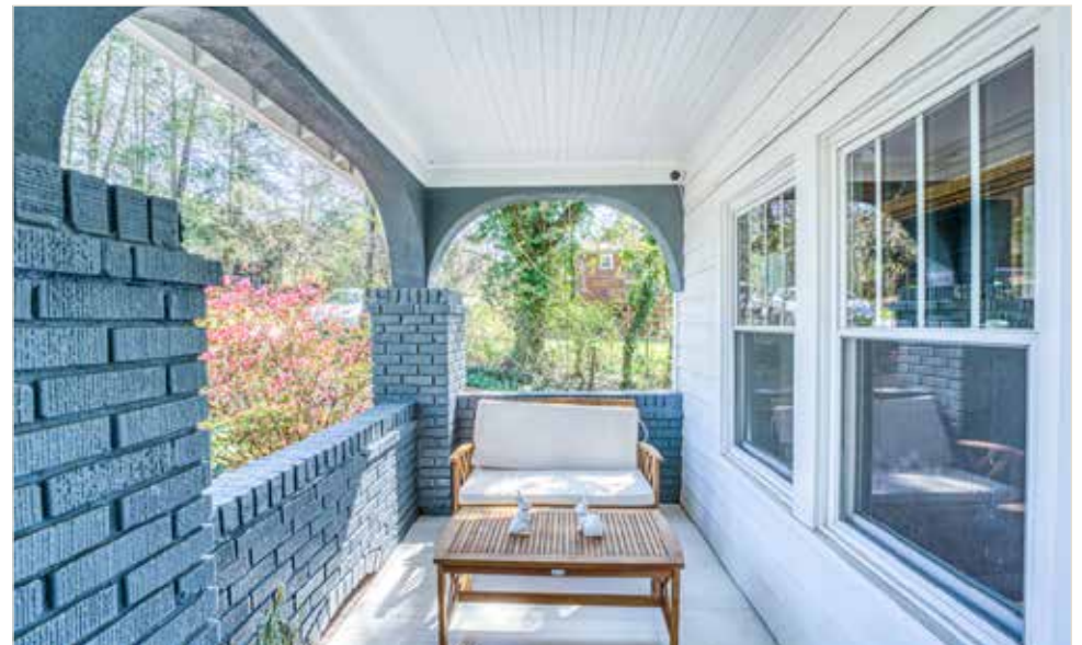
Sit and Read the Morning News