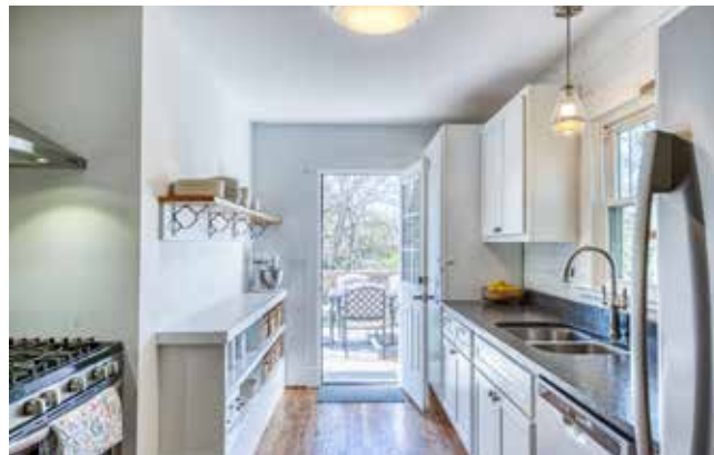
Kitchen Offers Plenty of Room