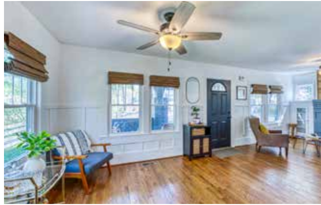
Spacious Front Area