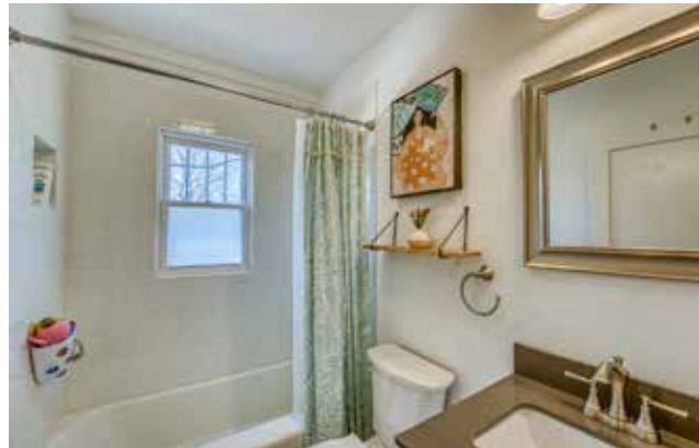
Full Bathroom on Primary Level