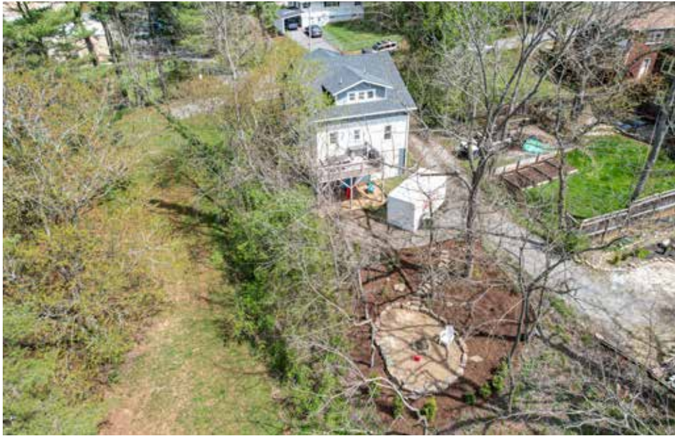
Back of Property as Seen from Above