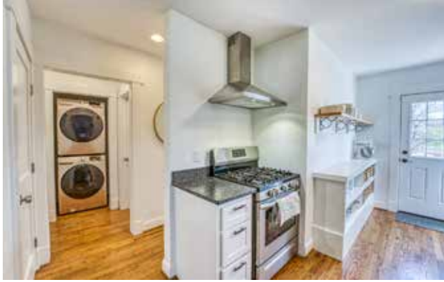
Laundry on Main Level