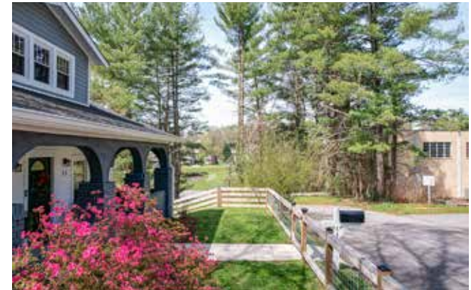
Plenty of Space