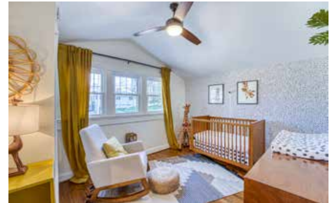
Upstairs Bonus Room