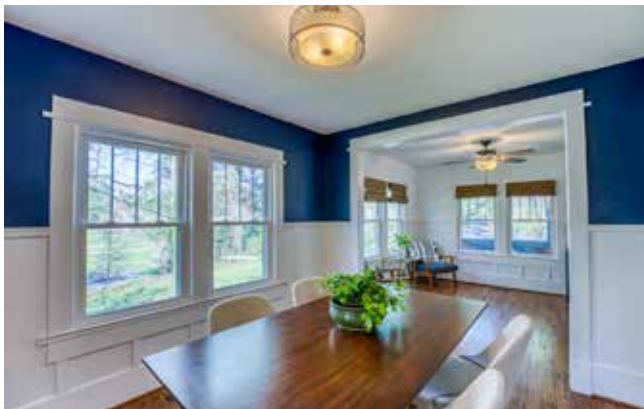
Dining Area off Kitchen