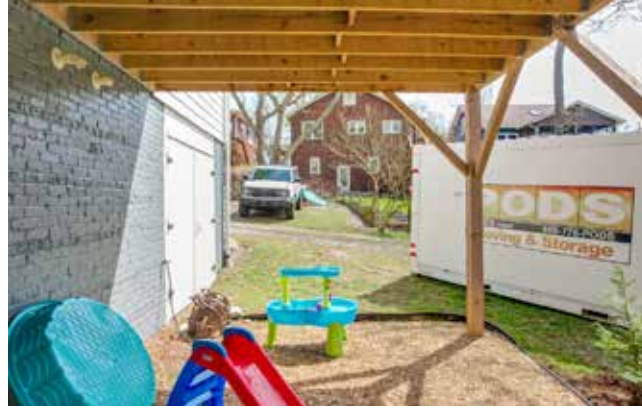
Some Shade and Protection