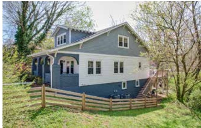
Last Home on the Block