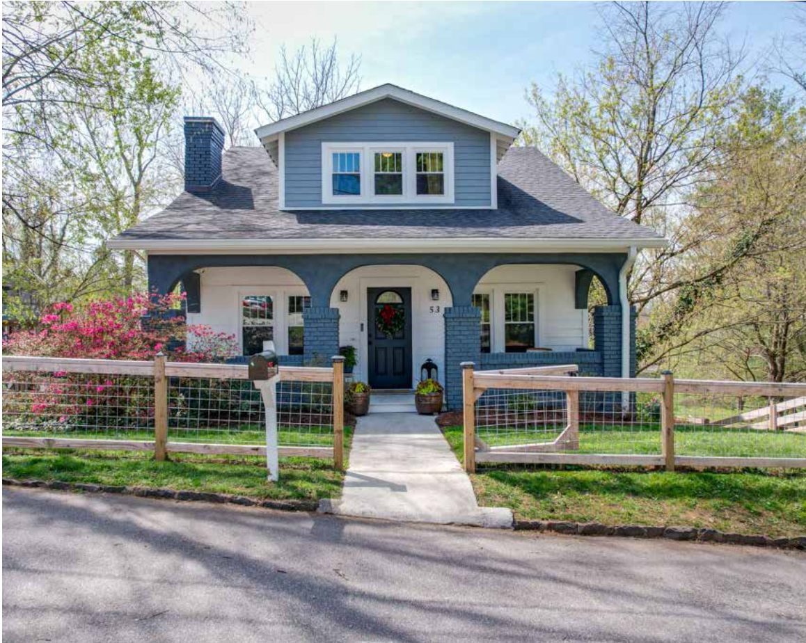
Fenced Front Yard

LOCATION! LOCATION! LOCATION! Classic West Asheville bungalow situated within walking distance to all the shops/restaurants on Haywood Road and in the River Arts District. Home recently renovated, but retains all its classic charm. The newly renovated features include new roof, windows, hardboard siding, hardwood floors, tile bathrooms, local hand-built cottage-style cabinets, stainless steel appliances, granite countertops, two zoned HVAC systems, on-demand gas water heater, electrical, lighting fixtures, plumbing, insulation, and deck. Home features an unfinished basement for extra storage. ADU (accessory dwelling unit) potential; buyer to verify. Enjoy plenty of greenspace as the home backs up to a park. Take a walk/bike ride down to Carrier Park, the greenway trails, River Arts District, or New Belgium Brewery — great food/drink, music, and shops are just minutes away. With two bedrooms on the first floor, you have plenty of space to work at home.