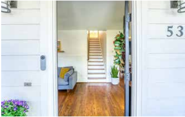
Welcome to 53 Lanning Avenue