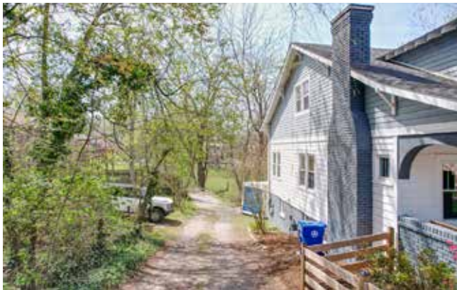
Shared Drive to Parking Space • Additional Street Parking