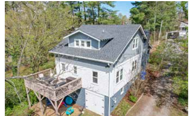
Back View • Entrance to Storage and Basement