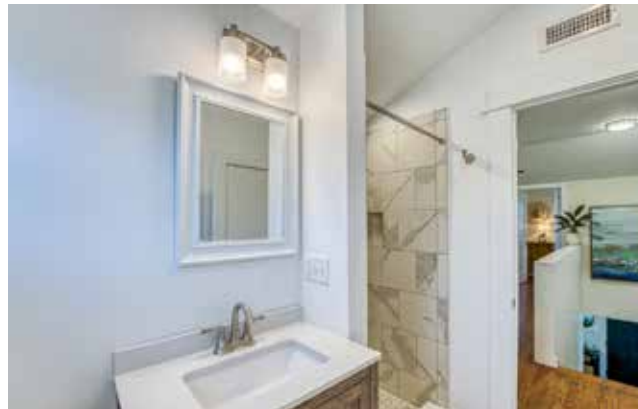
Beautiful Tile Shower in Upstairs Bathroom