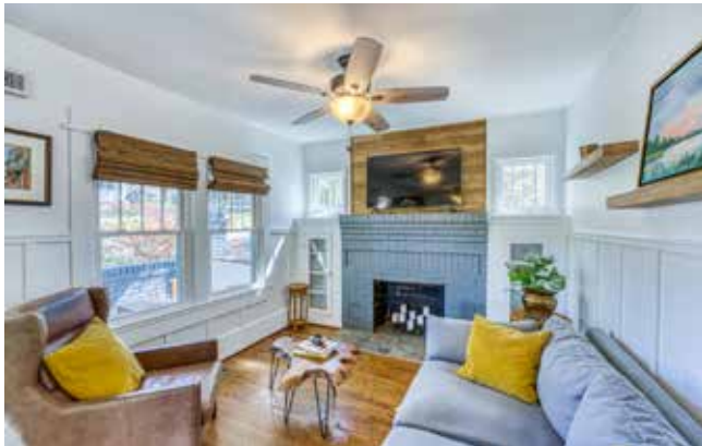
Space to Relax