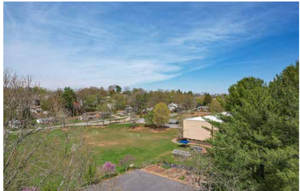
Tucked into Walkable West Asheville, Yet Surrounded by Plenty of Greenspace