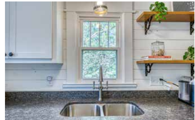
Looks out onto the Greenspace