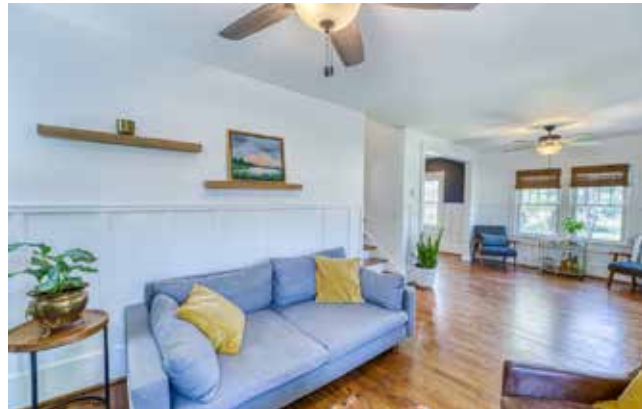
Flow from Living Area into Dining Room