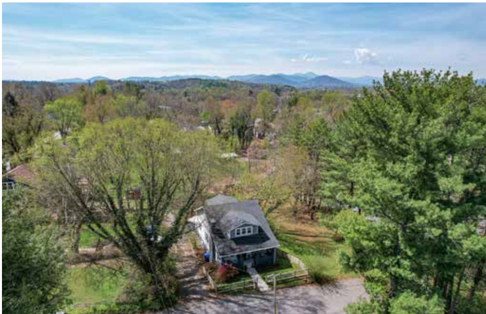
So Much Greenery!