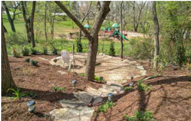
Tranquil Area for a Fire