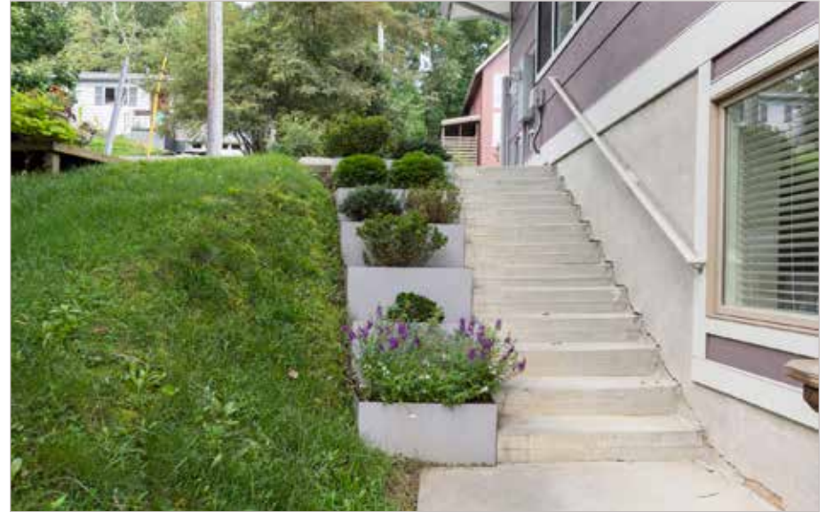
Custom Landscape Planters along Stairs to Homestay Level