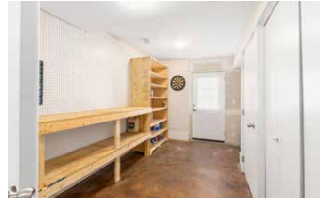
Large Storage Room with Exterior Access