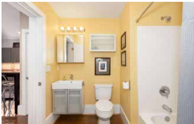
Homestay-Level Full Bathroom

50 GREELEY STREET West Asheville Contemporary Home Asheville, NC, 28806