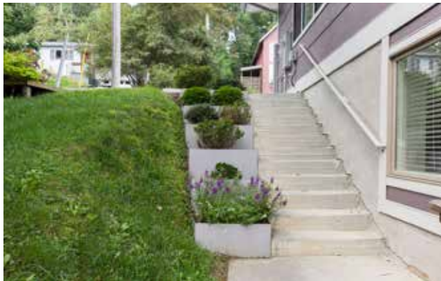
Homestay Level Has Separate Access

50 GREELEY STREET West Asheville Contemporary Home Asheville, NC, 28806