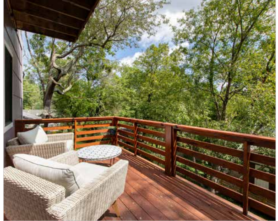
Wonderful Spot to Unwind