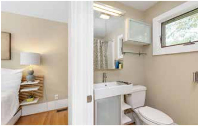
Well-Designed Ensuite Bathroom with Soaking Tub/Shower