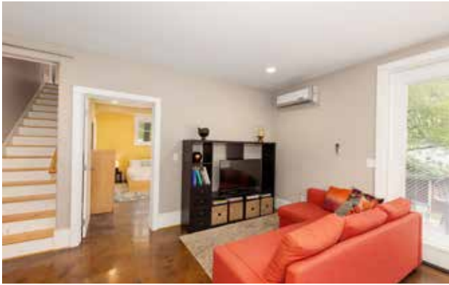
Light and Bright