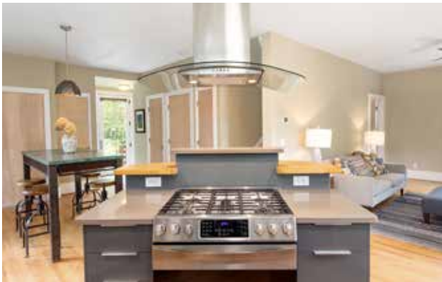
Ideal for Entertaining