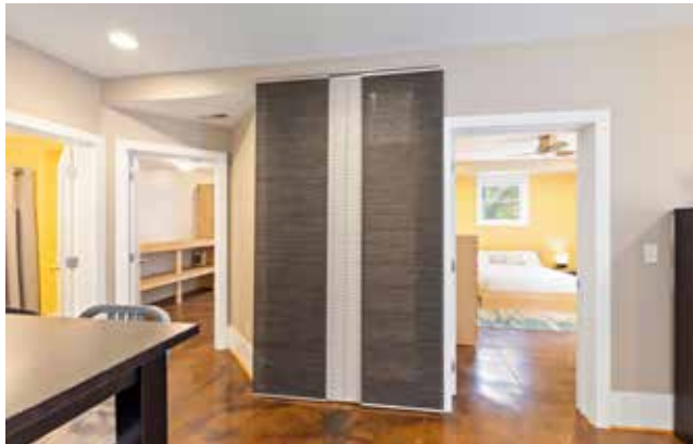
Privacy Blinds + Sound Proofing at Stairwell