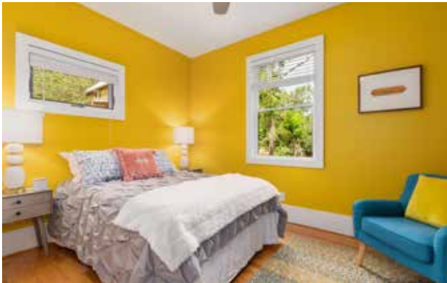
Cheery Main-Floor Guest Bedroom