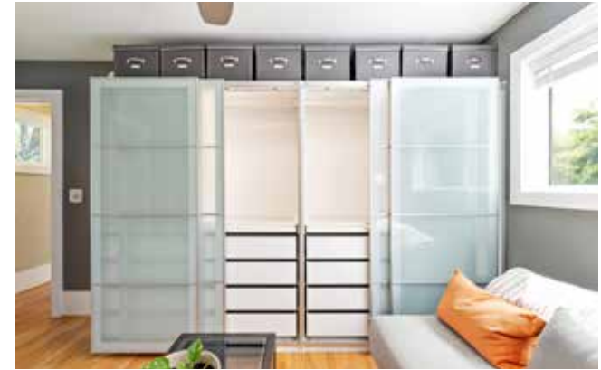
Lighted Wardrobe Closets