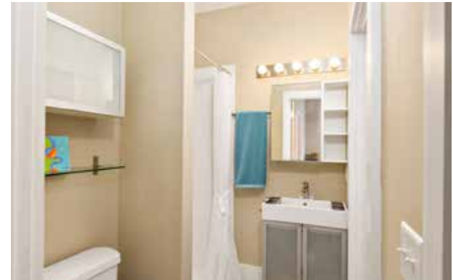
Ensuite Bathroom for Main-Level Bedroom