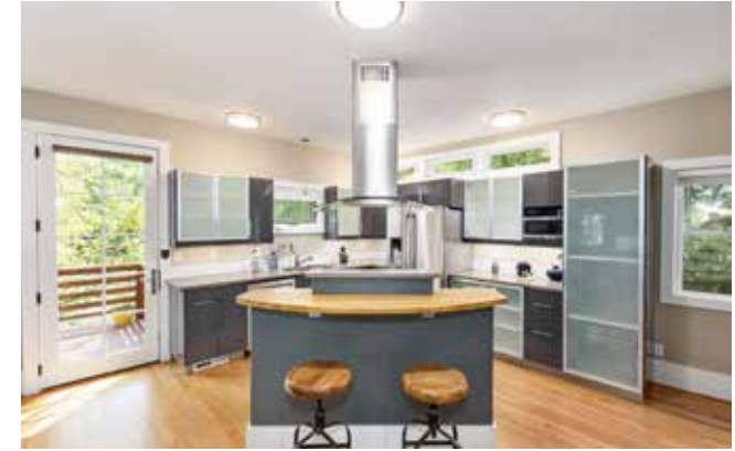
Curved, Wooden Breakfast Bar