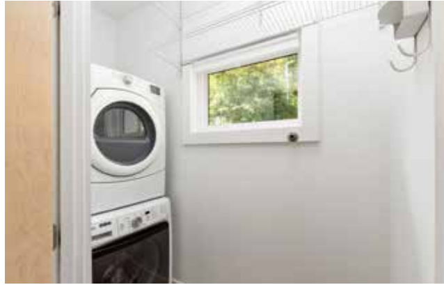
Laundry Closet on Main