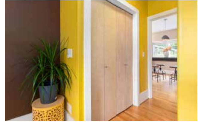
Guest Bedroom Flows to Dining Area