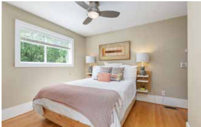
Wooded Views • Private Outdoor Balcony

50 GREELEY STREET West Asheville Contemporary Home Asheville, NC, 28806