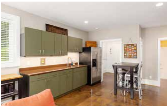
Homestay-Level Eat-in Kitchenette