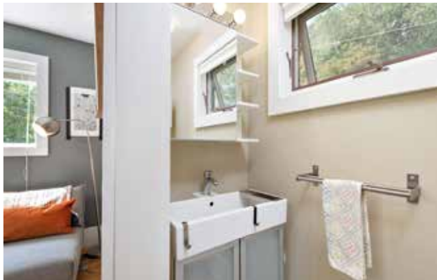
Modern Vanity with Storage