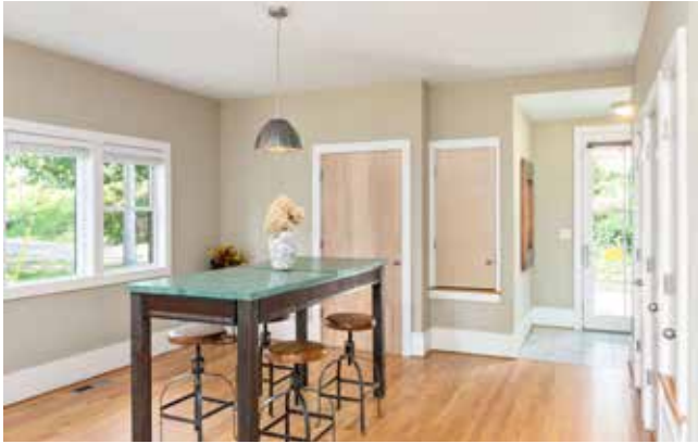
Spacious Dining Area Near Entry