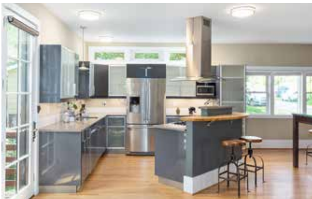
Perfect for the Home Chef