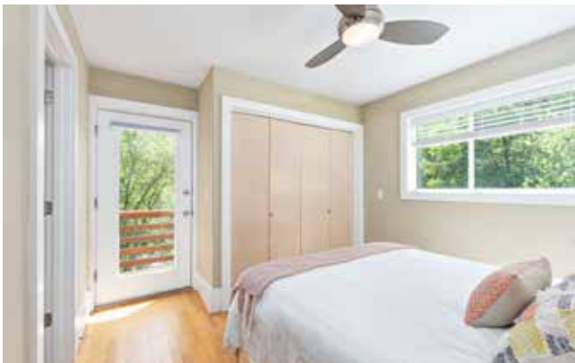
Upstairs Is the Serene Primary Bedroom Suite