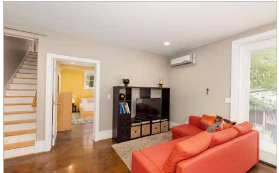
Tall Ceilings and Recessed Lighting — Even in the Lower Level