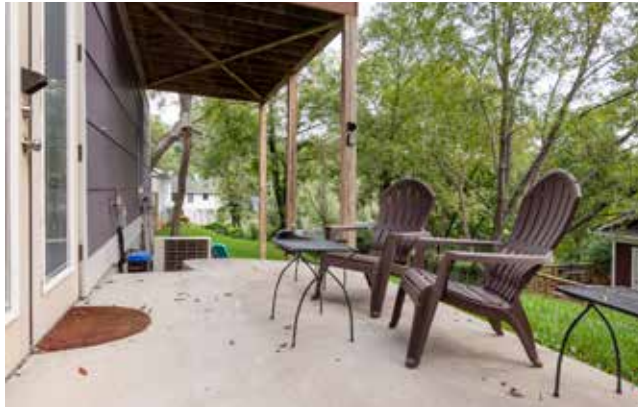
Lower-Level Patio Outside Homestay's Living Area