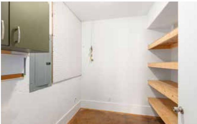
Second Utility/Storage Room