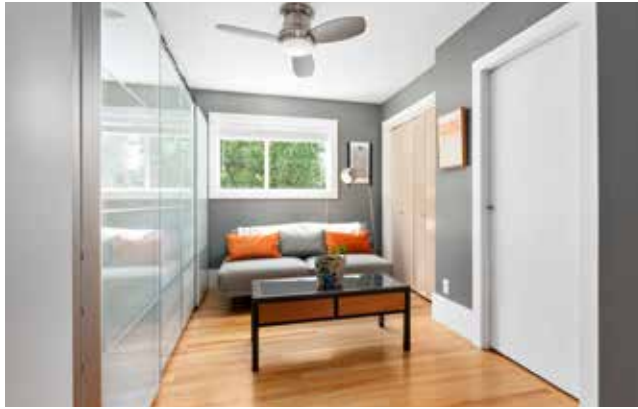
Cozy Second Bedroom