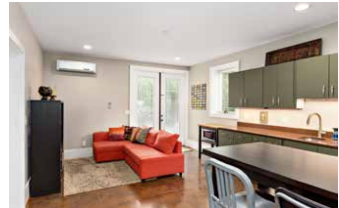
Permitted Homestay/Apartment on Lower Level