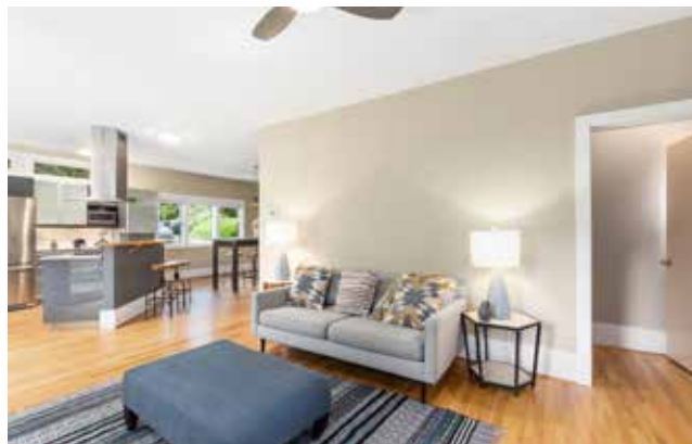
Open Flowing Floor Plan