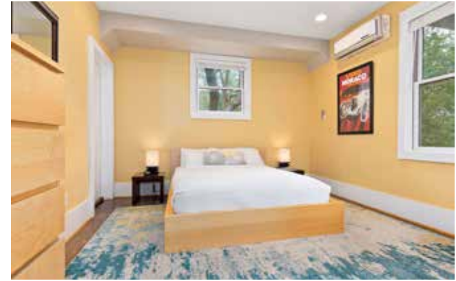
Homestay Level Has Large Bedroom