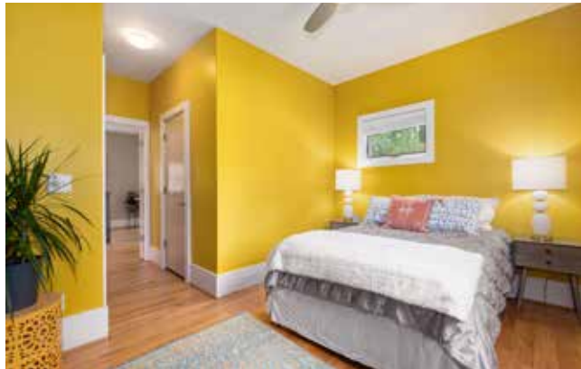
Bedroom Has Access to Full Guest Bathroom