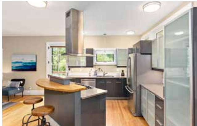
Kitchen Offers Nice Work Flow