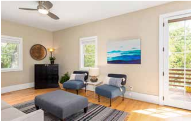
Large Windows • Door Leads to Deck ...