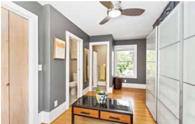
View to the Ensuite Bathroom in Second Bedroom