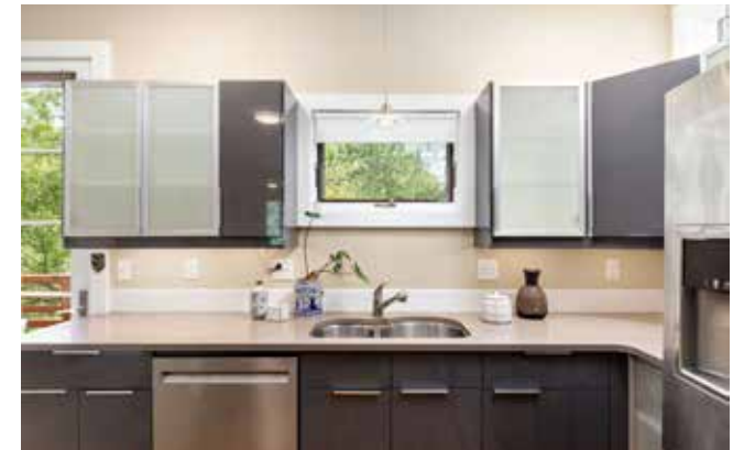
Quartz Counters • Treetop Views