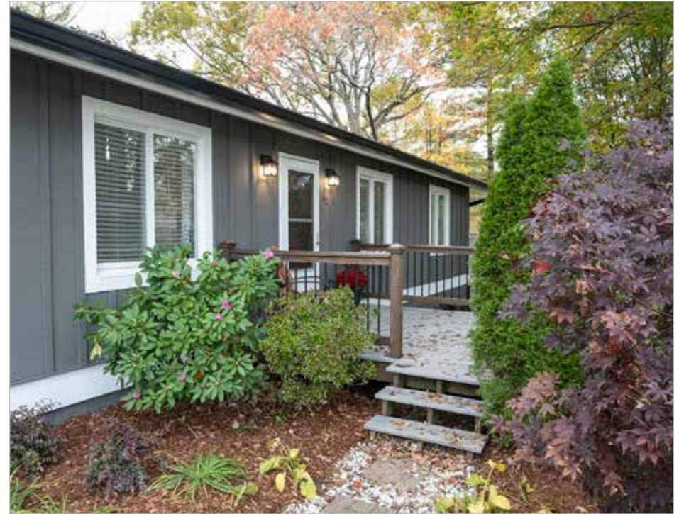
Inviting Entry Framed by Mature Trees and Shrubs