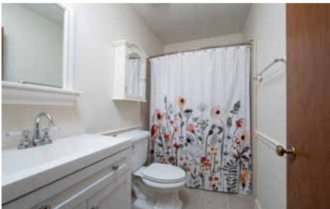
Second Full Bathroom on Main Level