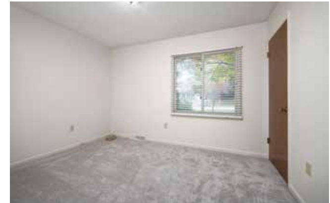
New Carpet in All Bedrooms