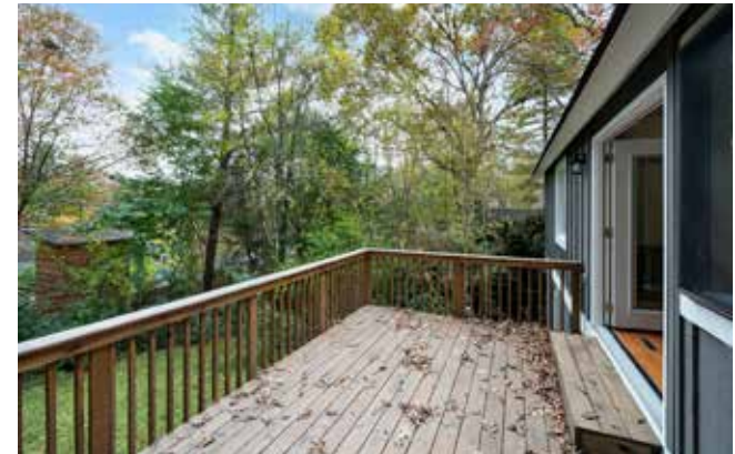
Back Deck Is Great for Grilling