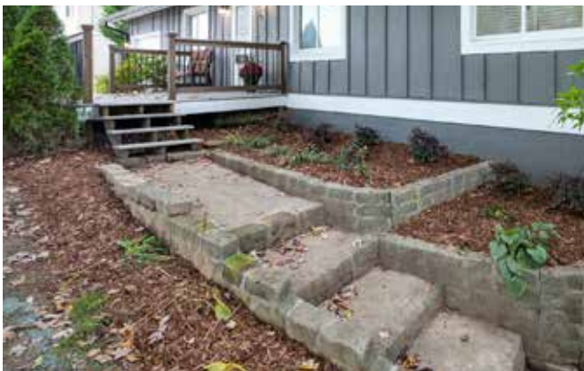
Established Garden Beds and Beautiful Stacked Stone