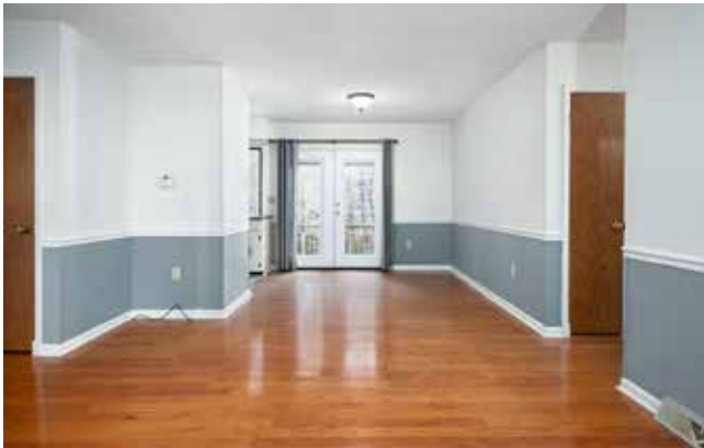
Dining Area with Chair Railing and Back Deck Access