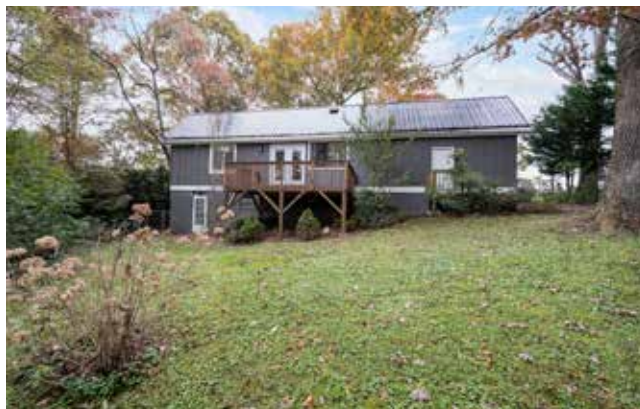
Gently Sloped Back Yard with Space to Gather

42 FIELDCREST ROAD Beautifully Updated Ranch-Style Home Arden, NC 29704