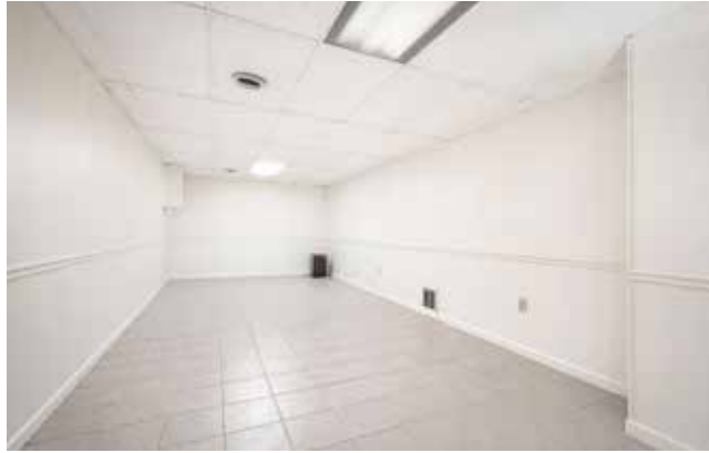
Bonus Room with Endless Possibilities