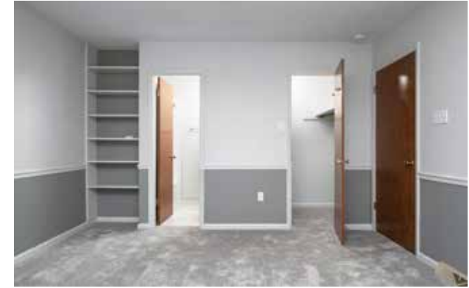
Walk-in Closet, Built-in Shelves and Ensuite Full Bathroom