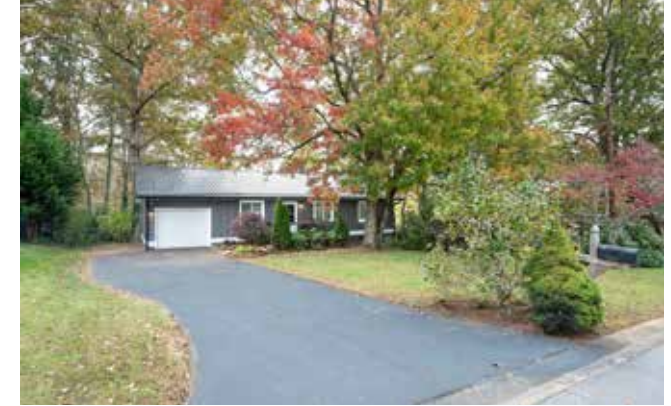
Recently Resealed Driveway

Beautifully updated and well-maintained home in a convenient Arden location. Single-level living boasts a split-bedroom plan that's ideal for privacy, including a primary bedroom suite with an ensuite bathroom and walk-in closet. Too many recent updates to name: completely renovated ensuite bathroom, new flooring in the bedrooms and kitchen, updated fixtures, newer metal roof (2016), fresh interior and exterior paint, and much more. Enjoy outdoor living on your sunny back deck and a spacious yard perfect for gatherings and play. Mature landscaping and established garden beds highlight the care that has been taken for this home. Extra living space in the partially finished basement with interior and exterior access includes a very functional, large workshop/storage area. Hard-to-find one-car attached garage on the main level and excellent proximity to area activities including Bent Creek, the Blue Ridge Parkway, Sierra Nevada Brewing, and Biltmore Park.