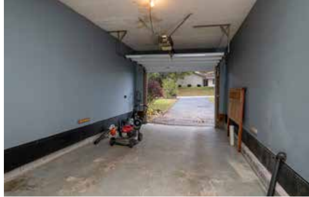
One-Car Garage on the Main Level