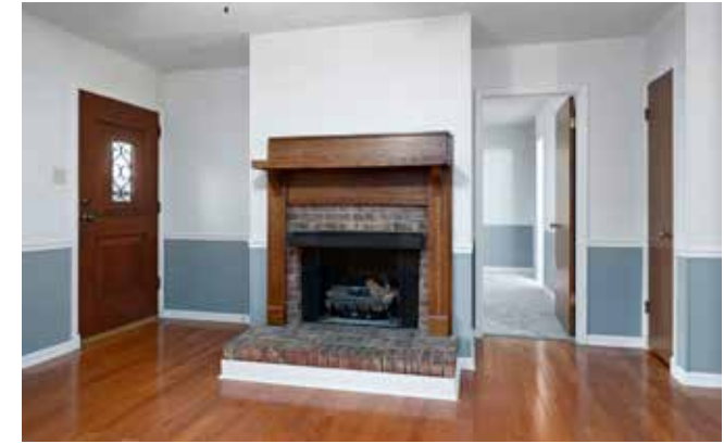
Brick-Surround Gas Fireplace for Chilly Evenings