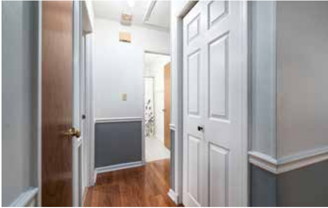
Hallway Connects Two Bedrooms and One Full Bathroom