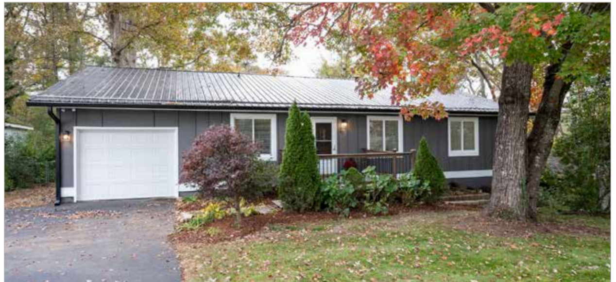
Newer Metal Roof (2016)