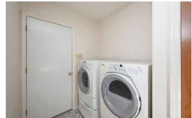
Laundry on Main Level