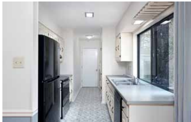
Garage Access from the Kitchen