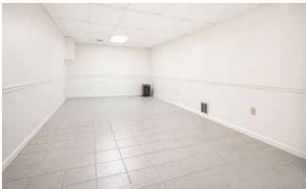
New Tile Flooring in the Bonus Room