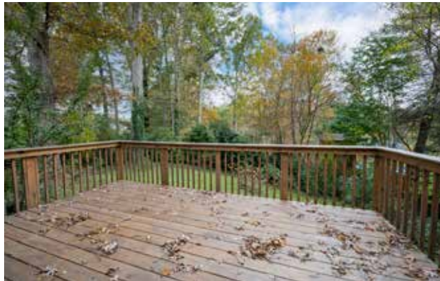
Sunny Back Deck Overlooks Gorgeous Fall Colors