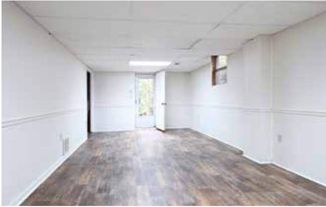
Basement Den with Separate Entrance, New LVT Flooring