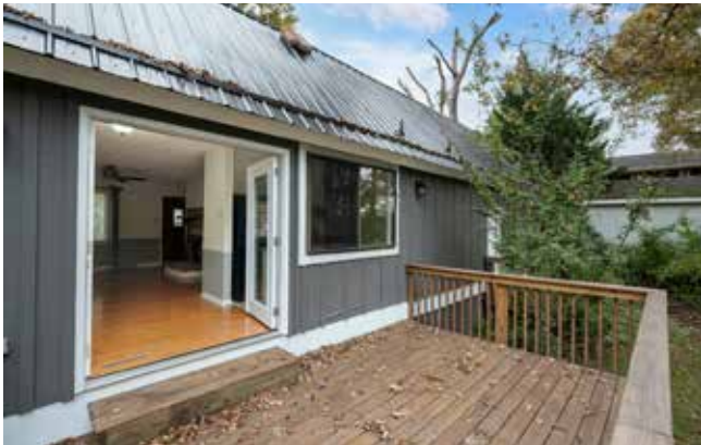
French Doors Bring the Outside Indoors