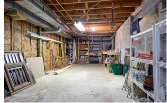
Lots of Storage and Workshop Space