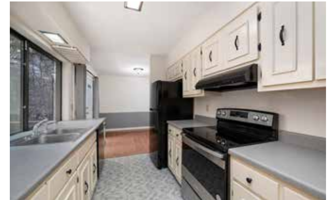
Galley Kitchen Features Newer Appliances