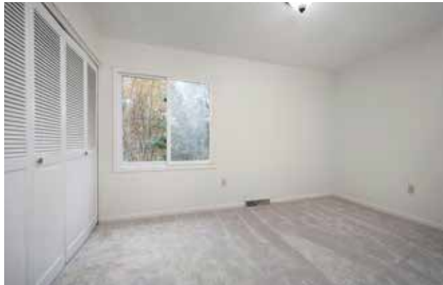
Main-Level Bedroom with Wooded View