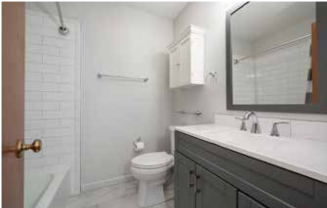
Tastefully Renovated Ensuite Bathroom