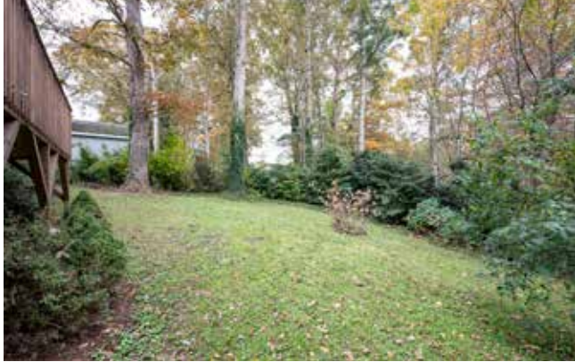
Soaring Mature Trees and Ample Room to Play