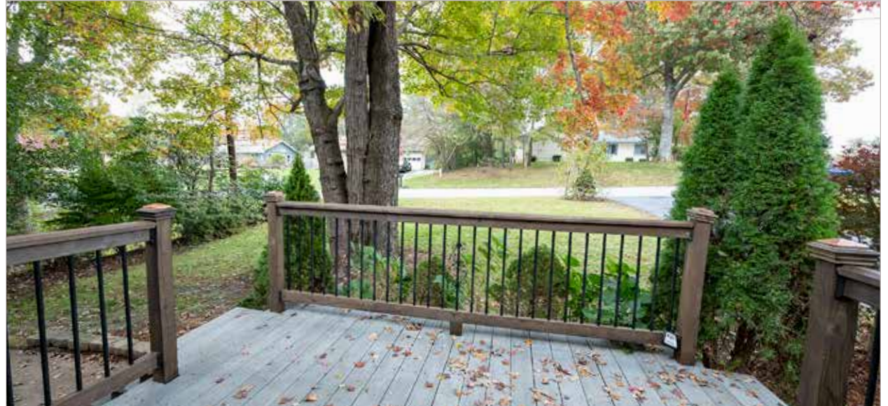
Newly Rebuilt Front Porch