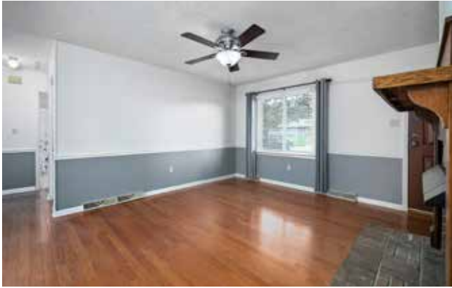
Living Area with Neighborhood Views