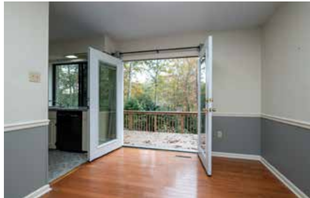
French Doors Open to Back Deck