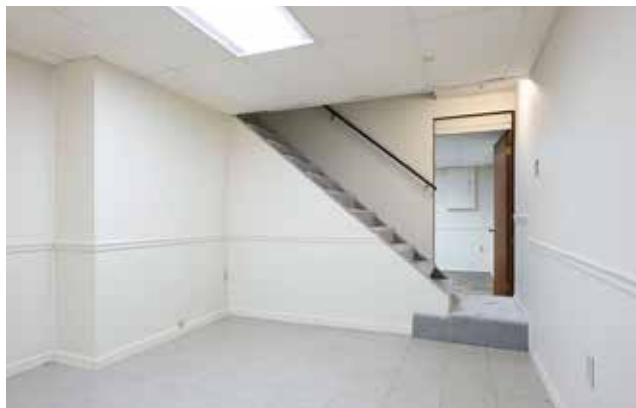
Stairwell Connects Main Level with Basement

42 FIELDCREST ROAD Beautifully Updated Ranch-Style Home Arden, NC 29704