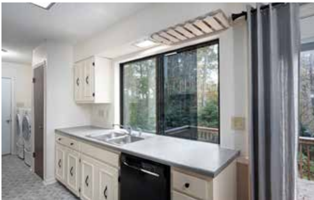
Private View from the Kitchen