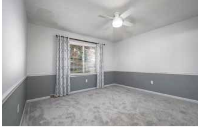
Primary Bedroom with Fresh Paint and Chair Railing