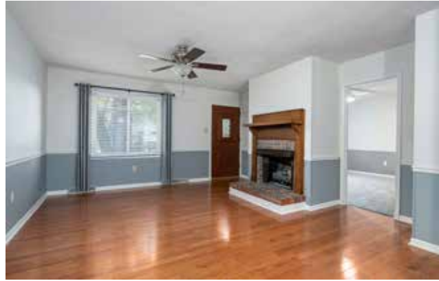
Gleaming Wood Floor and Ceiling Fan in the Living Room