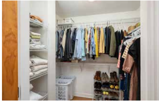
Large Primary Closet