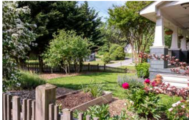
Raised Garden Beds • Blueberry Bushes