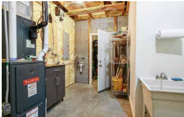
Utility Room Also Provides Storage ...