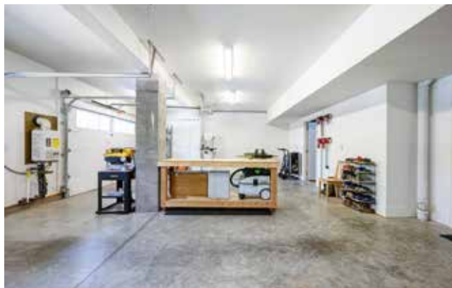
... with Workshop Space

120 DUNWELL AVENUE Immaculately Maintained Modern Bungalow West Asheville, NC 28806