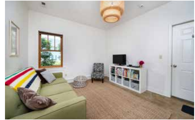
Bonus Room Is Adjacent to the Two-Car Garage