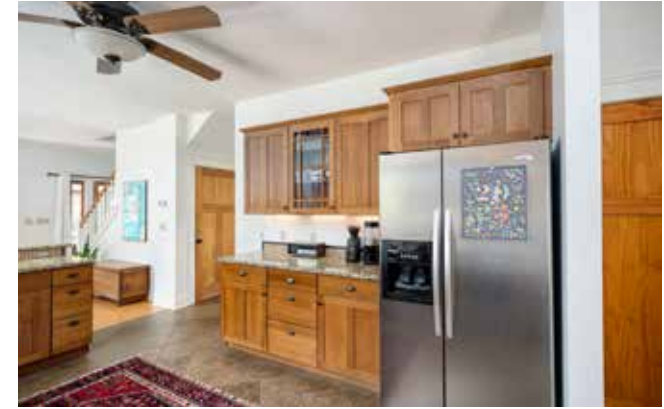
Stainless Steel Appliances