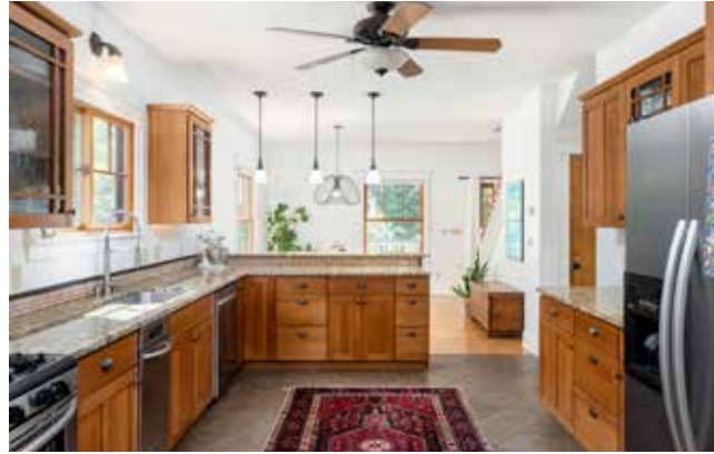
Plenty of Room • Efficient Workflow