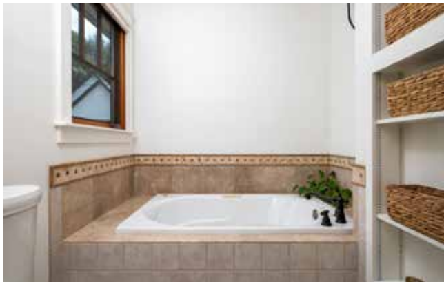
Tilework Surrounds the Primary Bathroom's Tub