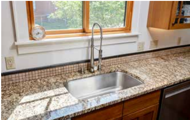
Updated Dishwasher • Ample Countertop Space