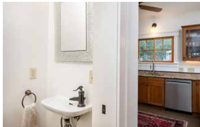
Main-Level Half Bath

120 DUNWELL AVENUE Immaculately Maintained Modern Bungalow West Asheville, NC 28806