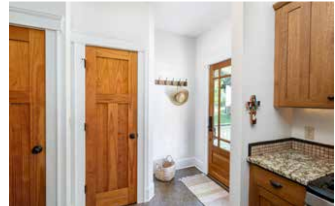
Convenient Side Entry to Kitchen