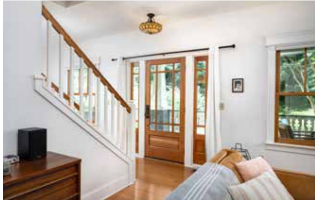
Mission-Style Front Door and Sidelights in Entryway