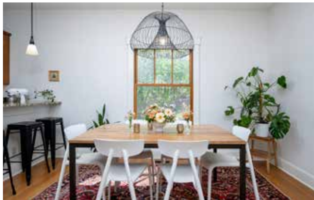
Nine-Foot Ceilings on Main Level