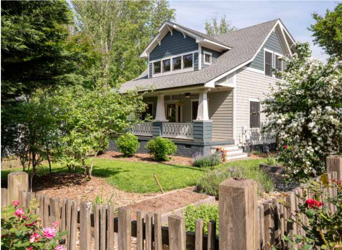
Fenced-in Front Yard

Immaculately maintained modern West Asheville bungalow on a level corner lot with mature landscaping, oversized two-car garage, and ample off-street parking. Built in 2007, this Energy Star-certified home boasts gas on-demand water heater, whole-house charcoal and UV light water filtration, stainless steel appliances, quarter-sawn oak cabinets, and a primary bedroom suite on the main level. Other interior features include nine-foot ceilings in the basement and main level, gas fireplace with hand-tiled surround, built-in bookshelves, bamboo flooring, and jetted tub in the primary bathroom. Sit on the covered front patio overlooking the fenced-in front yard with raised bed gardens and large blueberry bushes — or enjoy a short walk up to all the shops and restaurants on Haywood Road. All custom cellular shades and washer/dryer will convey.