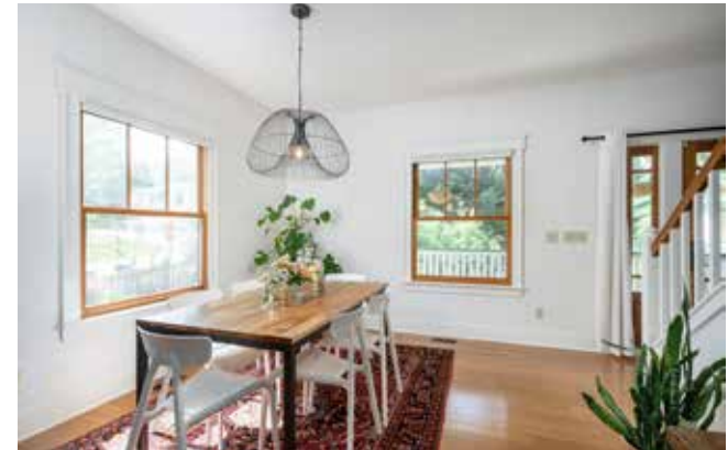
Lots of Natural Light