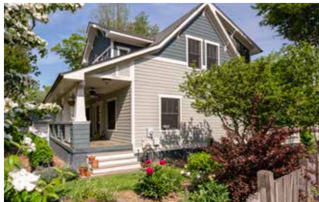
This Home Cuts a Fine Figure from Any Angle