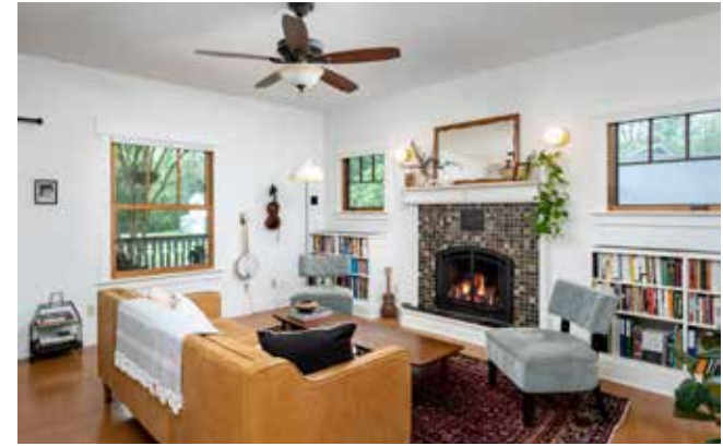
Living Room with Wood Floors