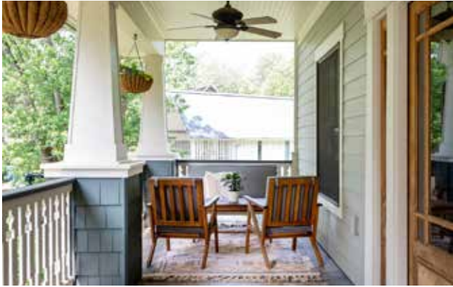
Come on Inside!