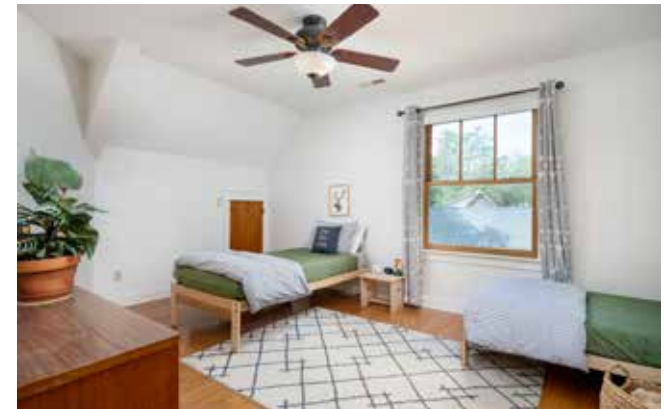
Second Upstairs Bedroom