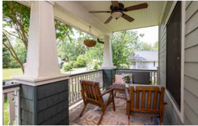
Covered Front Porch with Ceiling Fan