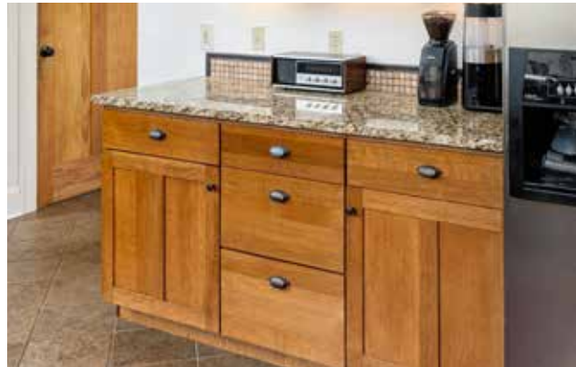
Quarter-Sawn Oak Cabinetry