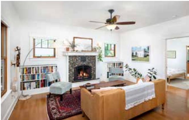
Gas Logs with Hand-Tiled Surround