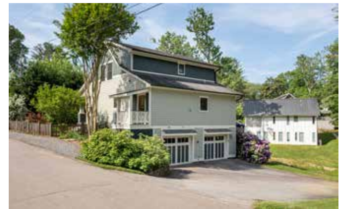
Two-Car Garage • Ample Off-Street Parking