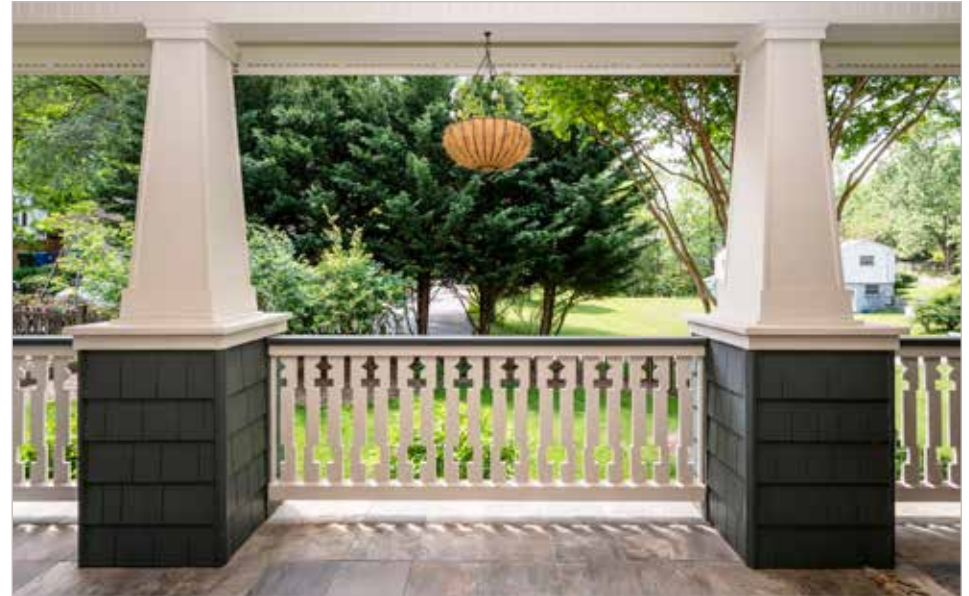
Relax on the Tiled Front Porch