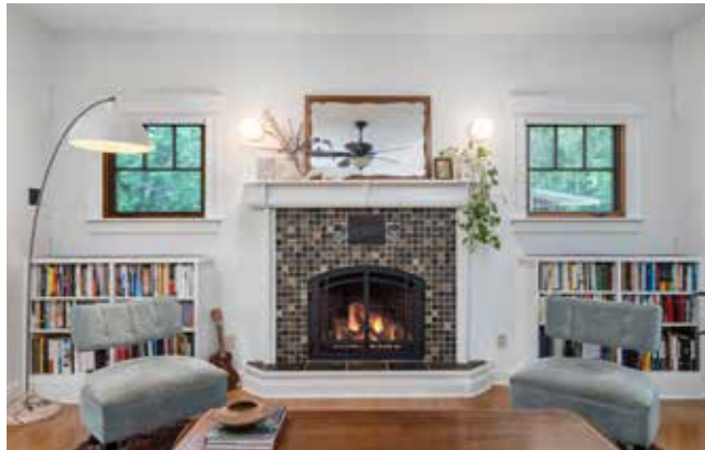
Fireplace Is Flanked by Built-in Bookshelves