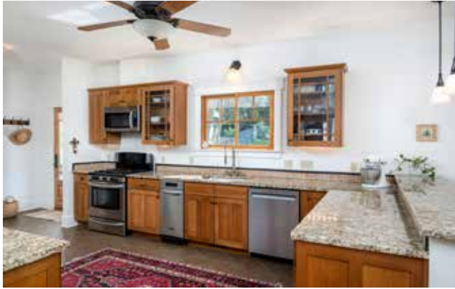
Large Kitchen with Granite Countertops