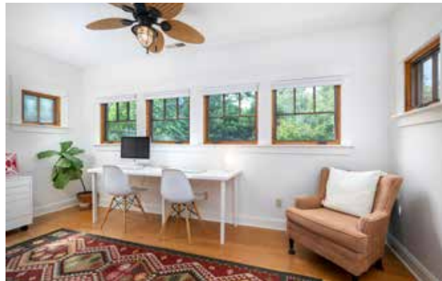
Upstairs Front Bedroom