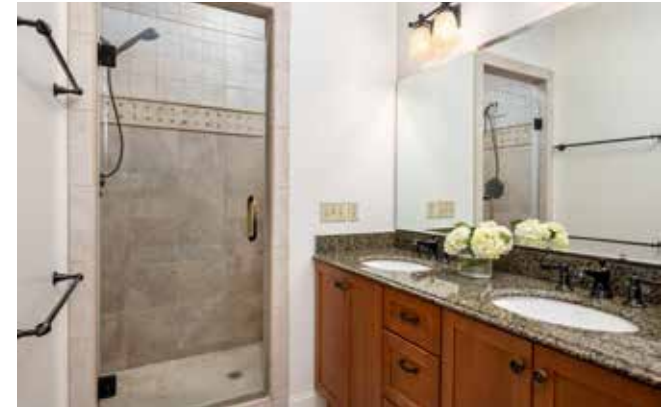
Ensuite Bathroom • Step-in Shower and Dual Vanity