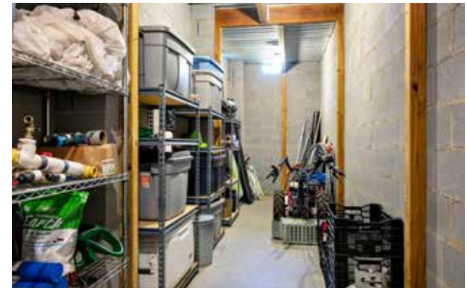
... and There Is Additional Storage under the Front Porch