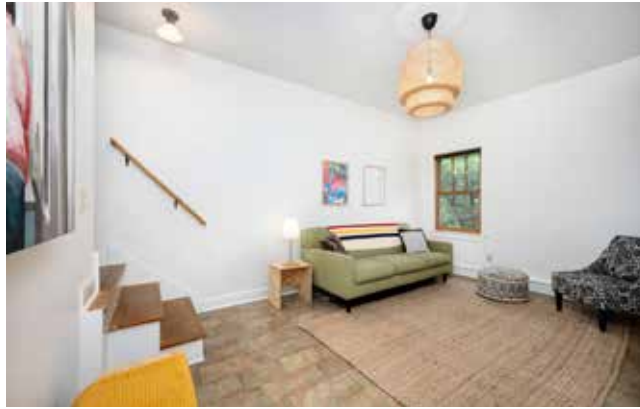
Basement-Level Bonus Room