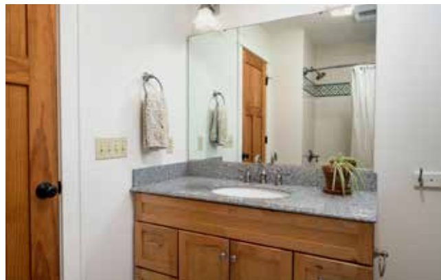
Upstairs Shared Bathroom

120 DUNWELL AVENUE Immaculately Maintained Modern Bungalow West Asheville, NC 28806