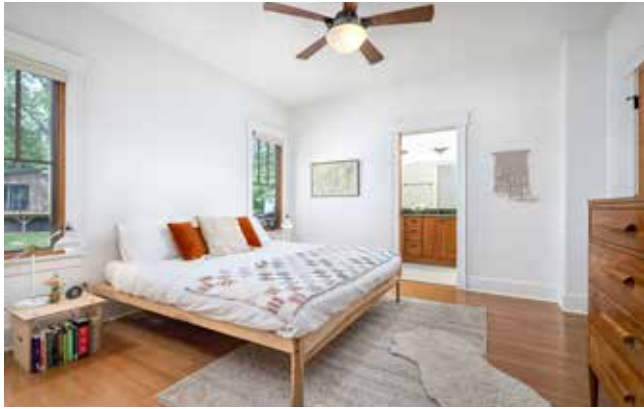
Primary Bedroom on Main Level