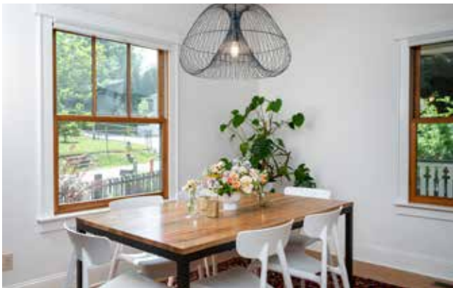
Dining Area with High-End Light Fixture