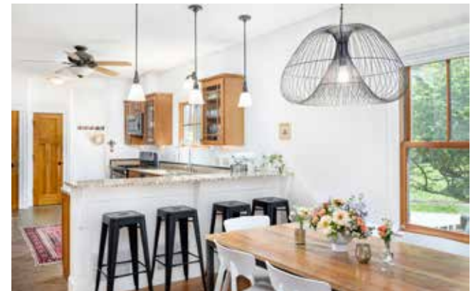
Open Floor Plan