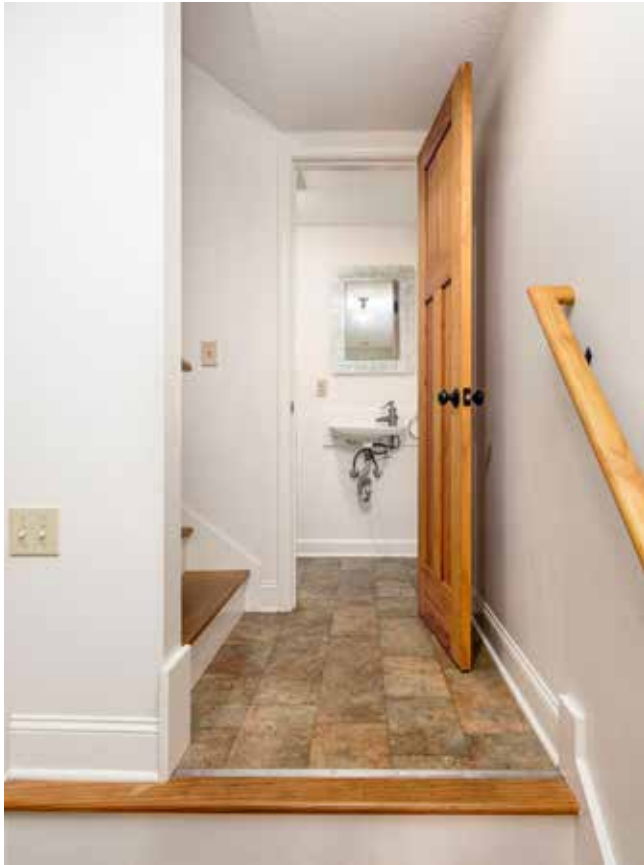
Basement Half Bathroom Is Just off the Stair Landing