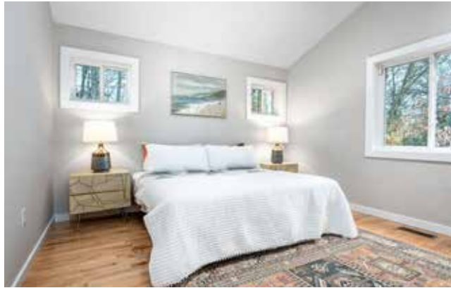
Large Bedroom with Vaulted Ceiling Gets Great Light