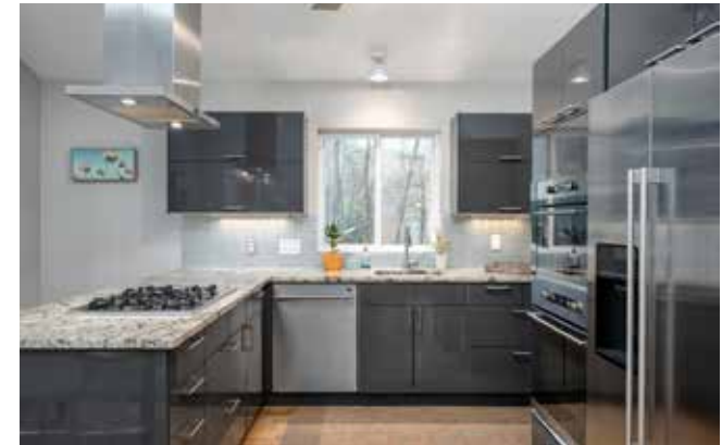
Lots of Cabinet and Countertop Space