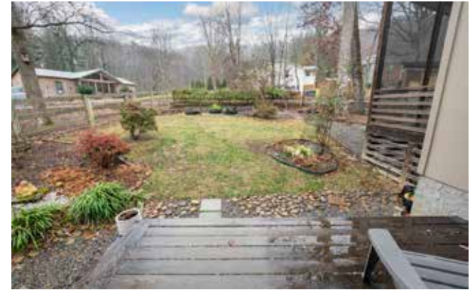
Lush Yard and Gardens Yearn for the Enthusiast