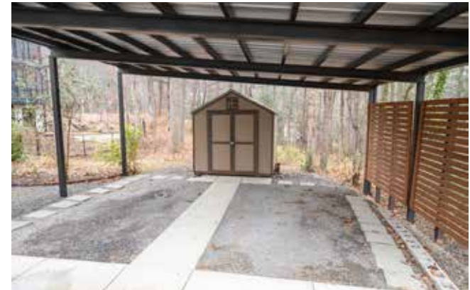
Dual Carport and Storage Shed for Tools and Toys