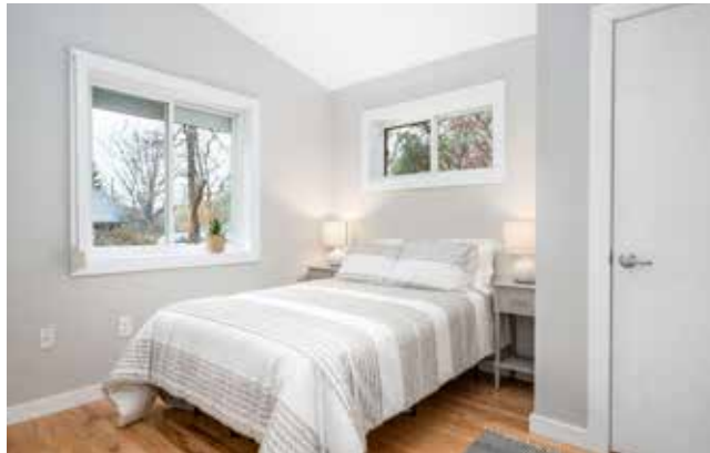
Second Bedroom or Home Office