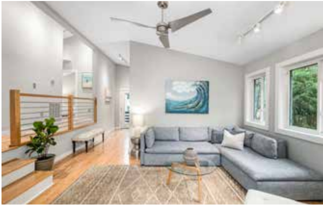
Natural Light Floods the Home