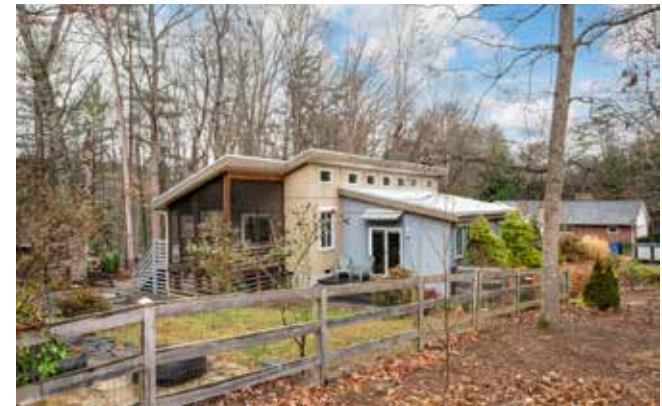
Contemporary Modern Home with Fully Fenced Yard