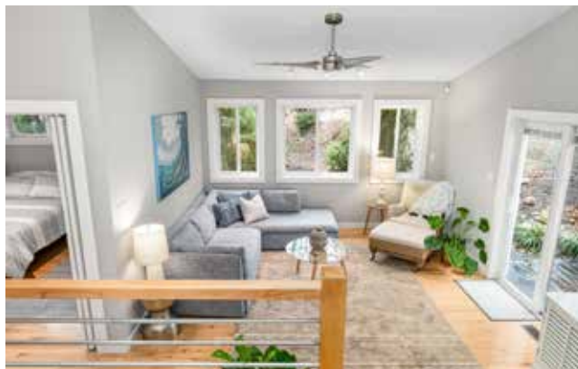
Vaulted Ceilings Brighten the Home

5 DIGGES ROAD Contemporary Home in Kenilworth Asheville, NC 28805