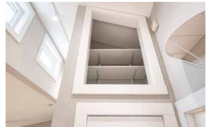
Extra Storage for Convenience