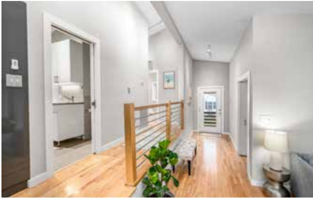
Landing Connects Bedroom and Living Area