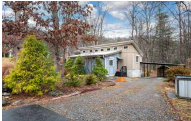
Mature Landscaping and Plenty of Parking