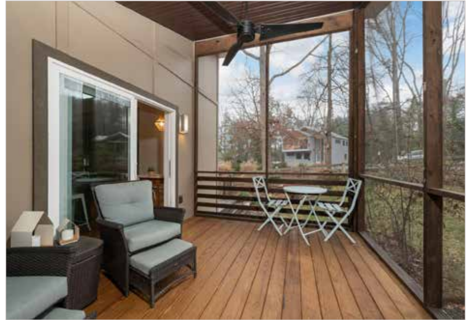
A Quiet Space for Neighborhood Gazing