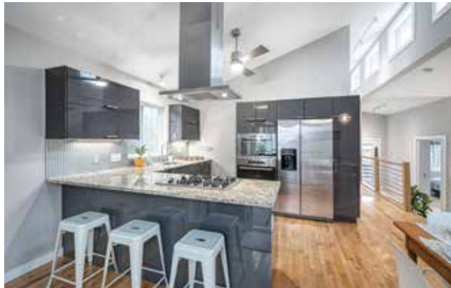
Modern Kitchen • Granite Counters, Gleaming Appliances