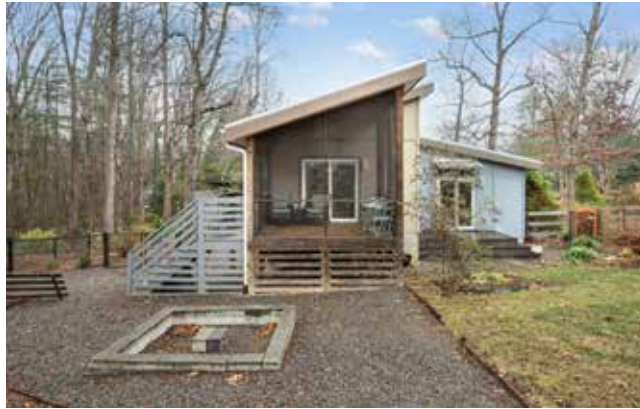
Truly Unique Design with Endless Possibilities