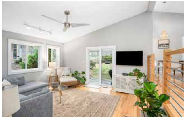
Access to the Fenced Yard from the Living Room