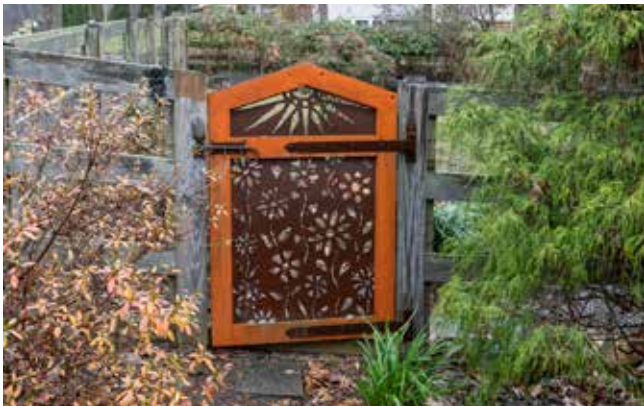
Welcoming, Swinging Gate Opens to an Urban Oasis