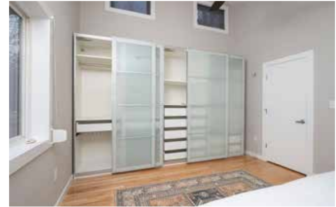
Wall-Mounted Closet + Garment Storage