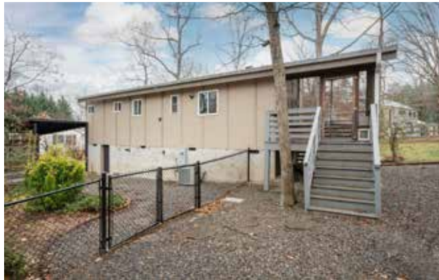
Durable Siding, Crawl space Access, and Porch Stairs