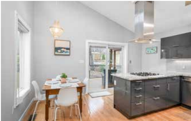
Easy Screened Porch Access