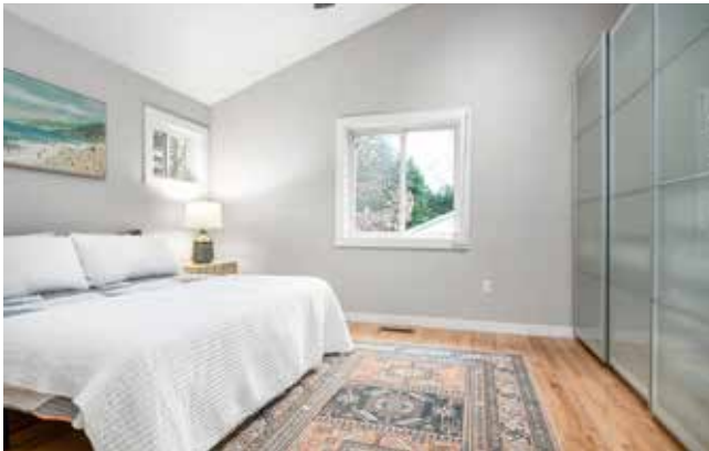
Modern Closet Doors