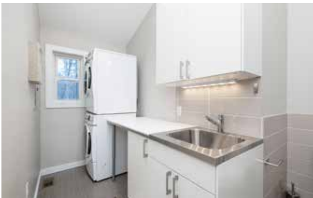
Efficiency Meets Style with Laundry/Powder Room