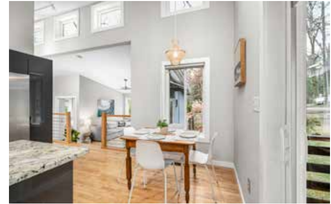
Dining Nook off of Kitchen