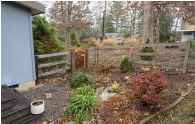
Established Gardens Highlight the Oversized Lot