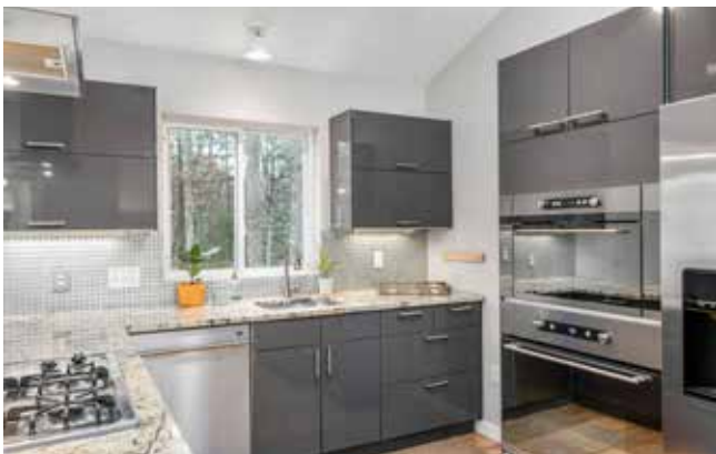
Wooded View from the Kitchen