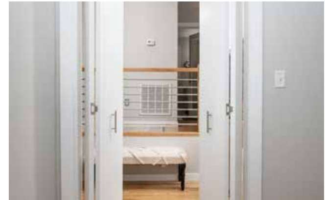
Attention to Detail Abounds