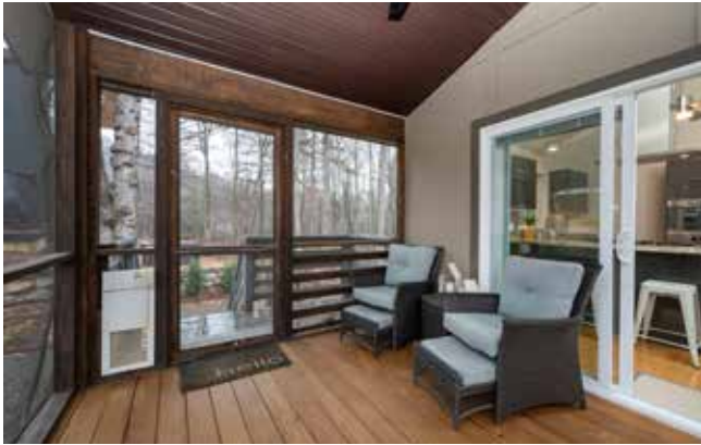
Screened Back Porch for Relaxing