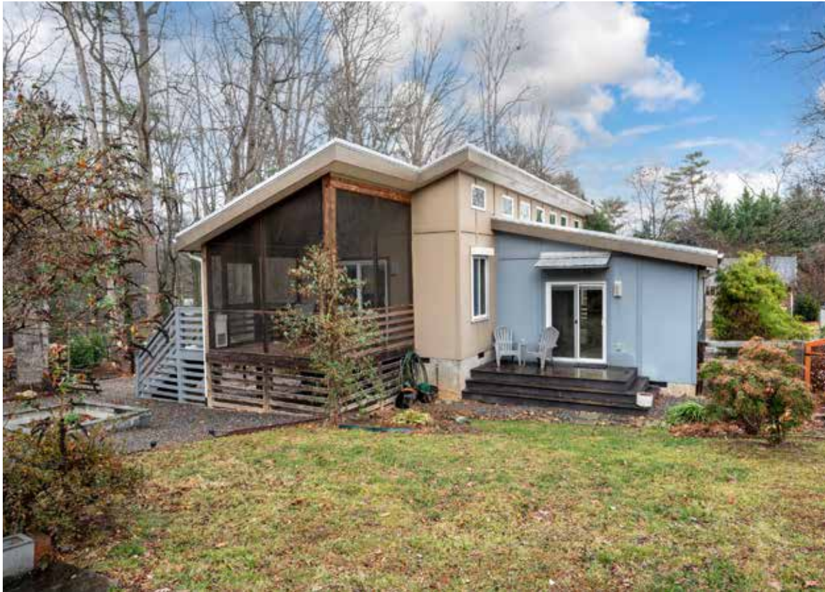
Abundant Outdoor Living Includes a Spacious Yard and Screened Back Porch

A unique opportunity in the desirable Kenilworth neighborhood. Minutes to downtown Asheville, this contemporary, like-new home is tucked away on a quiet, no thru-traffic street. Great proximity to neighborhood parks, Mission Hospital, Biltmore Village, and the Blue Ridge Parkway. The oversized lot boasts mature trees, lush gardens, and established beds ready for the garden enthusiast. Blending style and efficiency, this home boasts vaulted ceilings, gleaming wood and tile floors, and a multitude of windows for great natural light. Move-in-ready home is low-maintenance, allowing more time for work and play. Entertain from the modern kitchen and bright living room while enjoying the outdoors from the screened back porch that overlooks the spacious, fenced yard. Two bedrooms, one full bathroom, and a powder room on the main level. Great storage with a large shed and tall sealed crawlspace for tools and toys.