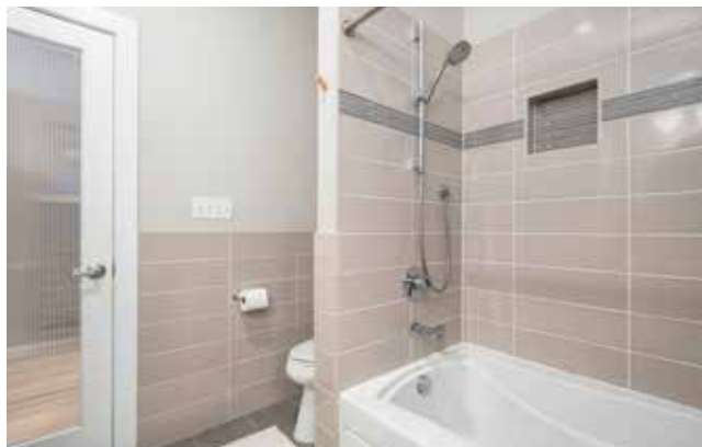
Full Bathroom with Tile-Surround Shower + Tub