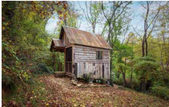
Hidden Gem on Property