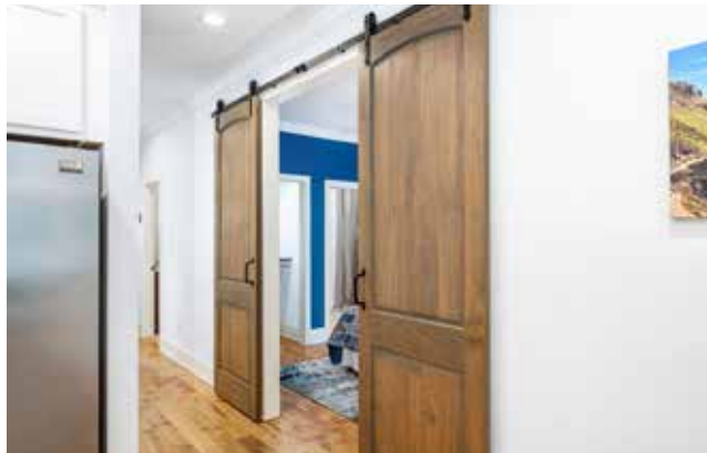
Ideal Floor Plan with Separate Suites