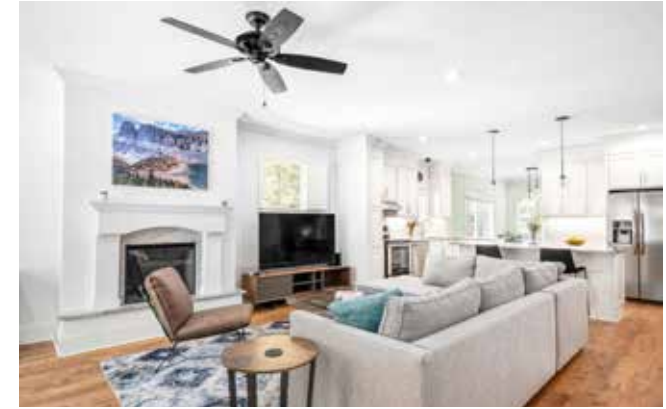
Modern Open Floor Plan