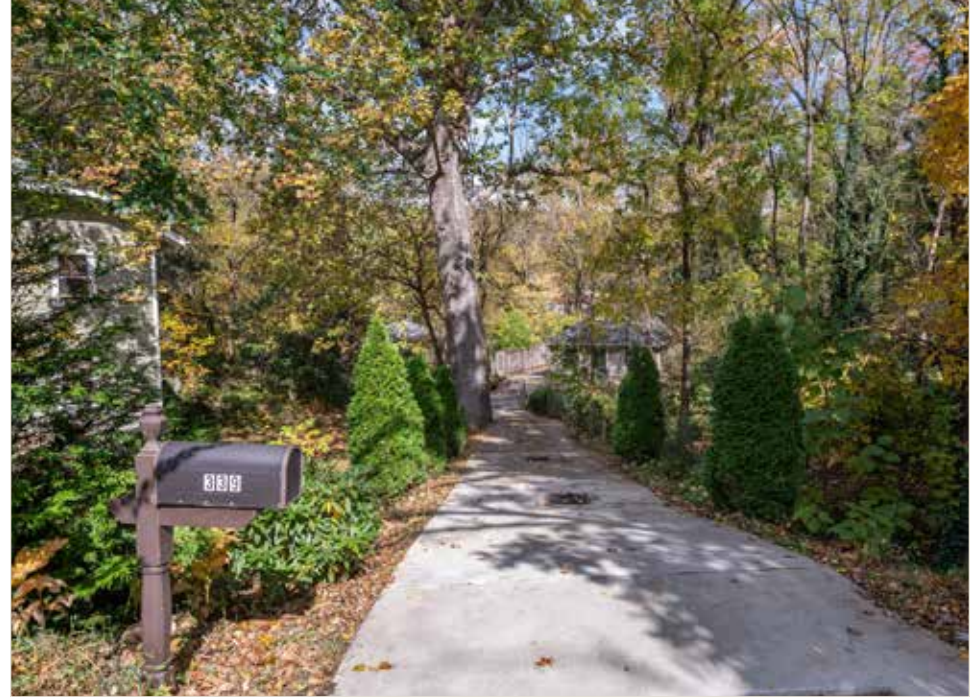
Steps from Montford Park with Tennis, Pickleball and Basketball