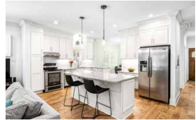
Spacious Kitchen Island