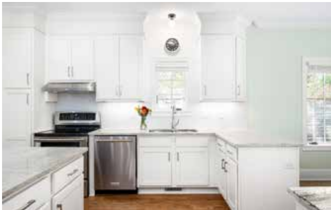
Crisp White Cabinetry and Stainless Steel Appliances