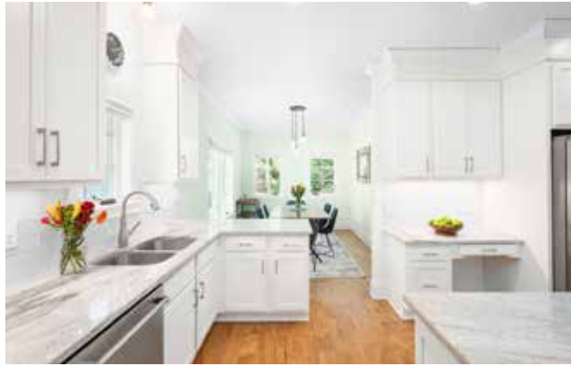
Beautiful Hardwood Floors