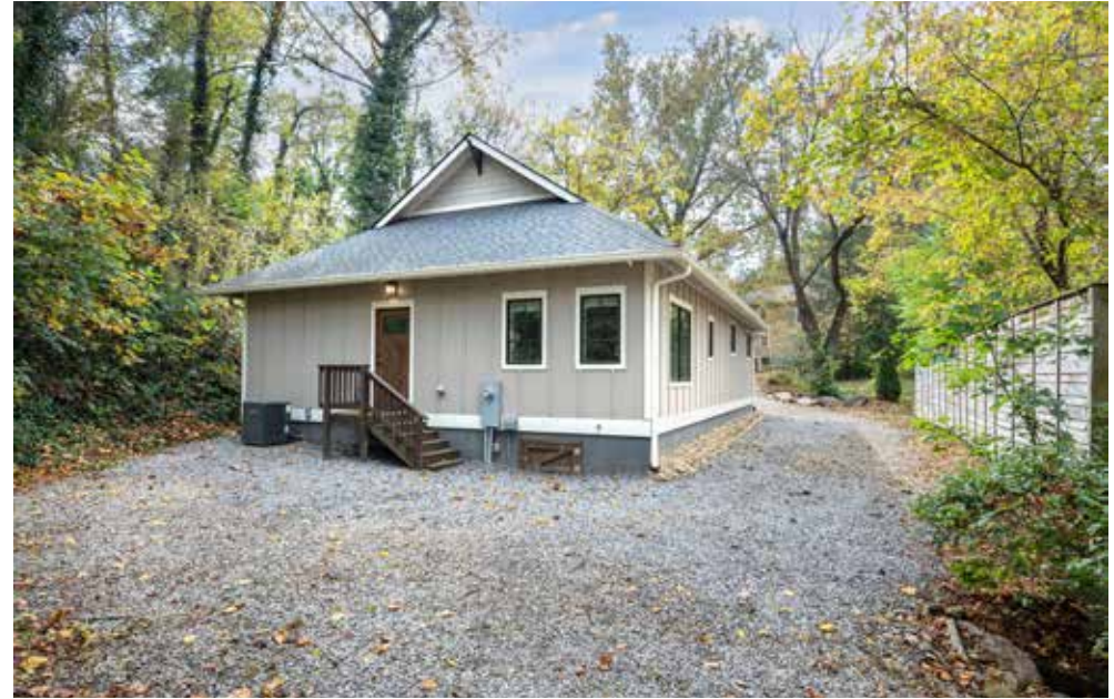
Fully Encapsulated Crawlspace

Private and meticulously maintained 2016-built home in Asheville's popular Montford neighborhood. Just steps to downtown Asheville, UNCA campus and botanical gardens, and the Reed Creek Greenway. This lovely home sits close to the Montford Park and its recreational amenities. Home features two bedroom suites, a modern open floor plan, and beautiful finishes throughout. Attic space offers abundant storage or possible expansion opportunities, plus property has plenty of parking in front and back. Screened-in cabin is the hidden gem of the property, along with a flat backyard for play or pets. See brochure, floor plan, and walk-through tour video for more details. All furnishings are negotiable.