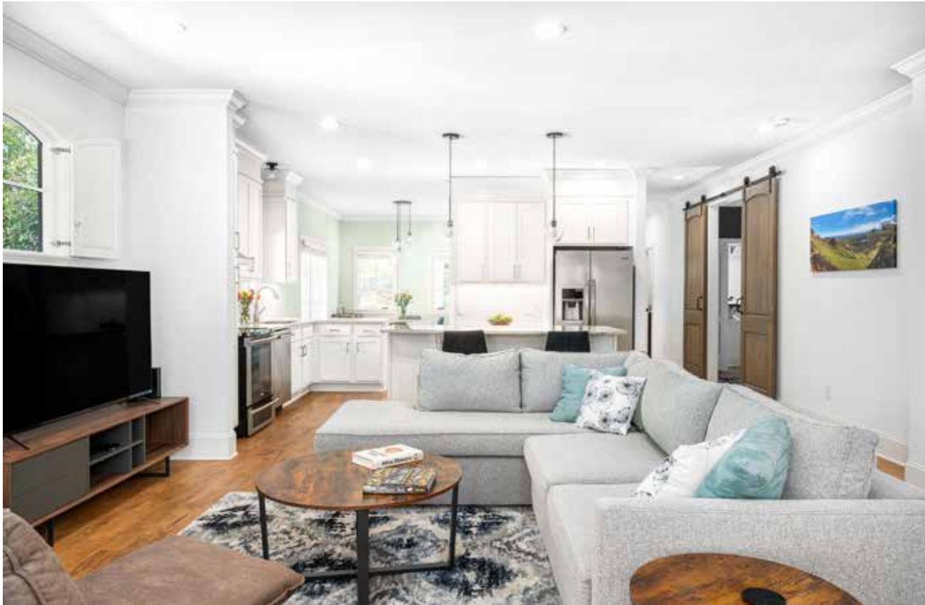
Ideal Floor Plan for Hosting Friends