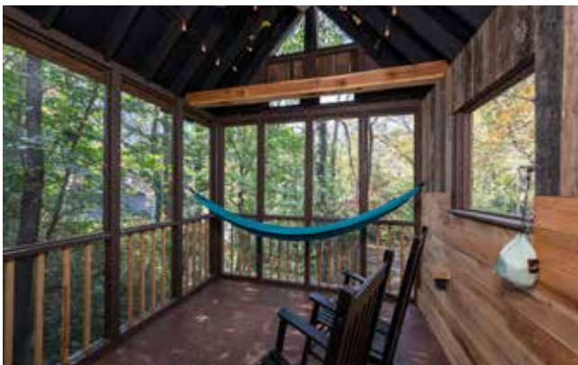
Perfect Spot to Relax