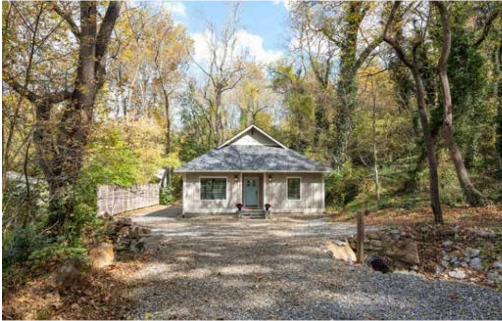
Home Sits Privately Below the Road • Plenty of Parking Front and Back