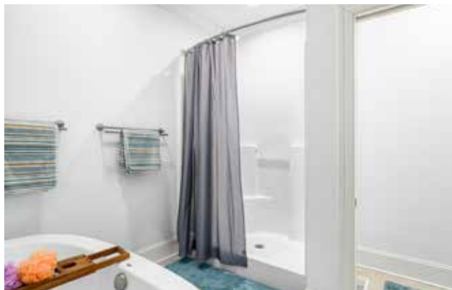
Primary Bath Includes Walk-In Shower...