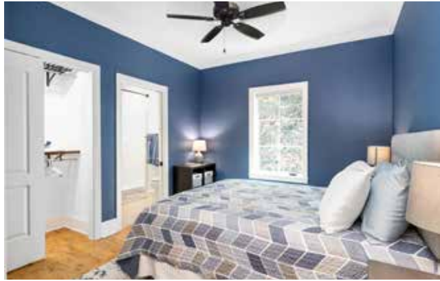
Second Bedroom Suite