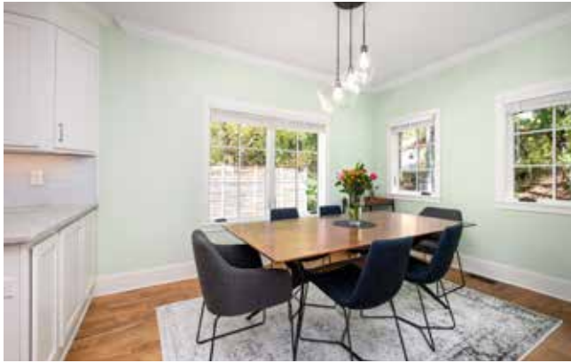
Lovely Dining Space Off the Kitchen