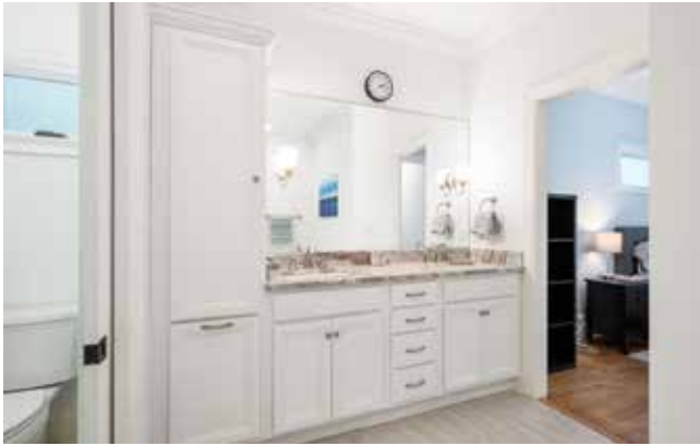
Primary Bath w/ Large Double Vanity and Linen Cabinet