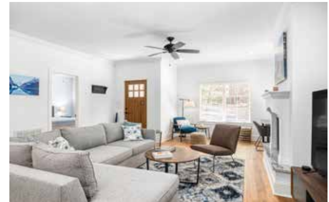
All Furnishings Negotiable