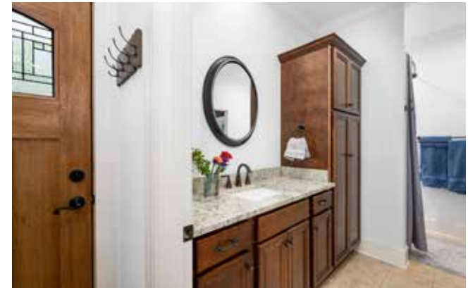
Plenty of Bathroom Storage