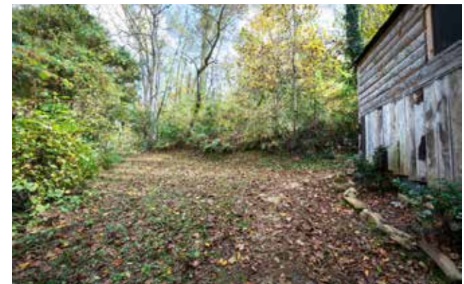
Flat Backyard for Play or Pets