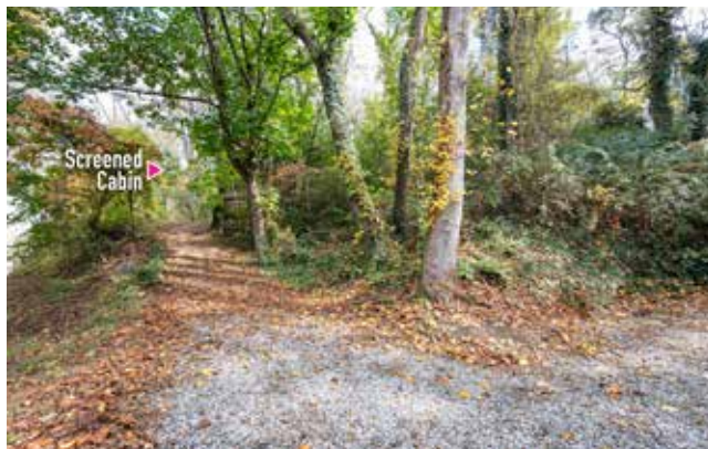
Gravel Path to Screened Cabin