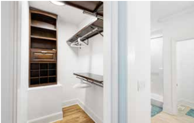
Custom Walk-In Closet