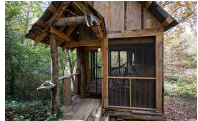
Screened Cabin in Private Backyard