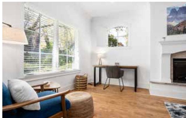
Sweet Office Nook