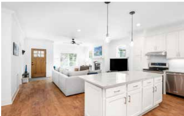
Easy One Level Living