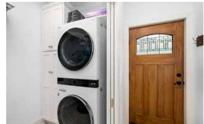
All Appliances to Convey