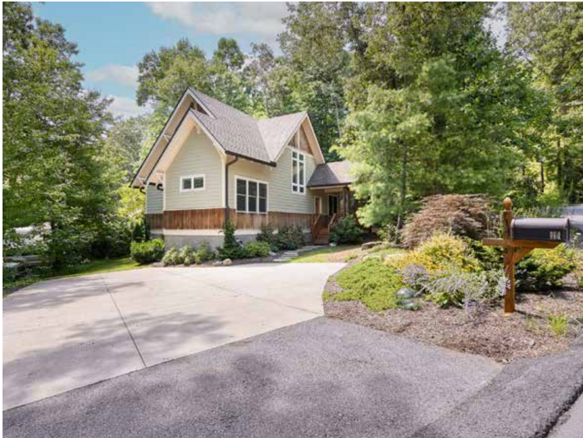
Plenty of Off-Street Parking and a Maturely Landscaped Lot

There's just something about a JAG-built house — once you know, you know! This 2016 GreenBuilt, Energy Star, Arts and Crafts-inspired charmer is ideally located about four miles from downtown Asheville, minutes away from both the entertainment and cuisine of the city center, and the convenient amenities of day-to-day living around the Tunnel Road corridor. Step inside where you'll find a bright interior and thoughtful design elements, blending functional modern living with character details not often found in newer construction. Popular open layout connects the living, dining, and kitchen, yet the offset arrangement maintains some interest and separation in the different spaces. The buzz words are there: stainless, granite, tile, natural light, hardwoods, primary-on-main, outdoor living ... but what's also there is heart and soul with special touches and finishes from a builder who goes above and beyond. Come live sustainably and efficiently in a private, forested setting in Haw Creek!