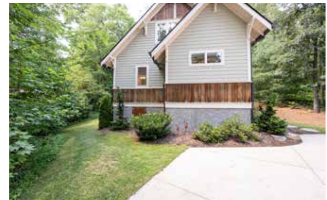
Encapsulated Crawlspace Entrance to the Left for Storage