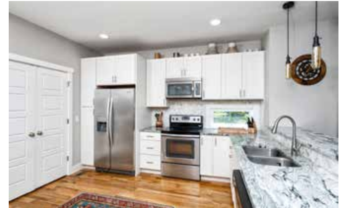
Granite Counters • Stainless Appliances