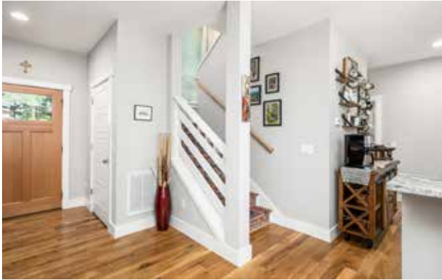
Interesting Architectural Details