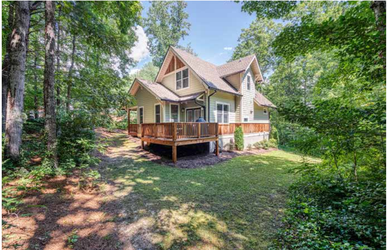
Private Side and Back Yards