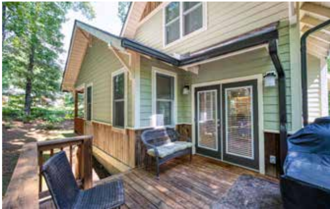
Private Side Grilling and Lounging Deck