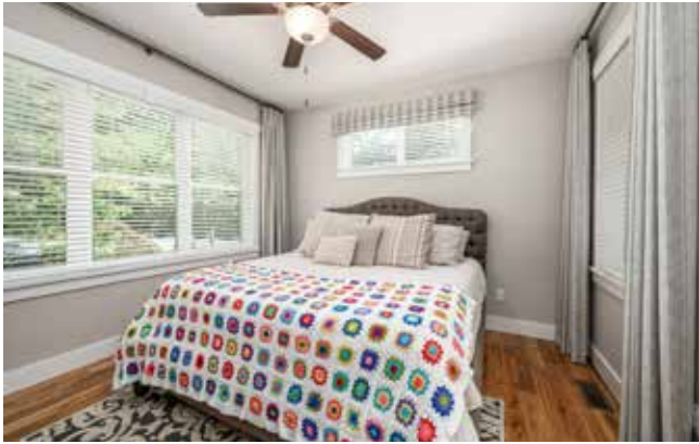
Primary Suite on Main Floor