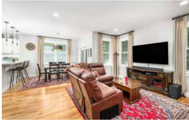
Awesome Floor Plan for Open and Connected Living