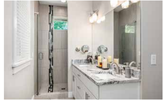
Primary Suite Bathroom with Waterfall Tile Accent