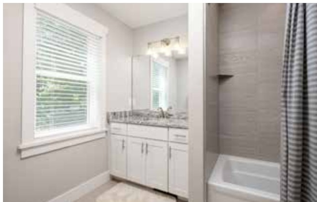
Upper Bathroom Tile Details

114 CISCO ROAD JAG Construction Arts and Crafts Home Asheville, NC 28805