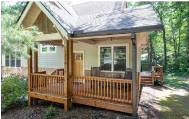
Multiple Outdoor Spaces to Enjoy