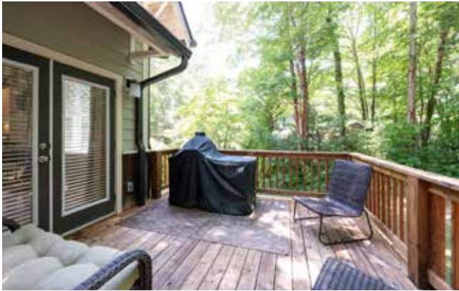
Perfect Spot to Fire Up a Grill!