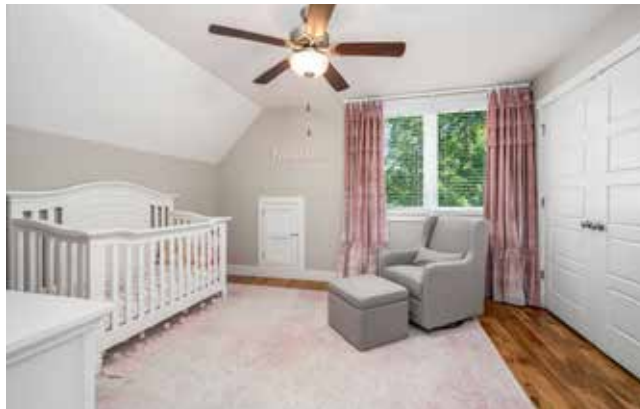
Cute Upper Bedroom with Soffit Storage and Large Closet