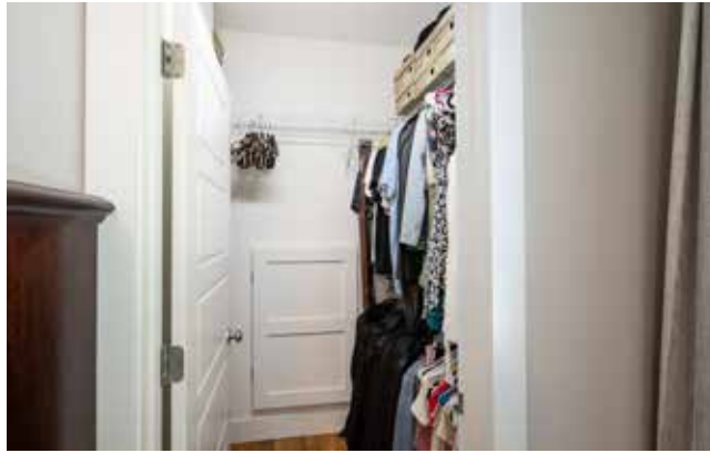
Large Primary Walk-in Closet