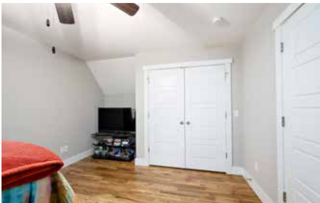
Guest Room Closet and Furniture Nook