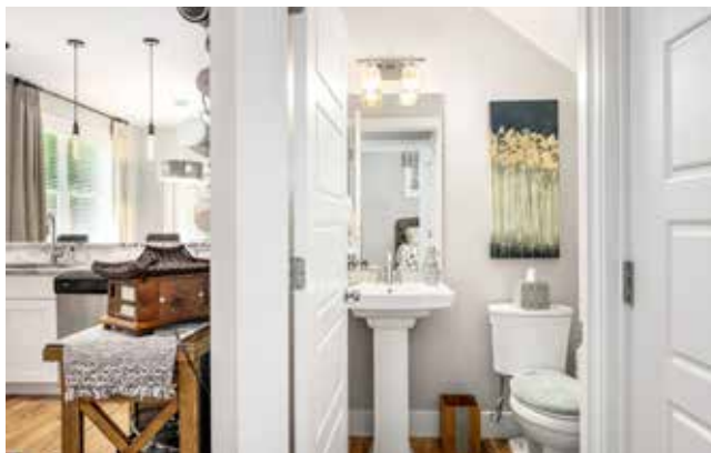
Main-Floor Half Bath, Laundry Closet to the Right

114 CISCO ROAD JAG Construction Arts and Crafts Home Asheville, NC 28805