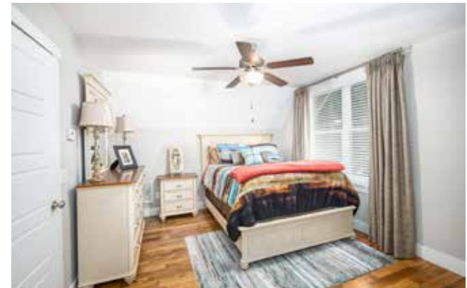
Spacious Upstairs Guest Room