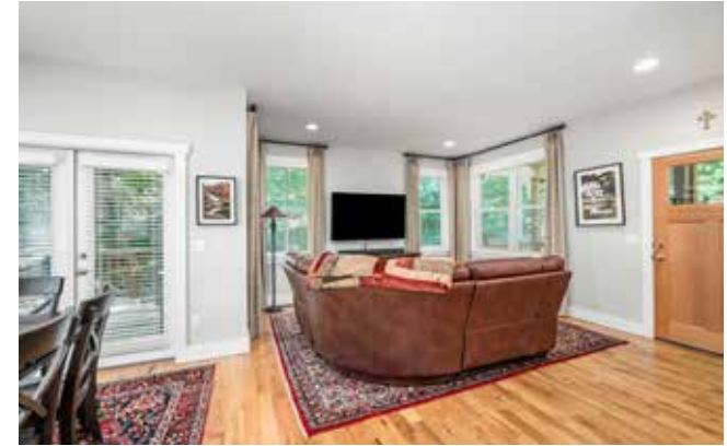
So Many Windows!