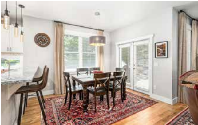
Bright Dining Area Connects the Kitchen and Deck