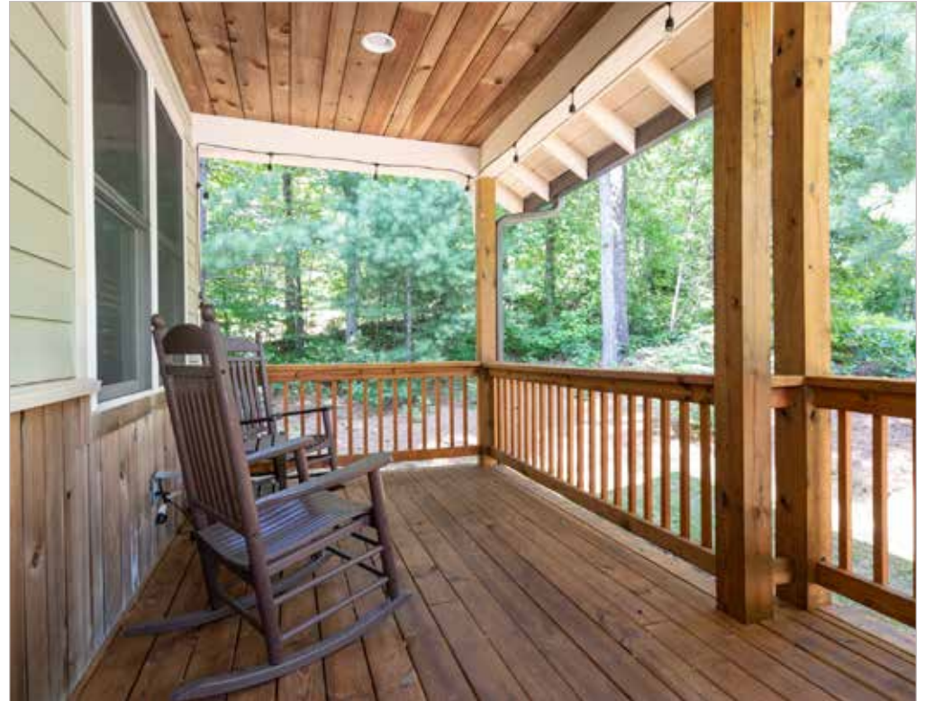
Proverbial (and in This Case, Literal) “Rocking Chair Front Porch”