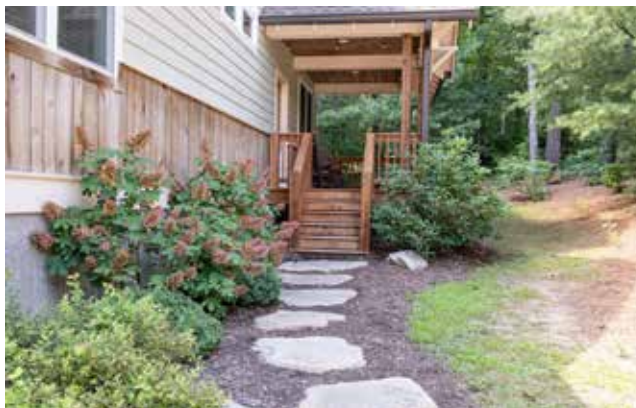
Stepping Stone Pathway to the Front Door