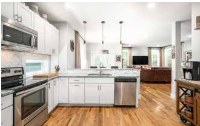
Backslash Window Lets in Even More Light