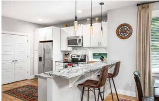
Pull Up a Seat and Chat with the Chef