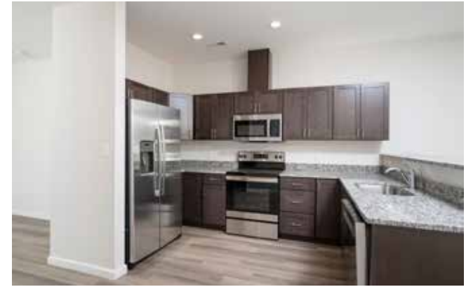
Kitchen Features Stainless Steel Appliances