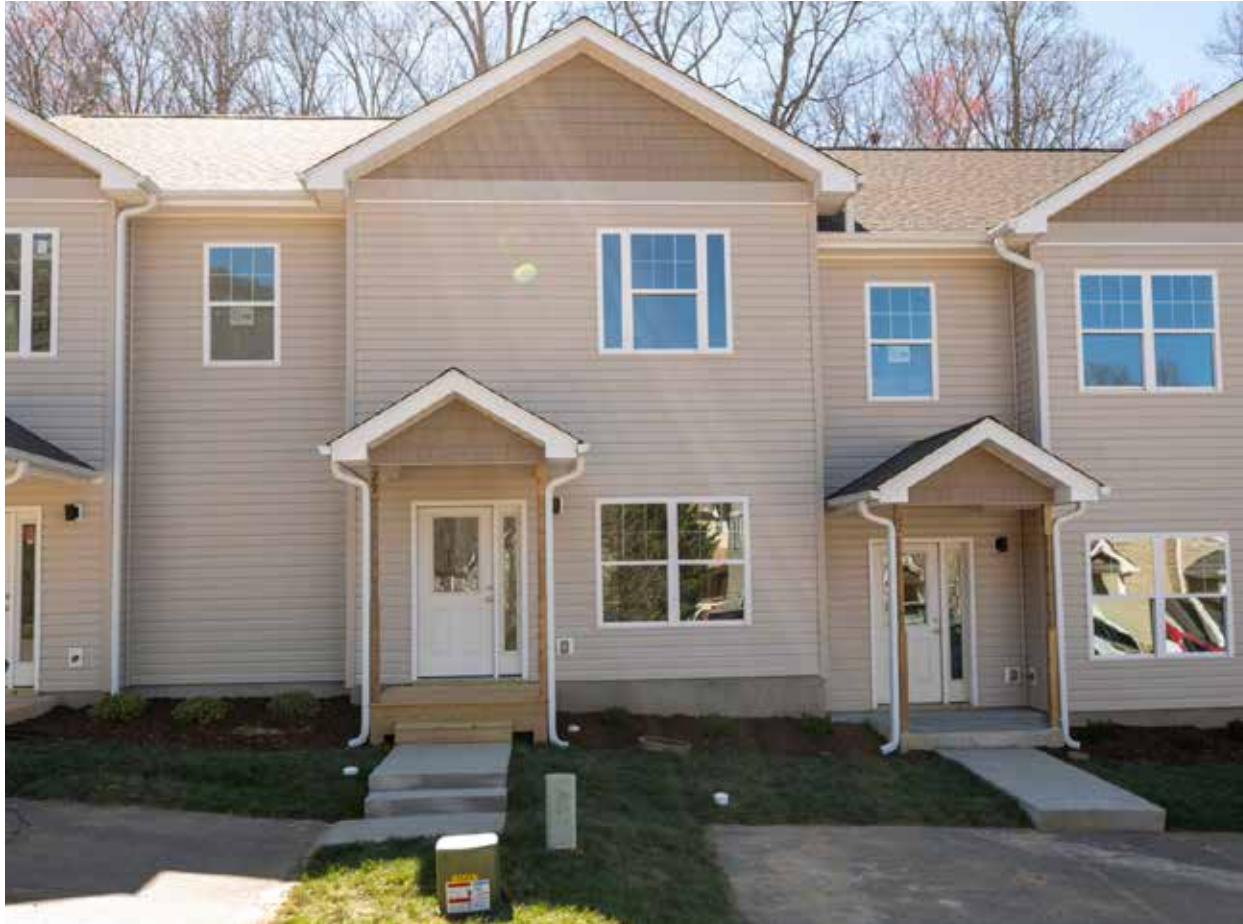
Well Laid-Out Internal Townhome Unit

Brand-new Energy Star-certified townhome conveniently located between Asheville and Black Mountain, close to shopping and restaurants, in a planned community with some mountain views. Easy interstate access — 15 minutes to downtown Asheville; 10 minutes to Black Mountain. Beautiful vinyl plank floors on the main level with new carpet throughout second level. Tons of closet and storage space. Large windows for great natural light. Sparkling kitchen with granite countertops and stainless appliances opens to the dining/living area. Powder room on main level; two bedrooms and two full bathrooms on the second level. Large patio sliding doors look out to a professionally landscaped yard.