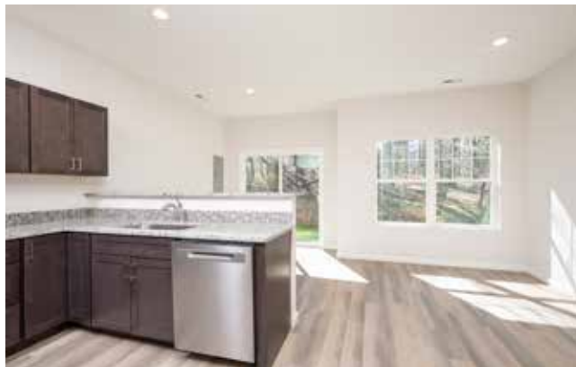
... with Ample Area for Entertaining