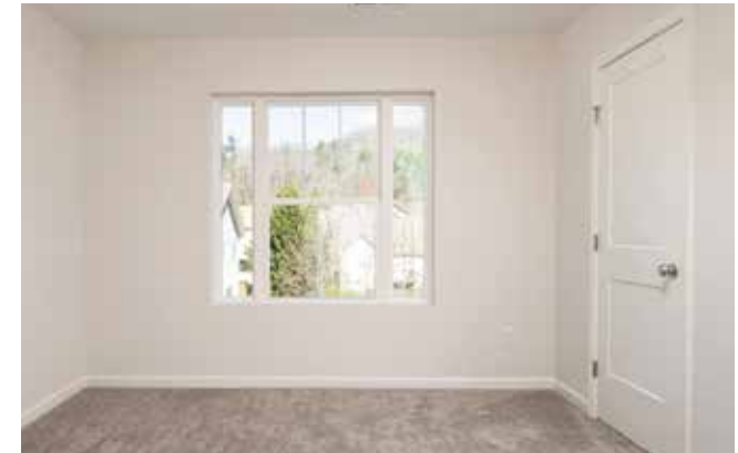
View from Primary Bedroom