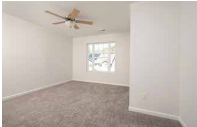
Primary Bedroom with New Carpet and Ceiling Fans