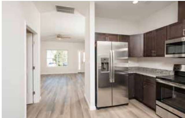
Plenty of Cabinets for Storage