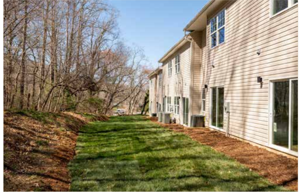
Lush Greenspace and Wooded Area for Privacy