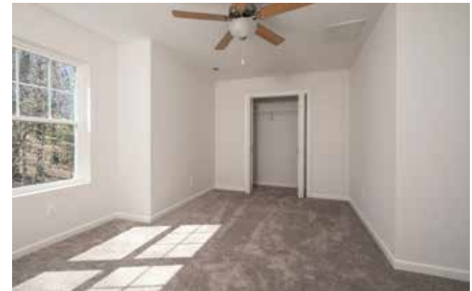
Bedroom #2 Closet