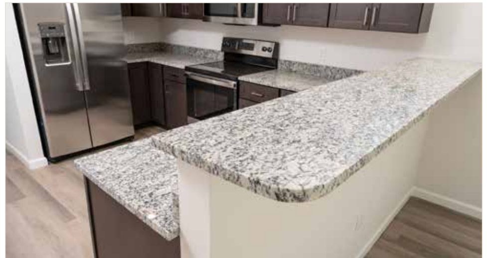
Convenient Granite Breakfast Bar