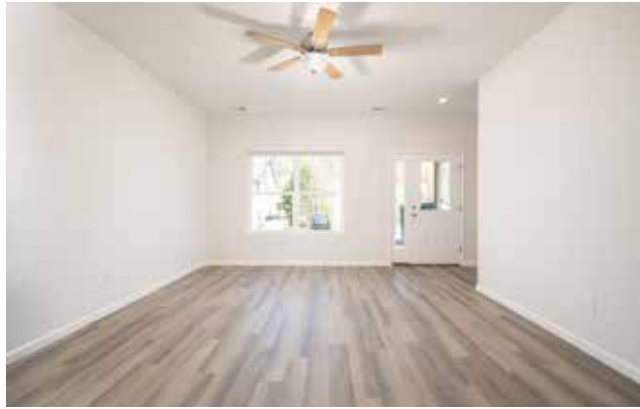
Spacious Living Room Area