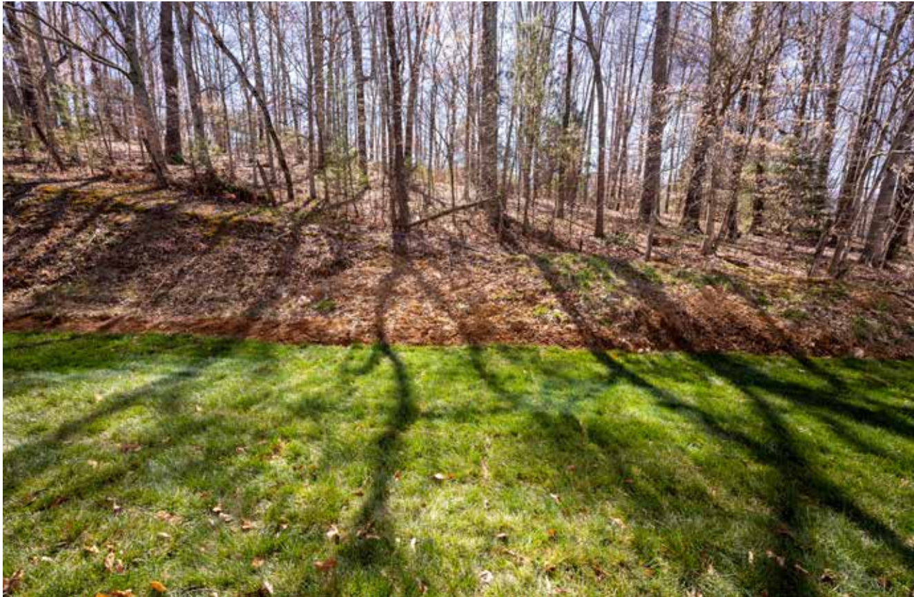
Lots of Backyard Greenspace