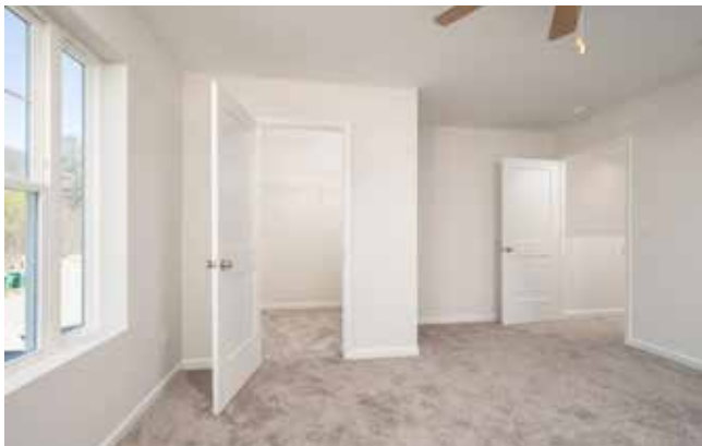
Large Walk-in Closet in Primary Bedroom