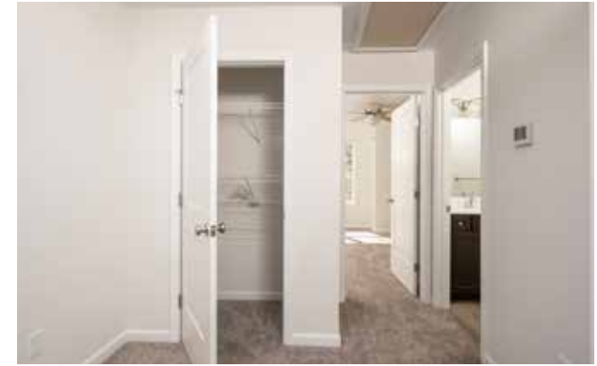
Linen Closet on Second Level