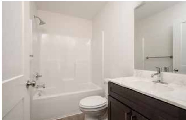
Full Ensuite Primary Bathroom