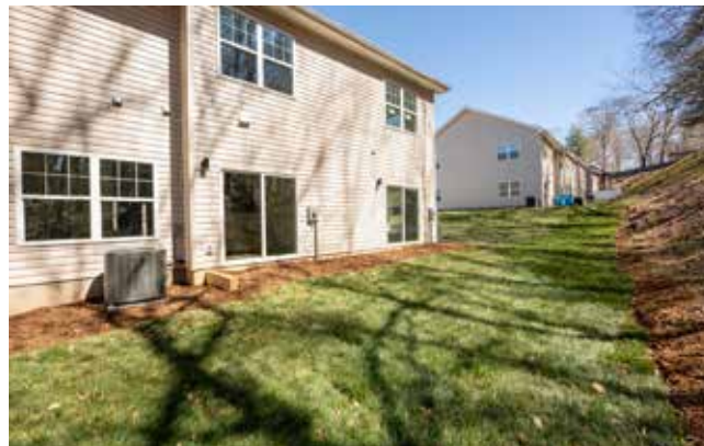
Well Landscaped Back Yard