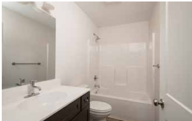
Second-Level Hallway Full Bathroom