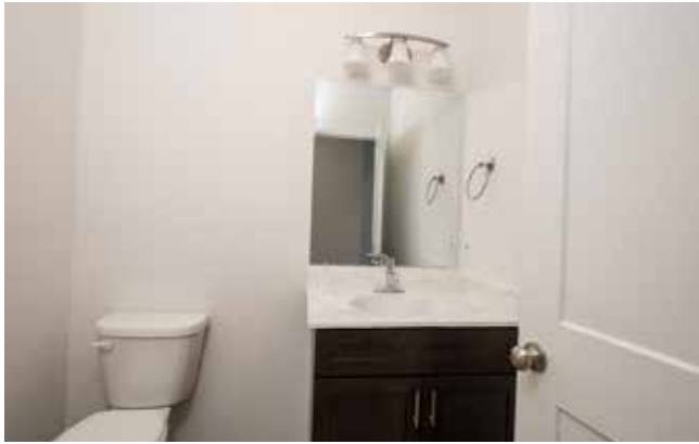
Half Bathroom on Main Level