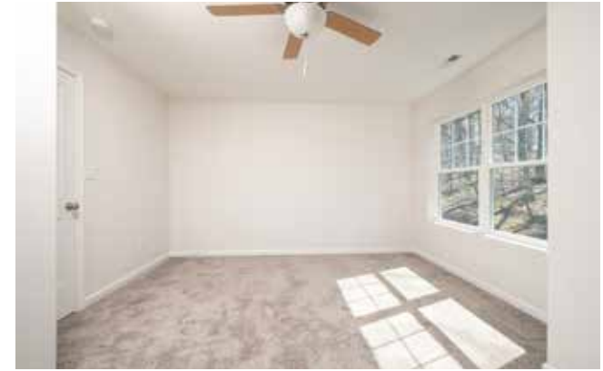
Bedroom #2 on Second Level