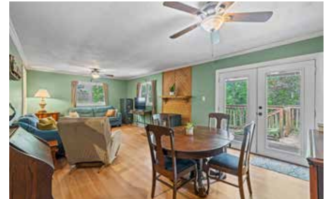
Dining Room Offers Easy Access to Back Porch