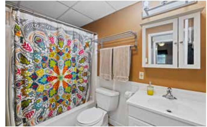
Main-Level Bathroom with Updated Vanity and Fixtures