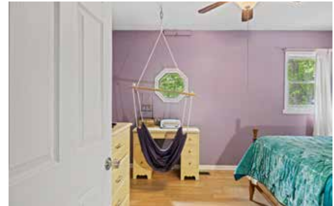
Second Bedroom Upstairs