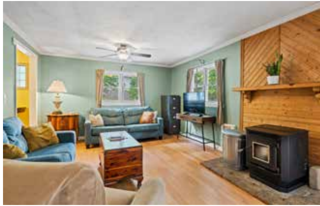
Living Room with Pellet Stove