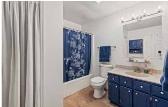
Upstairs Bathroom with Linen Closet

3 BROADVIEW DRIVE Custom Home on a Private Lot in Oakley Asheville, NC 28803