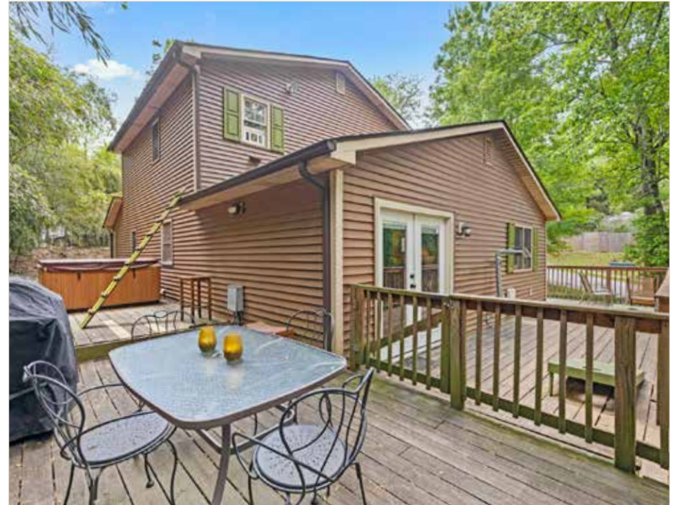
Rear View of Home from Back Deck