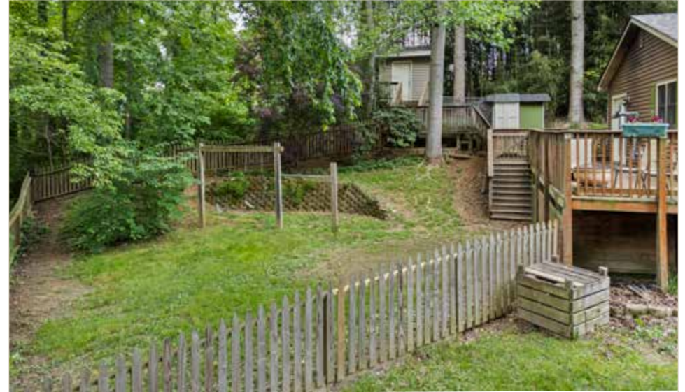
Fenced-in Yard Is Perfect for Playing