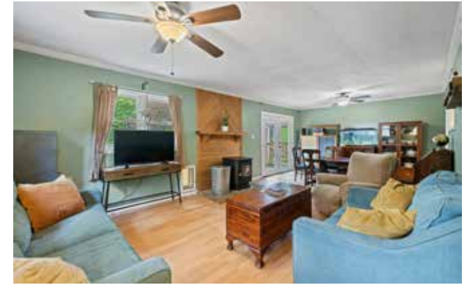
Comfortable Family Room with Large Windows