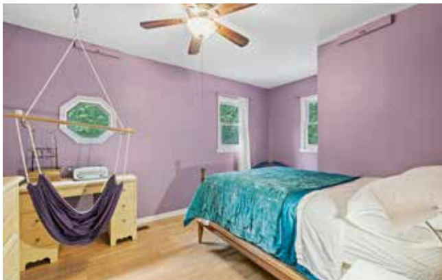
Light-Filled Bedroom Overlooks Front Yard