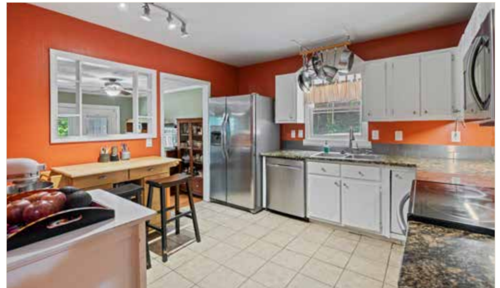
Large Kitchen with Passthrough Window to Dining Area