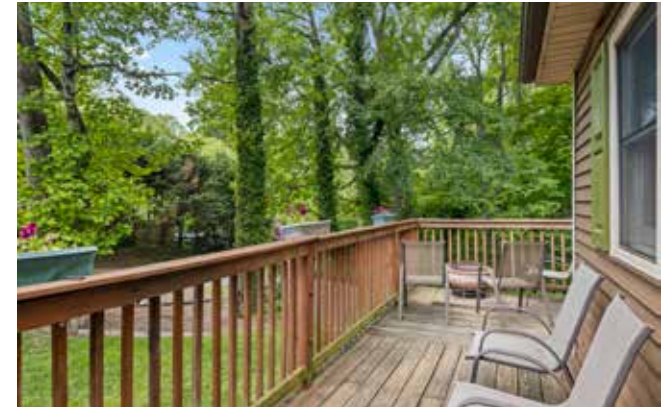
Peaceful Front Porch