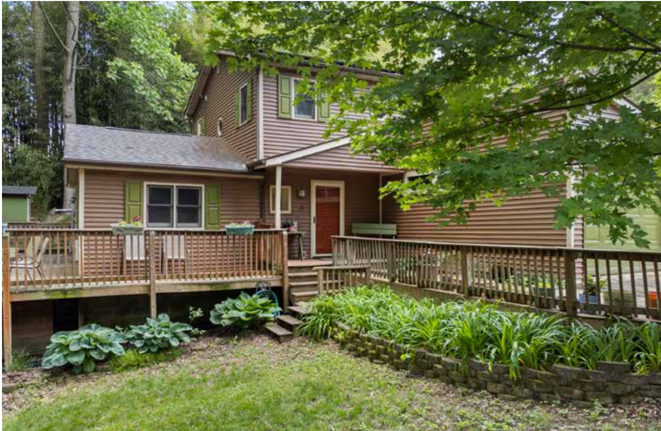
Fenced-in Yard with Mature Landscaping