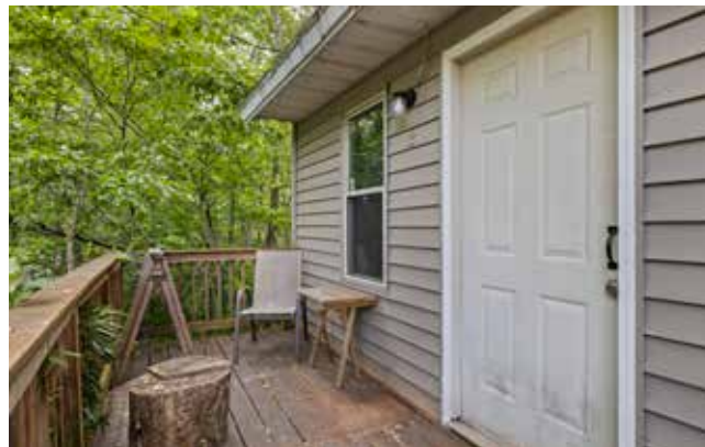
Workshop with Electricity