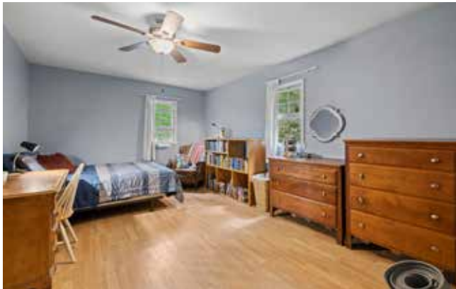
Upstairs, You'll Find the Primary Bedroom