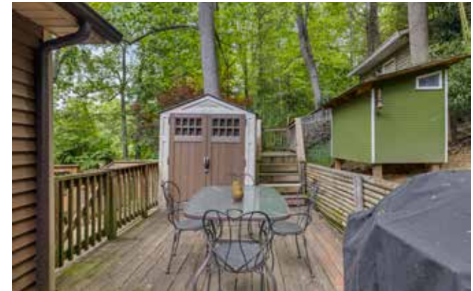
Back Porch, Chicken Coop, and Outdoor Shed