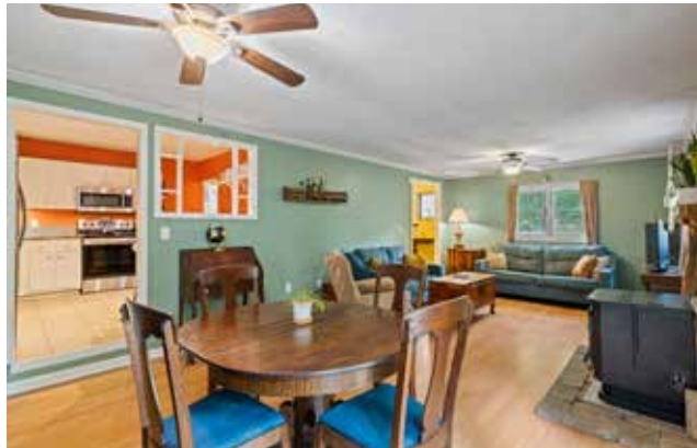
Open-Plan Dining and Living Room with Ceiling Fans