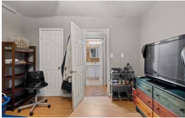
Main-Floor Bedroom Is Directly Opposite Bathroom