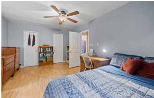
Primary Bedroom Boasts Two Large Walk-in Closets