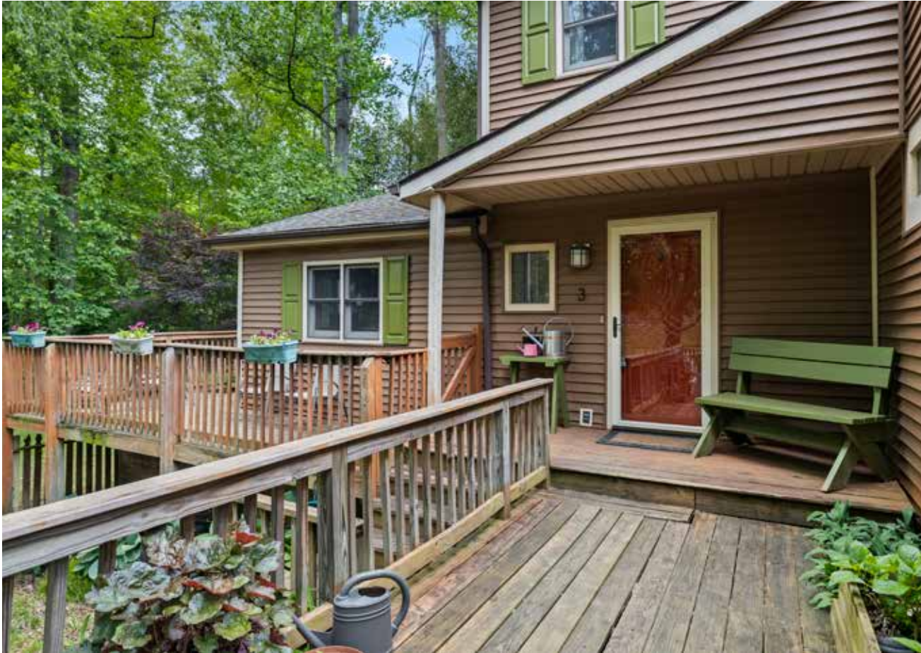
Welcome to Your New East Asheville Home!

This charming home is located in beautiful East Asheville, only a 10-minute drive to downtown. It provides a peaceful setting close to amenities and activities. Recent updates include solar panels, roof, and HVAC system. You will love entertaining and relaxing on the wraparound porch and playing in the fenced-in yard. The interior is warm and welcoming with a newly-installed pellet stove, which will easily heat the entire lower level. The house has ample storage, including two outdoor sheds, large closets throughout, and walk-in closets in the upstairs bedrooms. The workshop in the backyard is an ideal creative space, just steps away from the back deck. The garage is perfect for one car or for additional storage space. Situated on 0.3 acre, you are sure to spend lots of time on the deck enjoying the outdoors. Don't miss seeing this lovely home!