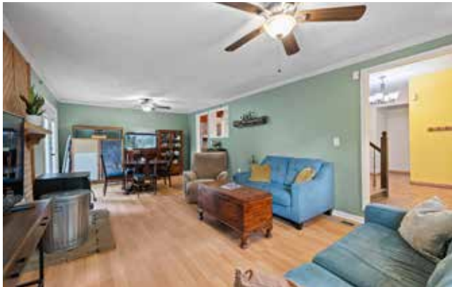
Nice Flow between Living and Dining Areas