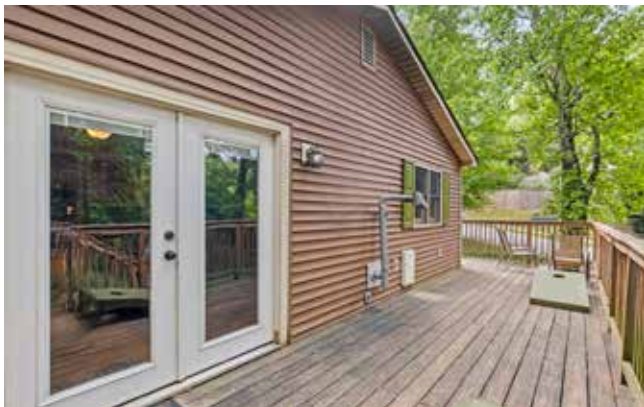
Plenty of Room for Outdoor Fun