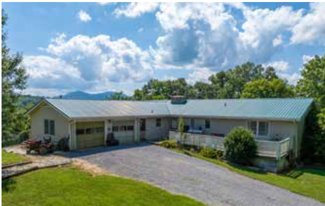
Great Well Water