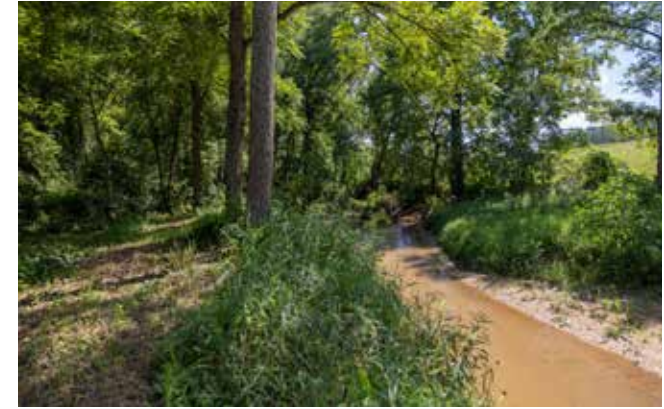
Mostly Farms Upstream