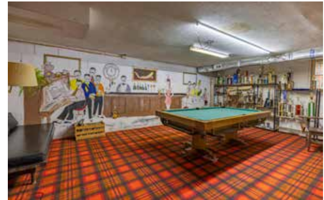
Billiard and Trophy Room Contains ...