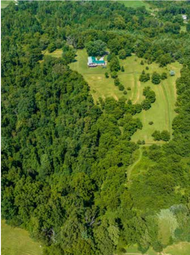
40+ Acres of Mature, Thriving Forest