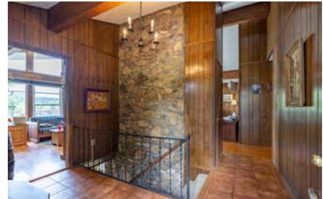
Rock Wall Staircase