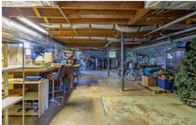
1000+ SF in the Unfinished Portion of Basement