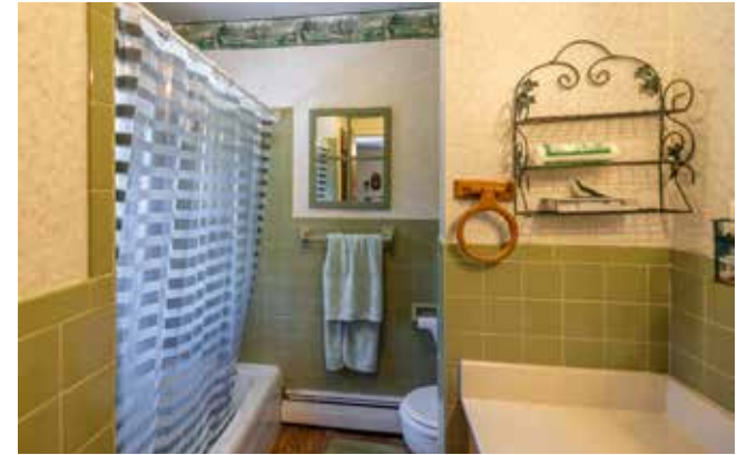
Original 1971 Avocado Tile