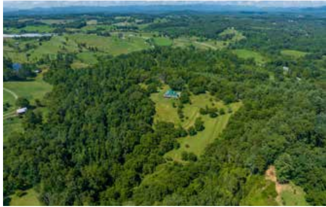
Cleared Trails and Logging Roads