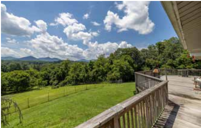
Great Solar and Gardening Potential