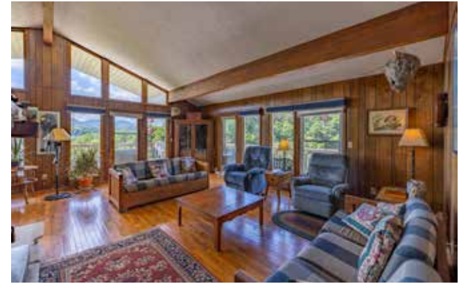
... and Vaulted Ceiling ...