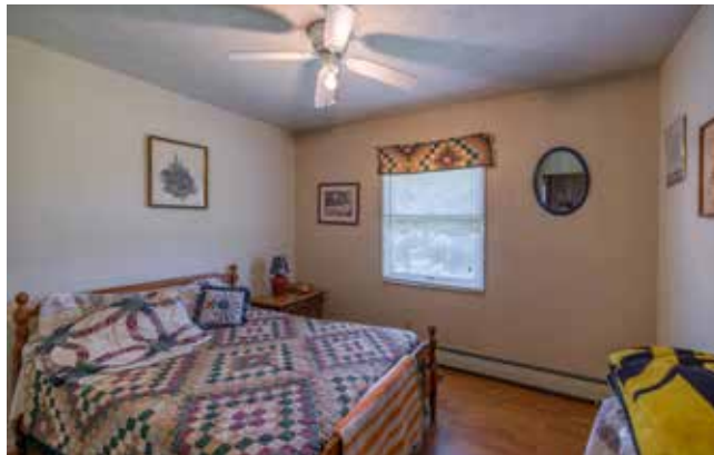
First/Front Guest Room