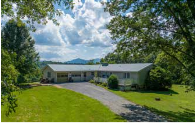
Flat Driveway and Mountain Views