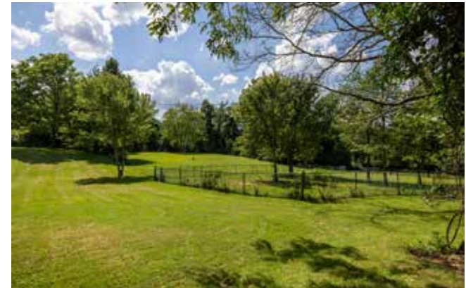
Enclosed Dog Run