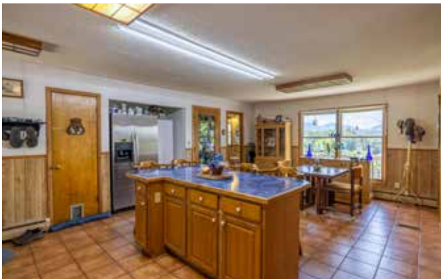
Open Kitchen/Dining Combo