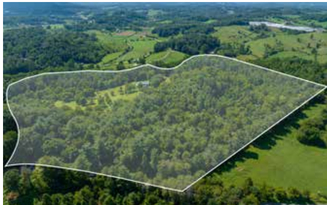
Gently Rolling Property