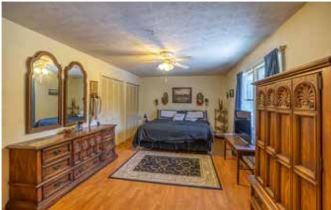
Double Closets in Primary Bedroom