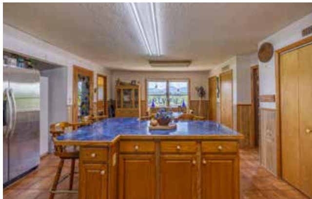
Large Kitchen Island