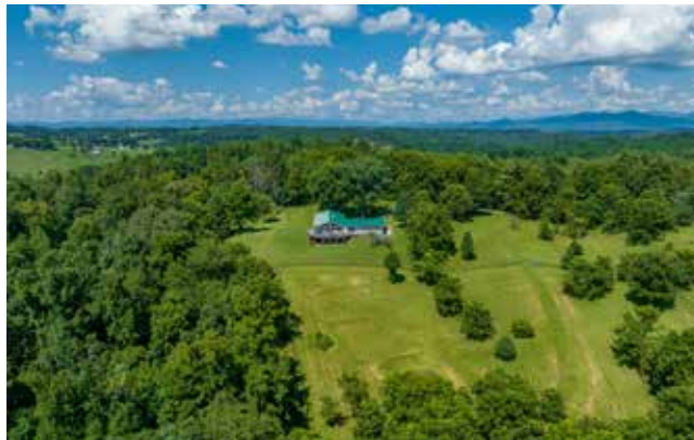
Acres Cleared around Main Compound