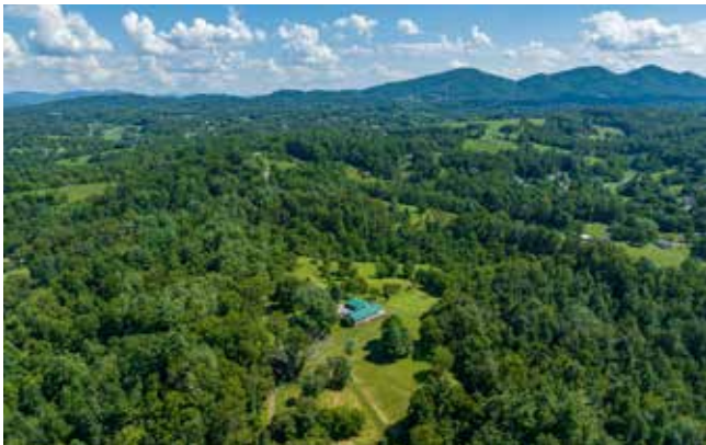
Forest Buffer Surrounds Main Compound