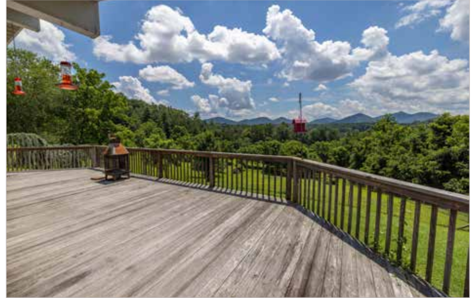
South-Facing Deck Views