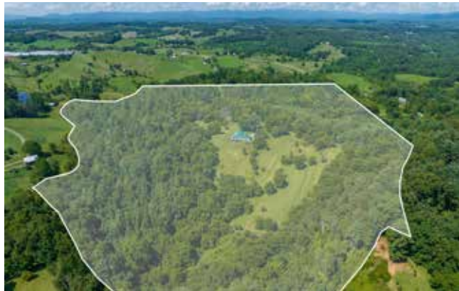
Nearly 2,000 Feet Along Newfound Creek