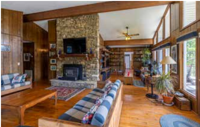
... Enhance the Versatile, Open Living Space