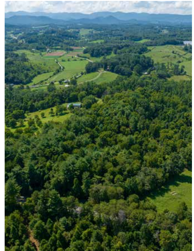
Long Range Views without Climbing a Mountain!