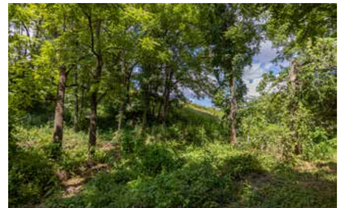
Logging Roads and Trails