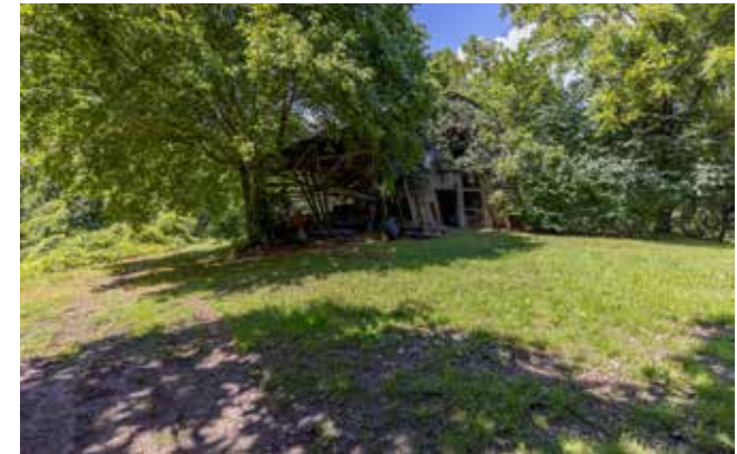
Dilapidated Tobacco Barn, Full of Aged Lumber