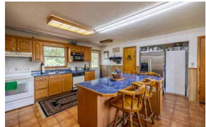
Tons of Cabinet and Pantry Space