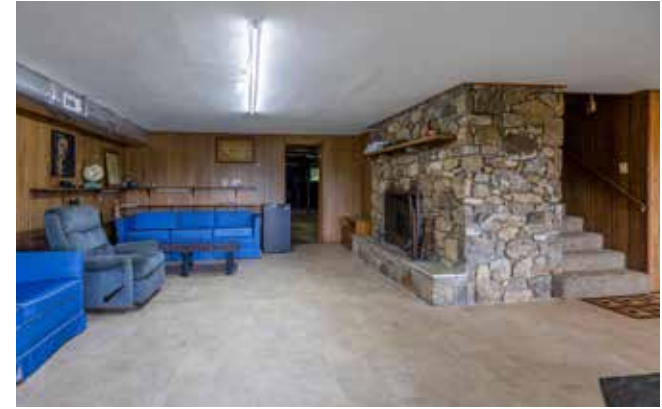
Basement Bonus Room Gets Plenty of Light