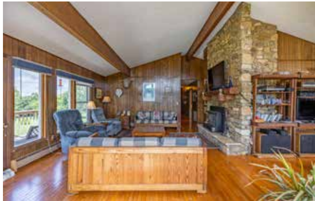
Cozy, Wood-Burning Stove/Fireplace