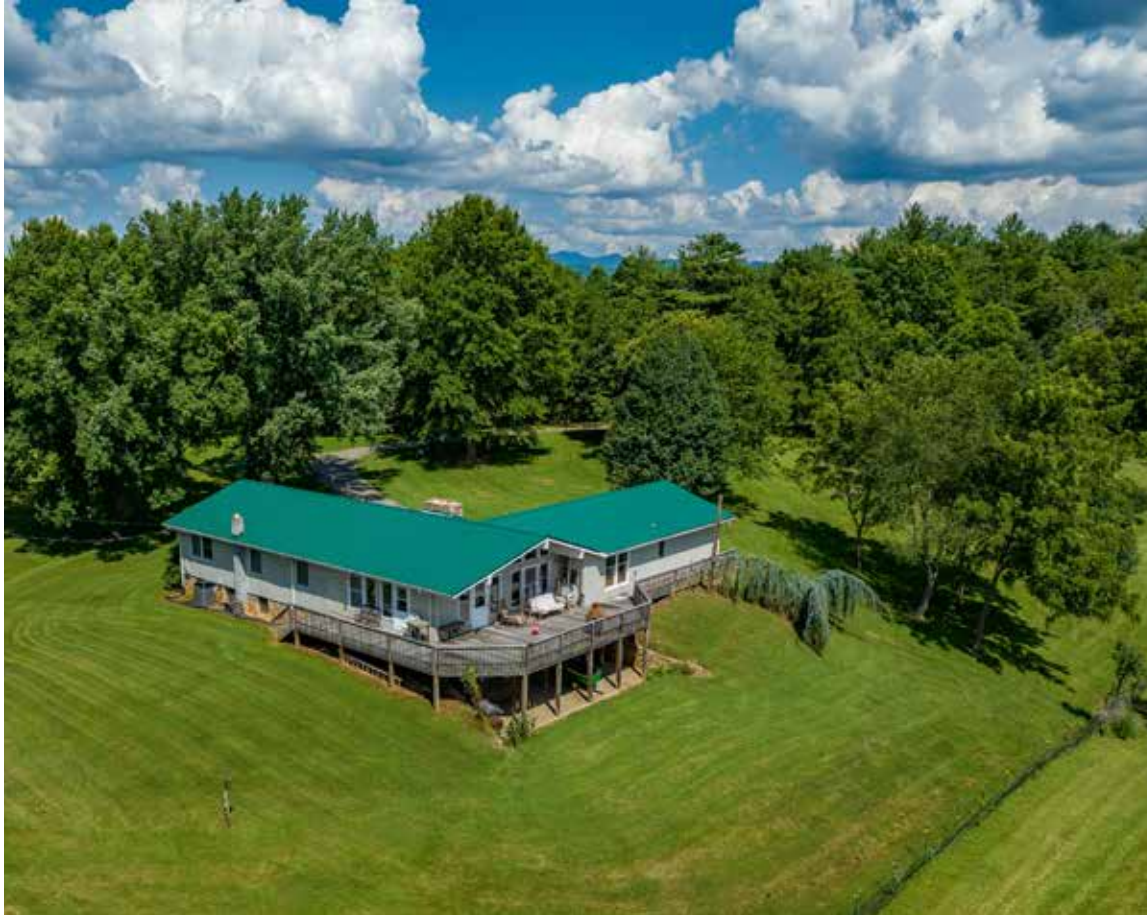
Large House on 52 Acres

52 acres of prime Alexander real estate. Open Use zoning. No deed restrictions. Retreat center? Vineyard? Sportsman’s paradise? Self-sufficient family compound? 40+ acres of mature, thriving forest surround the main compound with roughly eight acres cleared. There is wonderful well water, plus spring-fed and rain-driven creek beds, as well as nearly 2,000 feet along Newfound Creek. Cleared trails and old logging roads allow access to almost the entire gently sloping parcel. At the heart of the former home of Doc Humphrey’s Blue Ridge Beagles sits a well-loved, sprawling light- and view-filled ‘70s rancher that offers 4 BRs (incl. primary suite on main), 2.5 baths, open living spaces, enormous deck, attached garage, tons of basement space, and a wood-burning fireplace on each level. Great southern exposure around the house for solar and gardening, and biodiversity abounds with herons, hawks, and deer passing through. Private country estate only 10 minutes to grocery and 20 to downtown.