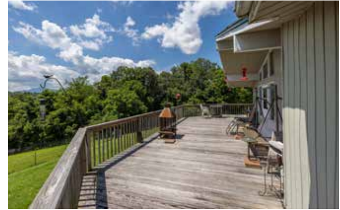
Southwest Deck View