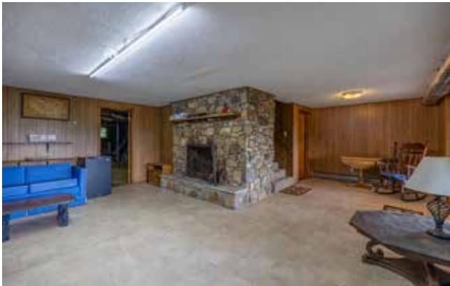
Second Cozy, Wood-Burning Fireplace