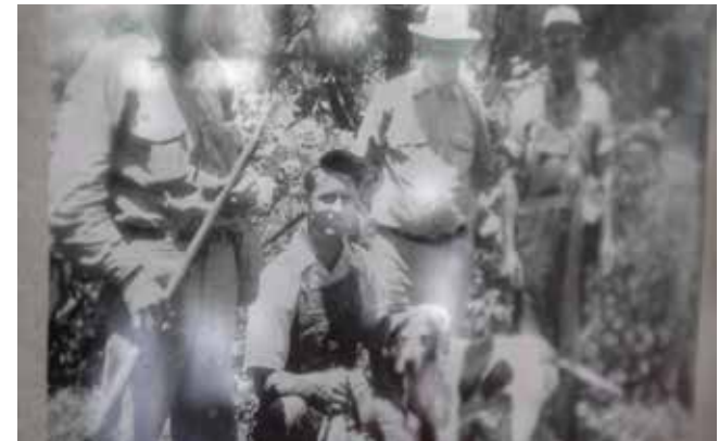
He Chose 1194 Bear Creek for the Privacy