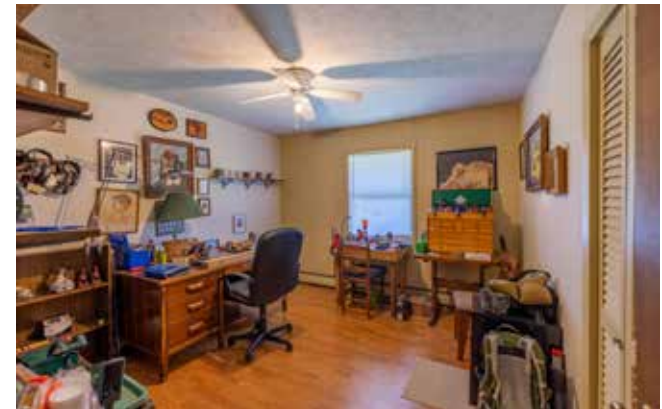
Second/Middle Guest Room