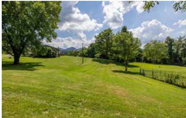
West Side Yard