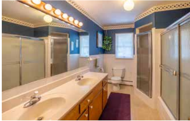
Hall Guest Bathroom