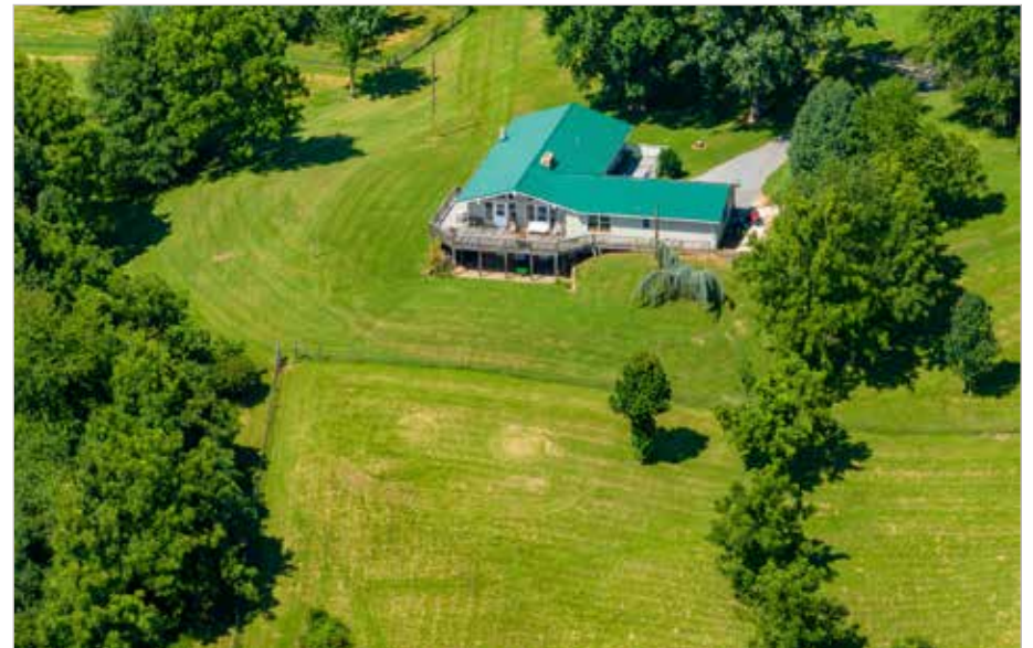
Private Estate with Acres of Southern Exposure