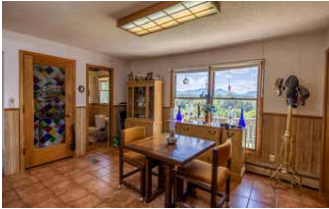
Spacious Dining Area with Views