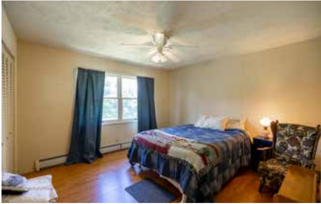
Third/Back Guest Room