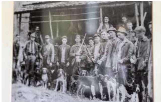
Doc Raised Generations of Beagles