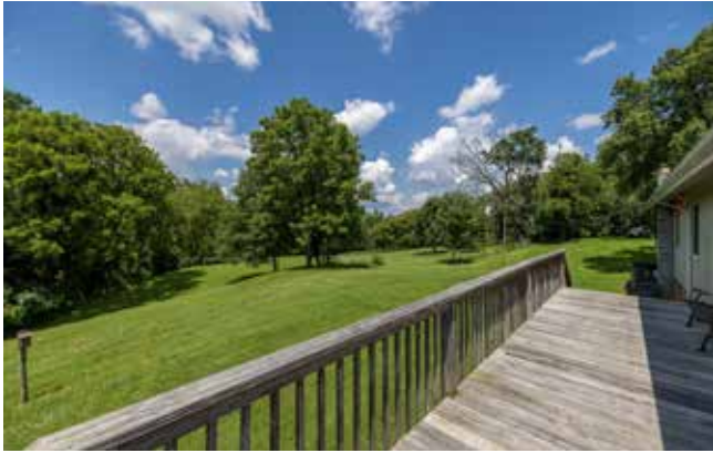
West Side Deck