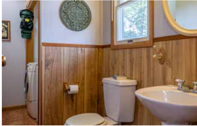
Half Bath and Laundry off Kitchen