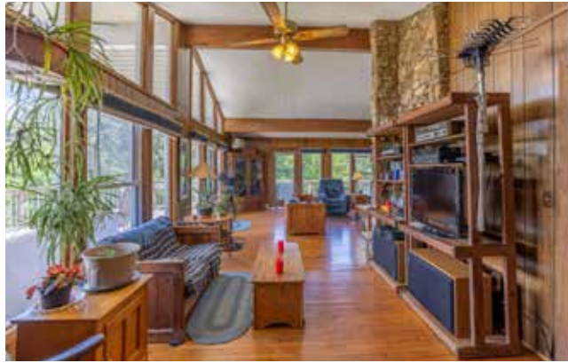
Stunning, Floor-to-Ceiling Windows ...