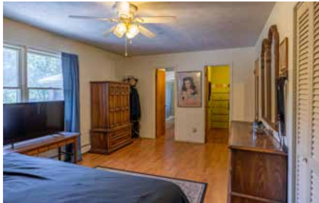
Walk-in Closet and Ensuite Bathroom