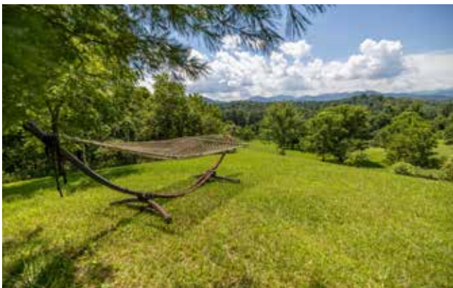
Eastern Edge, Looking Southwest into Property