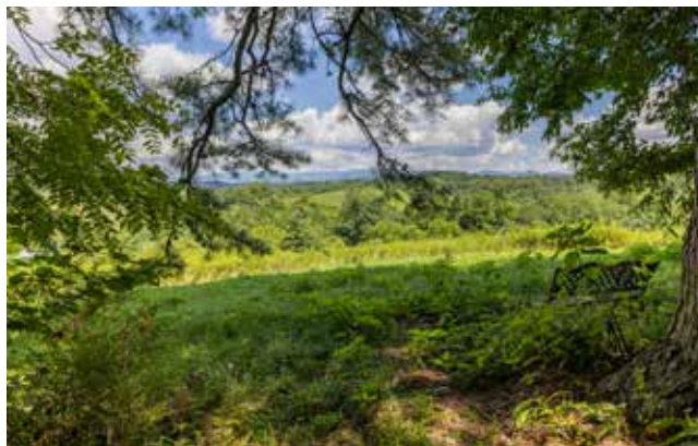
Northern Edge, Looking out of Property