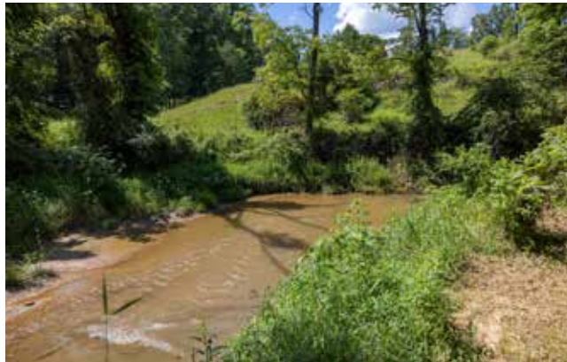
Heron Have Been Seen Visiting This Site