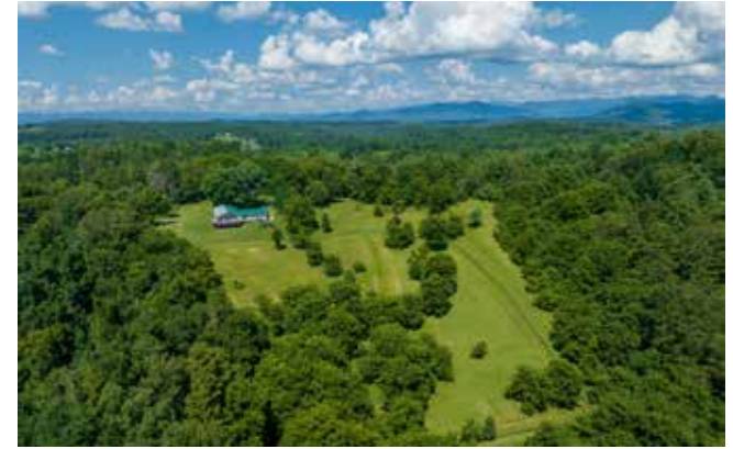
Open Use Zoning