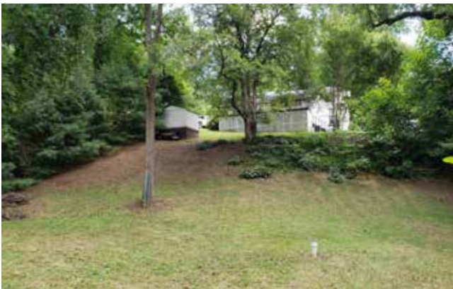
It's 0.55 Acres, but Feels Like So Much More