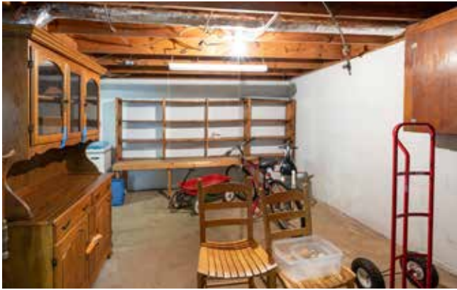
Tons of Extra Storage in the Basement