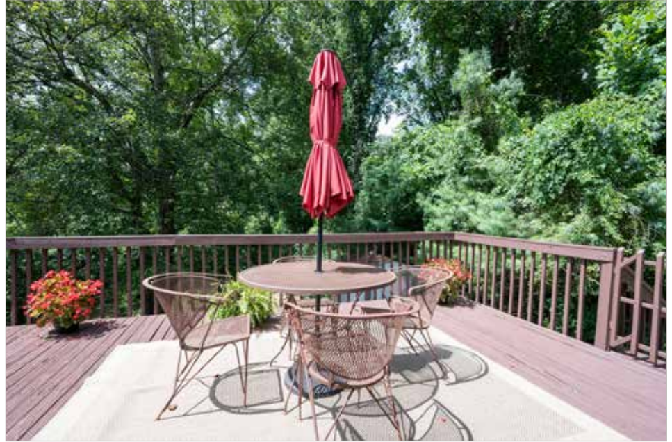
Dining al Fresco, Anyone?