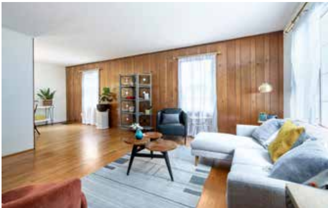
Shiny Hardwood Floors throughout Main Living Area