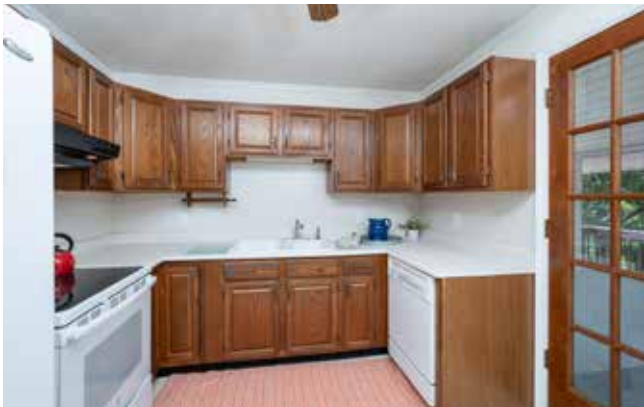
Tons of Oak Cabinets in This Spacious Kitchen