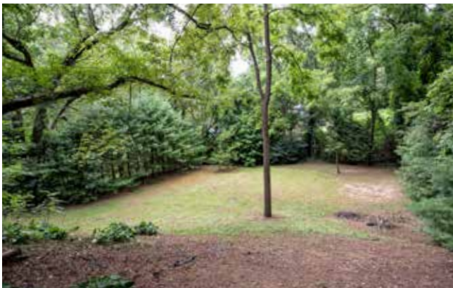
Perfect for Play, Relaxing, or Gardening