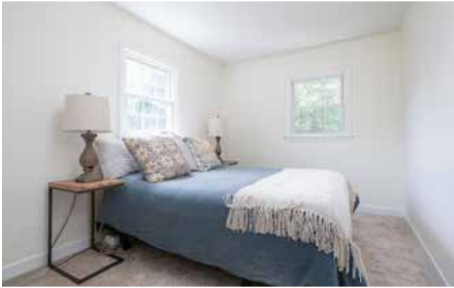
One of Three Sizeable Bedrooms