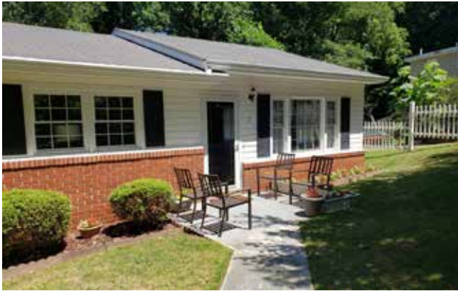
Inviting Front Patio in This One-Owner Home