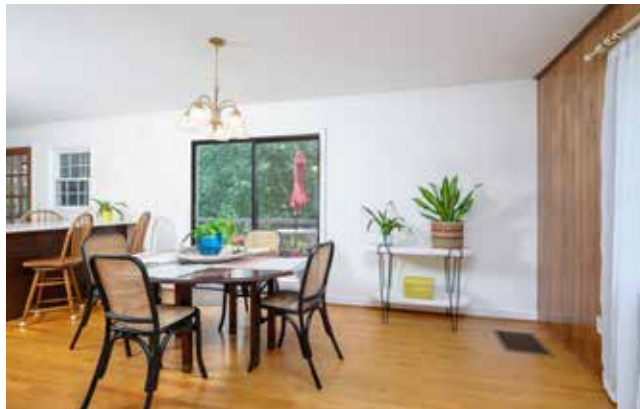
Dining Area Has Sliders to Rear Deck