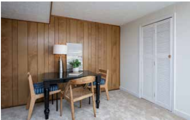
400 SF Den for Multiple Uses has a Cedar Closet