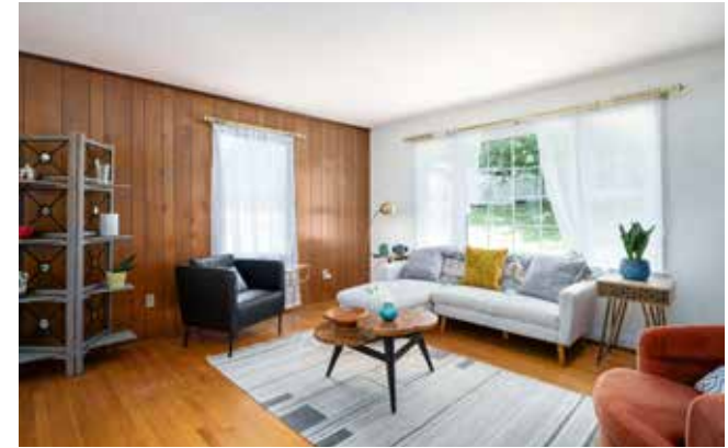
Large Windows Make for a Bright and Inviting Space