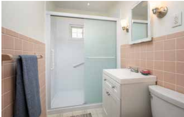
Full Bathroom Has Walk-in Shower and New Vanity