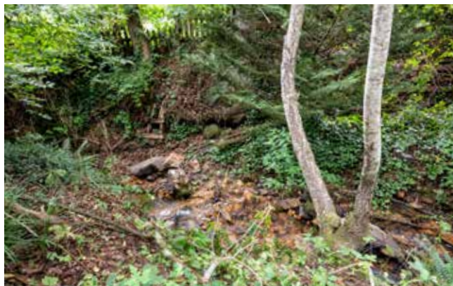
Relax Near the Creek at the Back Property Line