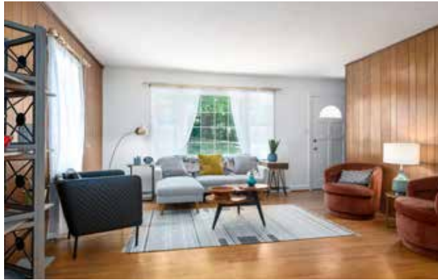
Spacious Main Living Area is Ready to Enjoy