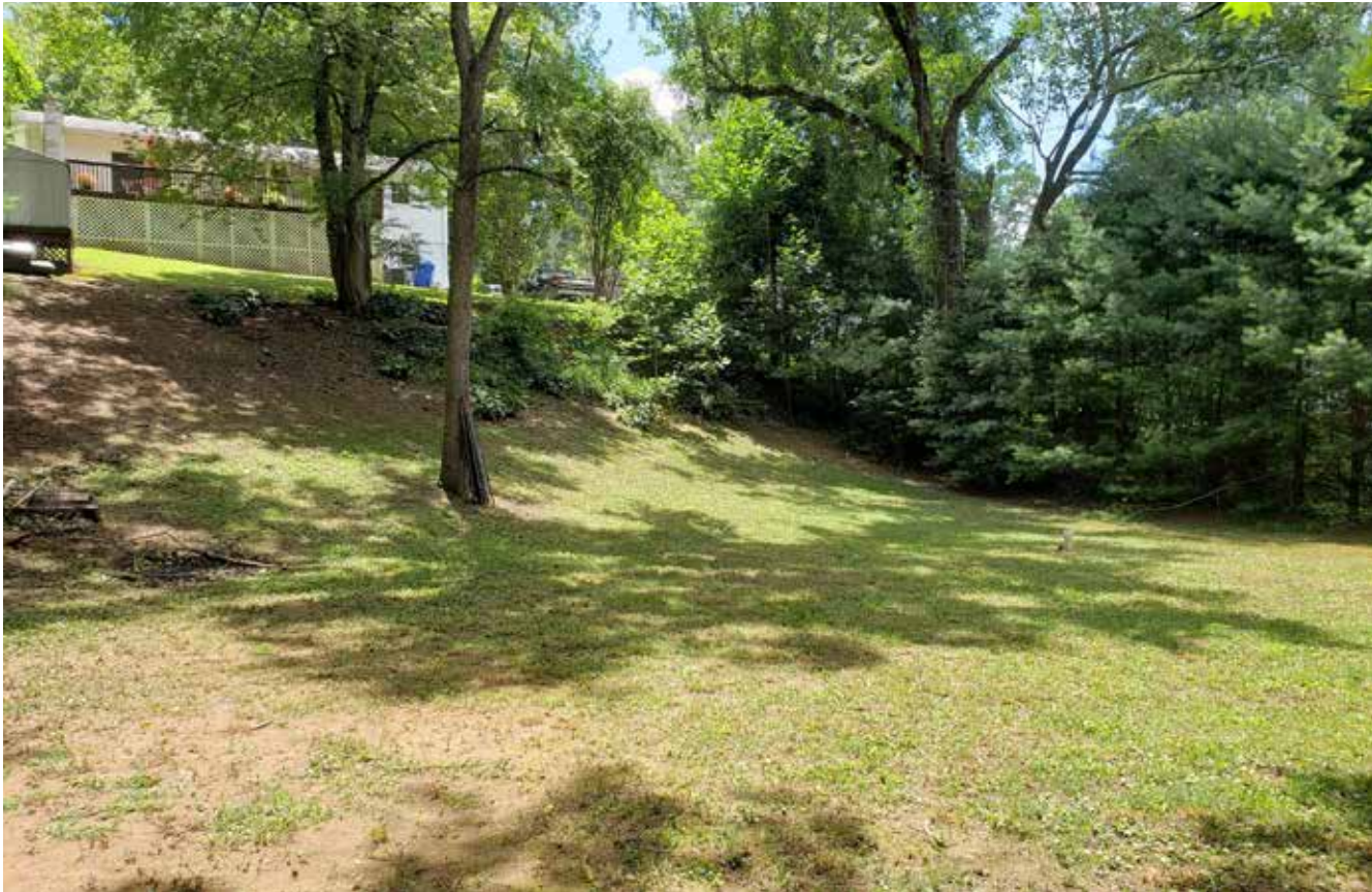
Lots of Mature Trees Provide Privacy and Shade