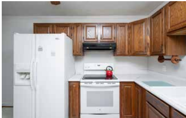
Clean and Tidy and All Appliances Convey