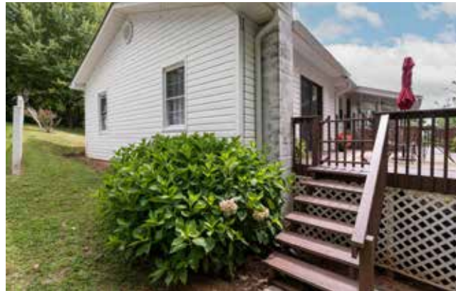
Stairs off Deck Lead to Back Yard