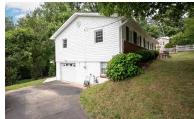
Large Driveway, One-Car Garage Offer Plenty of Parking