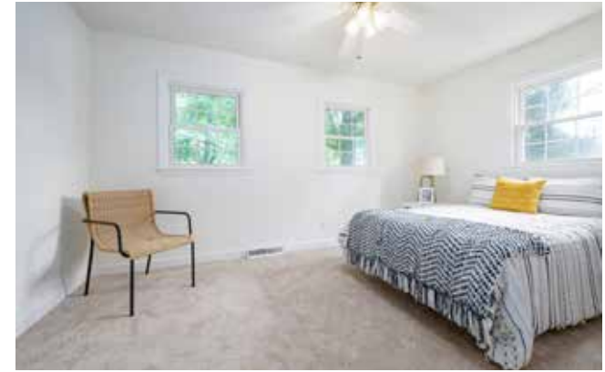
Brand New Carpet in All the Bedrooms