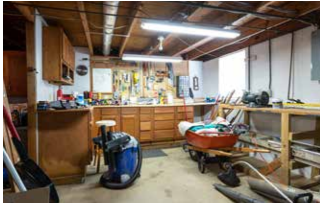
Wonderful Basement Workshop