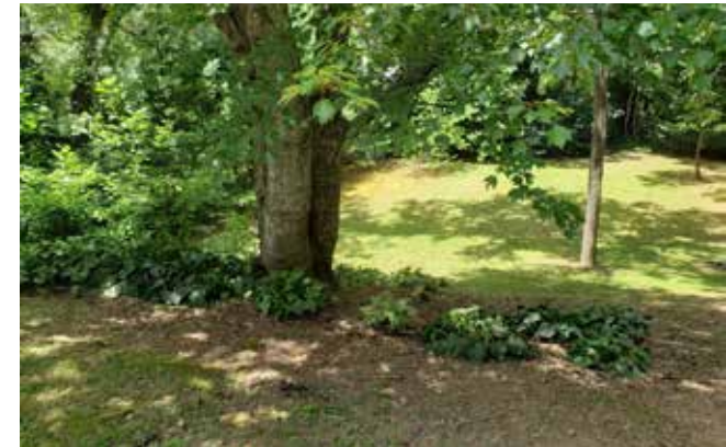
An Outdoor Paradise