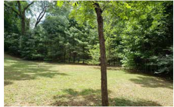
This Yard Is Perfect for Relaxing and Having Fun