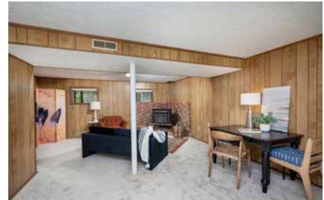
Huge Lower-Level Den Provides Bonus Space