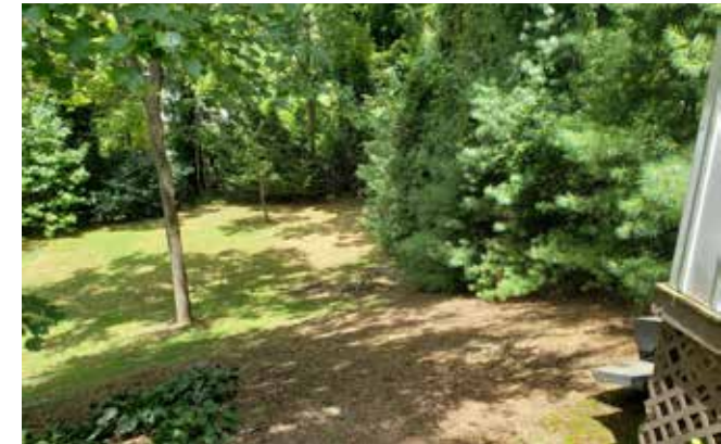
Back Yard is Huge and Level