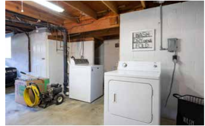
Laundry in Garage Basement • Washer and Dryer Convey