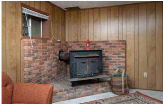
Woodstove in Den Keeps You Cozy and Warm