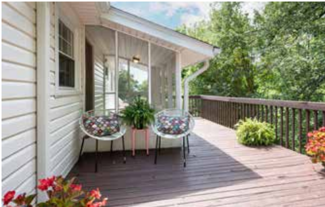
Large Deck Has Sweet Screened-in Area