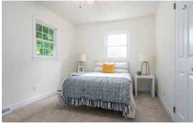
Windows Are All Insulated Double Hungs