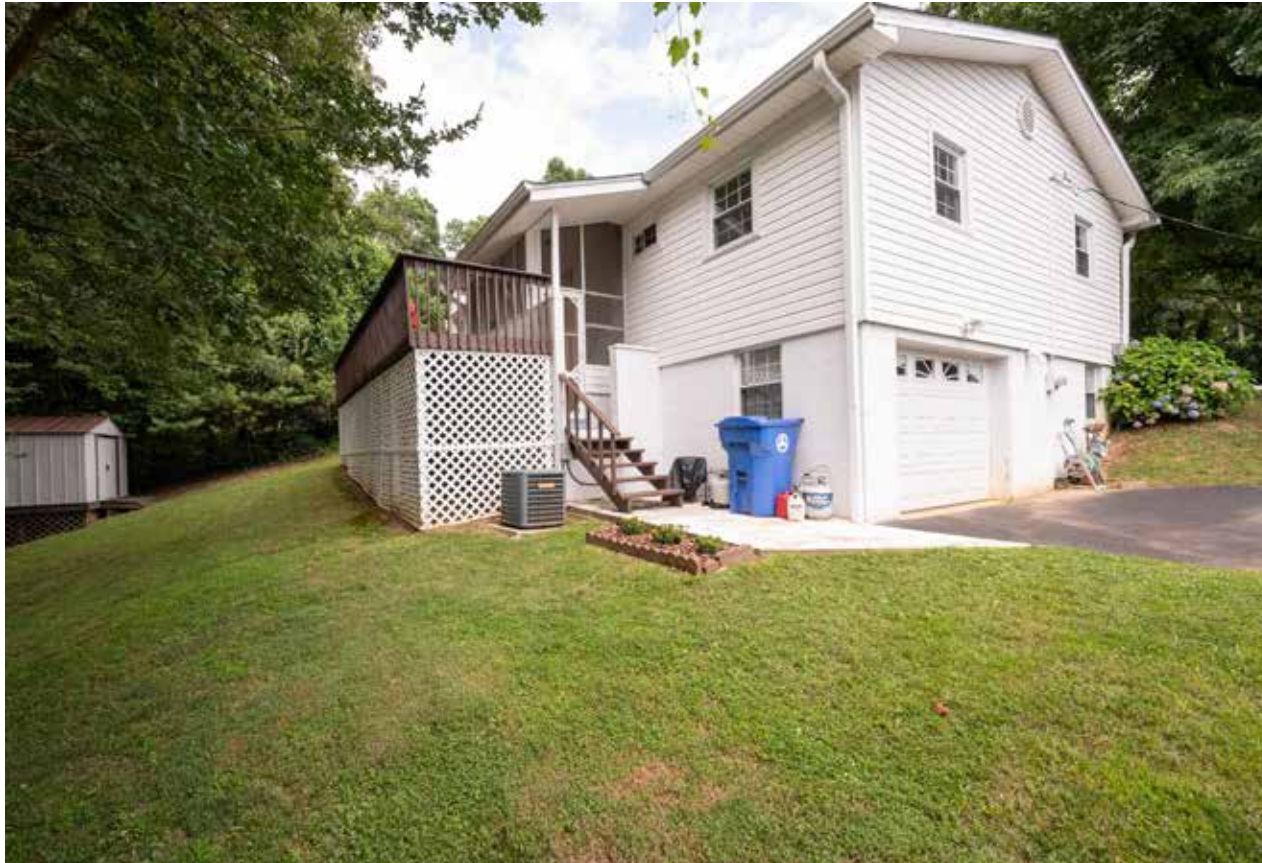
This Sweet Home is Neat as a Pin

This is the home you've been looking for! Come see this lovingly maintained, one-owner home in the classic Rosscraggen subdivision off Sweeten Creek Road. This spacious ranch is move-in ready and waiting for you to make it your own. Inside offers an eat-in kitchen with breakfast bar, oak cabinets, and separate dining area, a sunny and bright living room with hardwood floors, three generously sized bedrooms, and a bathroom with walk-in shower and new vanity. In the walk-out lower level, you'll find a cozy den with a wood-burning stove, and a large basement/garage with a workshop and lots of storage. The interior has been freshly painted and new carpets were just installed. But OUTSIDE is where this home really shines! There's a large, newly stained deck overlooking a huge, level lot that borders a small creek. It has lots of trees for privacy, but even more open space for playing, relaxing, and/or gardening! Convenient to everything South Asheville. Don't miss seeing this sweet home!