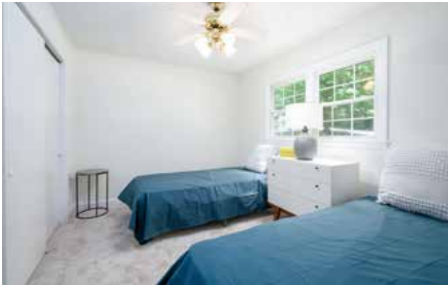
All Bedrooms Have Large Closets