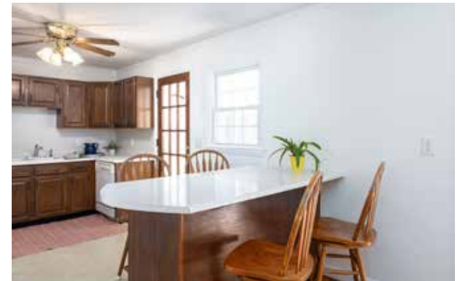
Breakfast Bar Provides Extra Seating and Counter Space