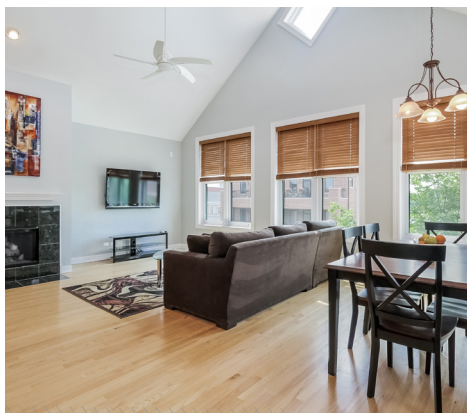
1350 W. BELMONT ST. | #E $539,000