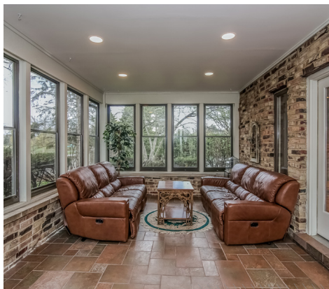
117 LIVERLY CIR. $808,000