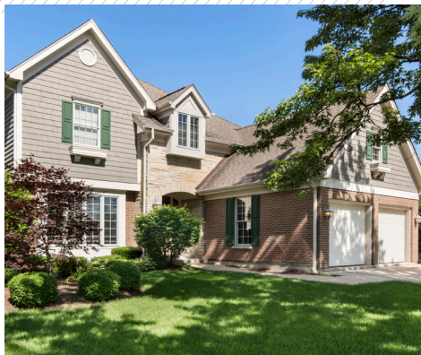
244 MILLS ST. $855,000