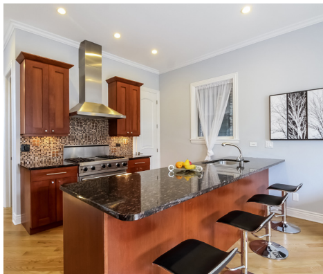
2037 RACE AVE. $740,000