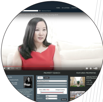
PREMIUM AGENT WEBSITE JAMESON SOTHEBY'S INTERNATIONAL REALTY