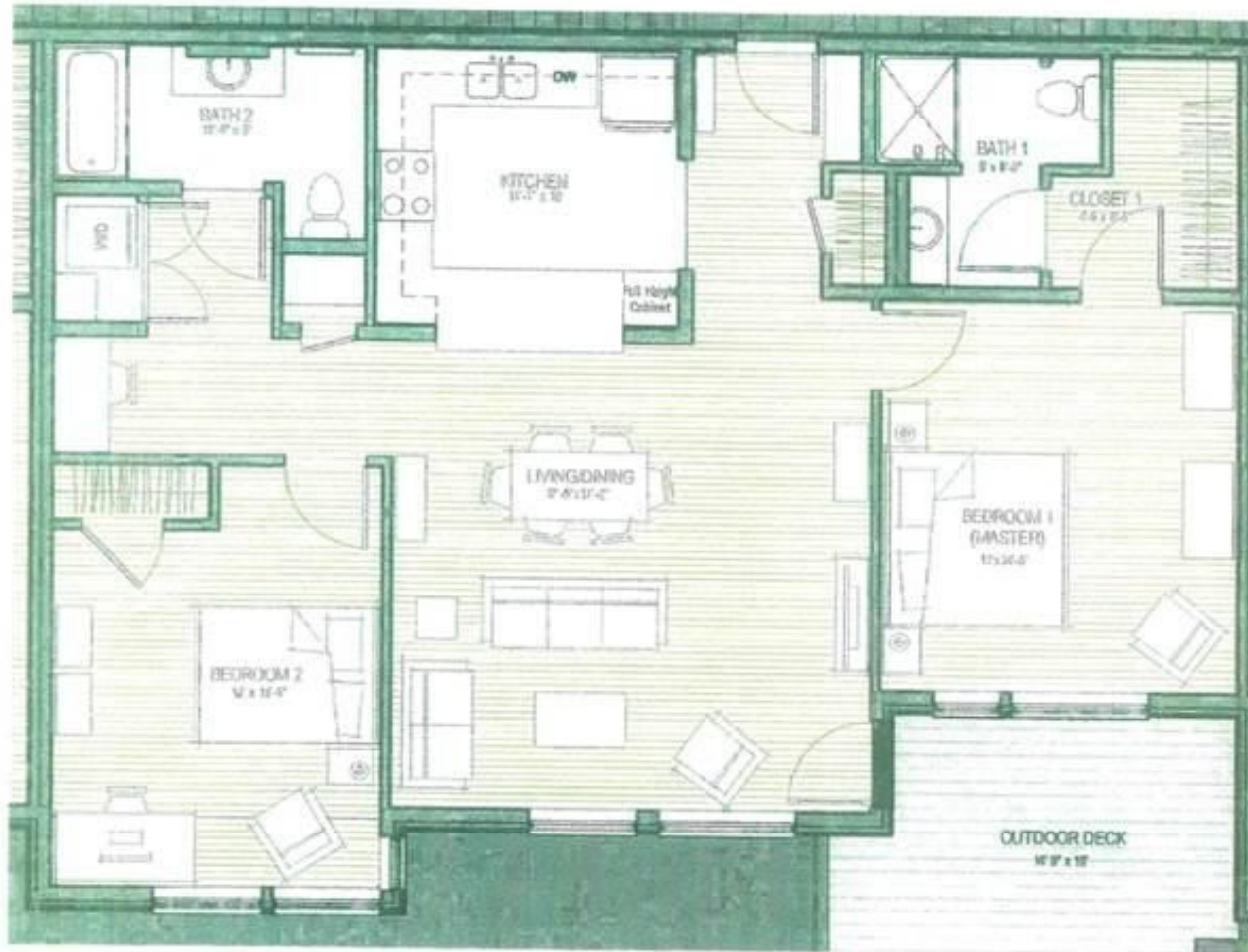
Unit Type A4 AREA: 1288 SF