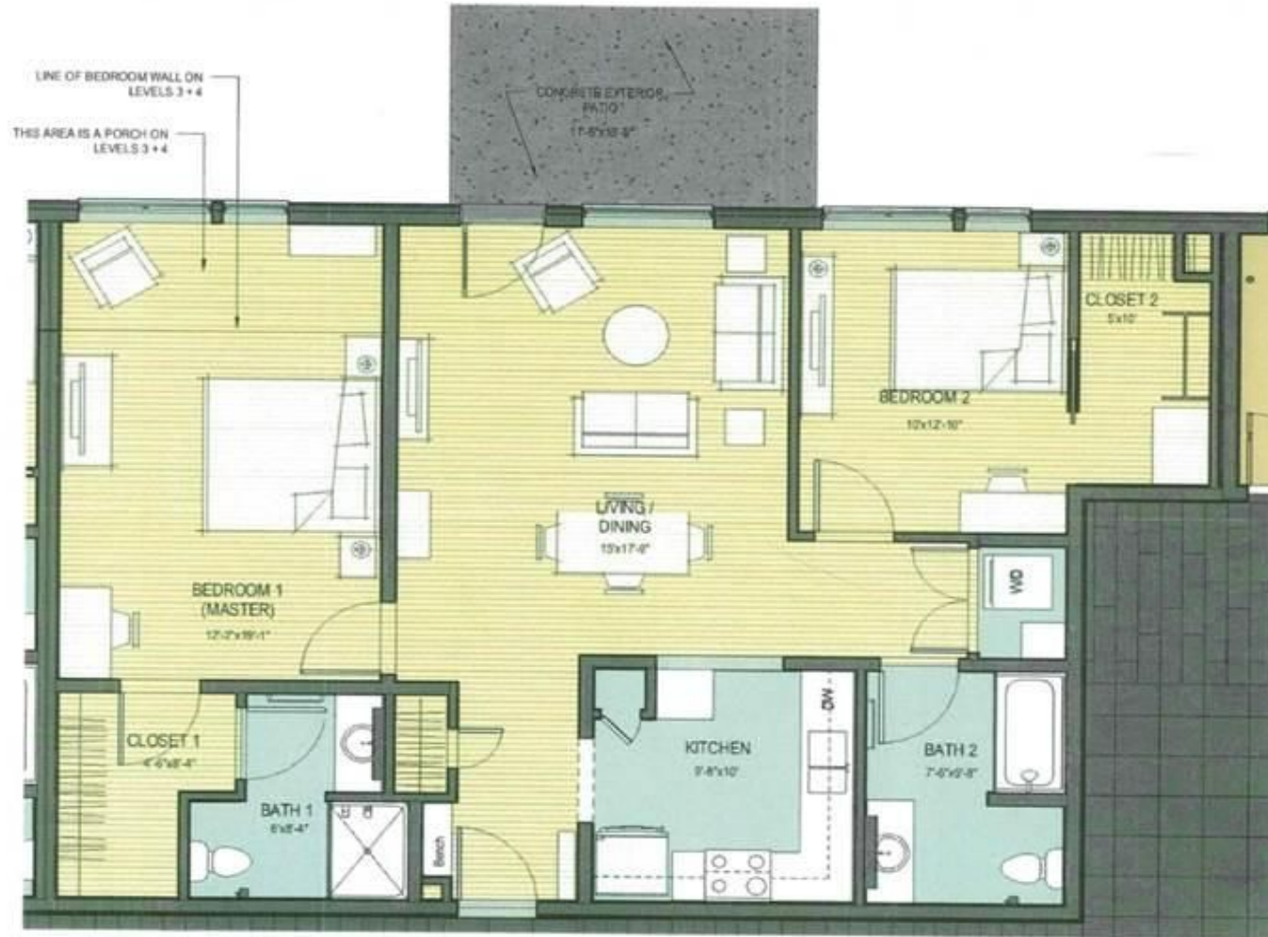
Unit Type A2 - Second Level AREA: 1220 SF (1170 SF @ Upper Levels)