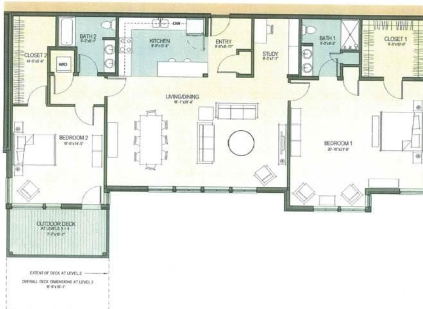
UNIT TYPE A5 AREA: 2040 SF