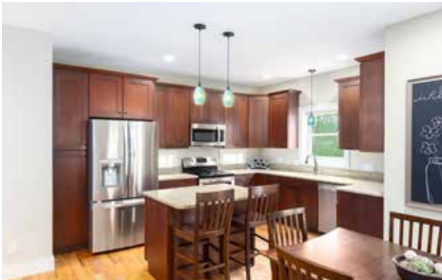
Gourmet Kitchen Features Granite Counter Tops