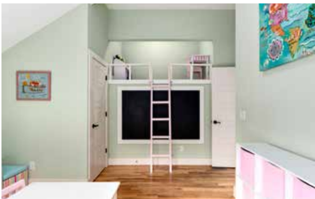
Built-in Loft Bed and Ladder