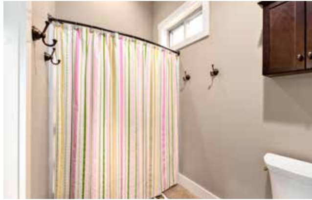
Shower/Tub Combo in Second Level Bathroom