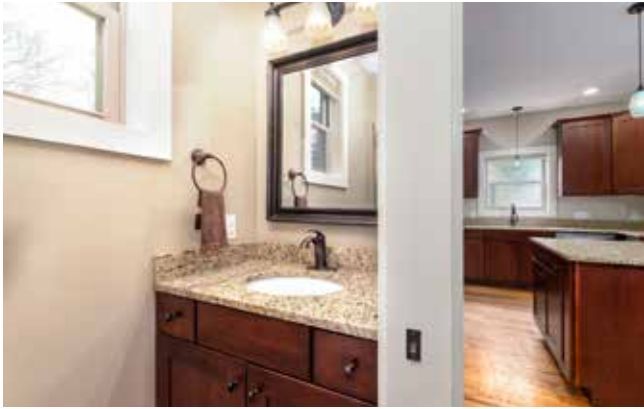
Powder Room on Main Level