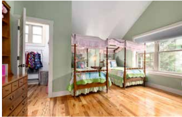
First Upstairs Bedroom