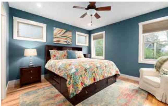
Master Bedroom with Ceiling Fan and Clerestory Windows