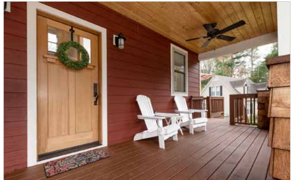
Covered Front Porch with Beautiful Tongue-and-Groove Ceiling