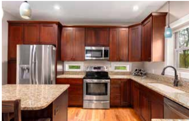
Ample Counter and Cabinet Space • Stainless Appliances