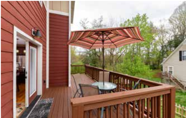
Sunny Side Deck, Perfect for Al Fresco Dining