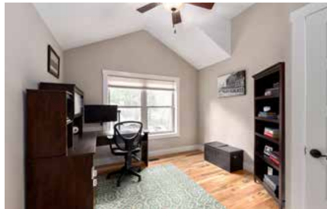
Third Upstairs Bedroom with Vaulted Ceiling

70 MADELINE AVENUE Like-New Arts & Crafts Home in Malvern Hills Asheville, NC 28806