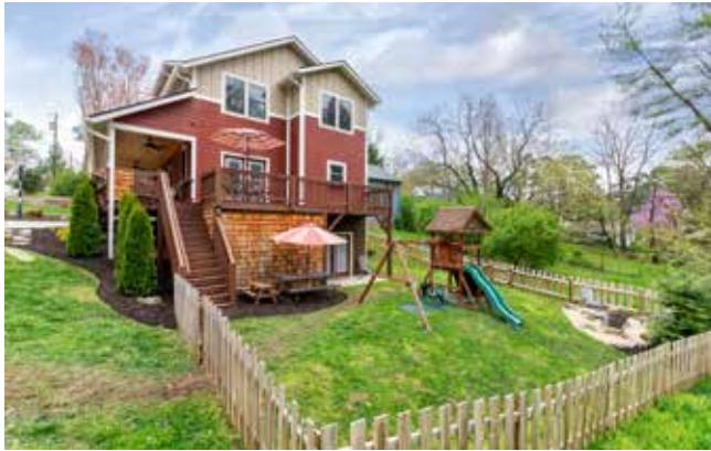
Fully Fenced Back/Side Yard Is Ready for Furry Friends