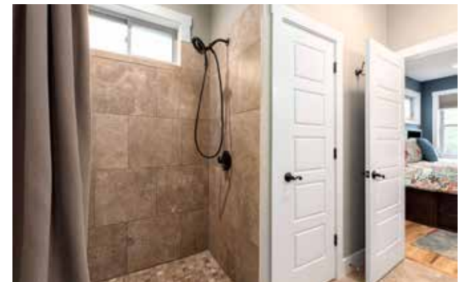
Tiled Walk-in Master Shower