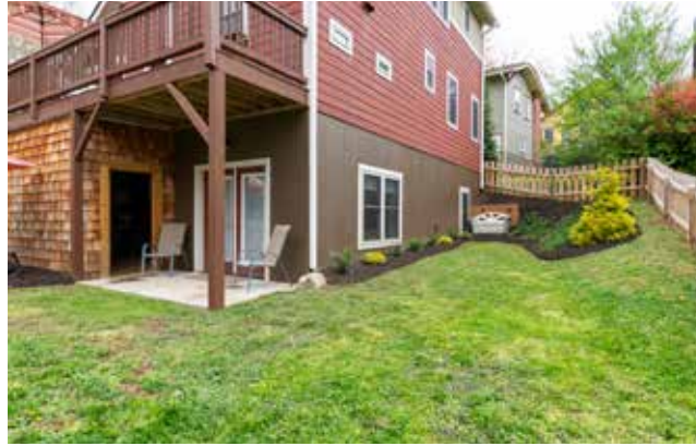
Covered Patio and Shed Storage Under Deck