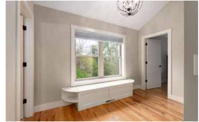
Bright Second-Level Landing with Storage Bench