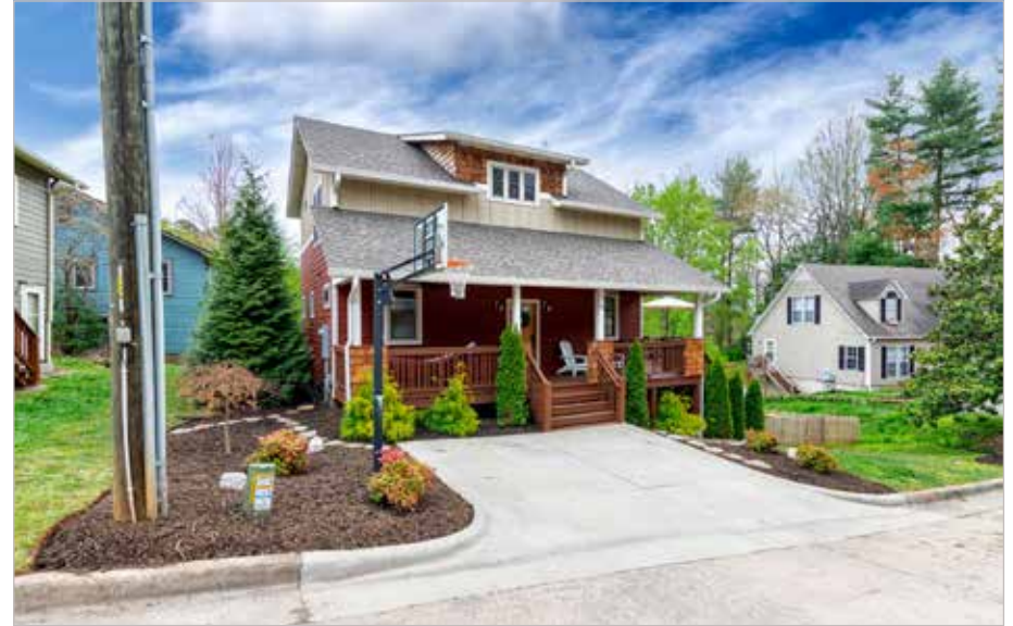
Great Curb Appeal