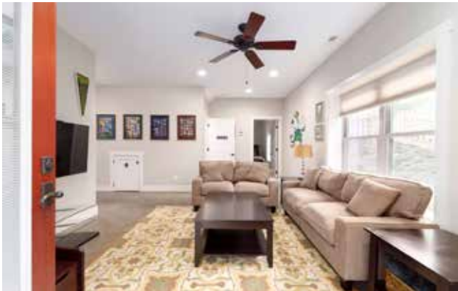
Space to Entertain