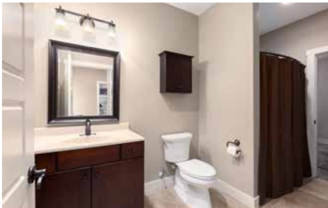
Third Full Bathroom in Basement