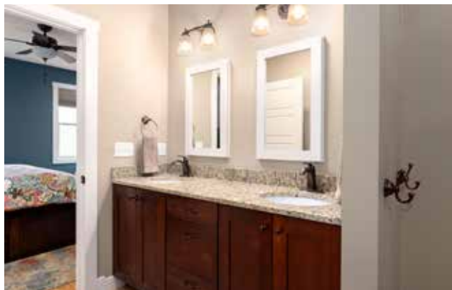
Ensuite Full Bathroom Features Granite Dual Vanity