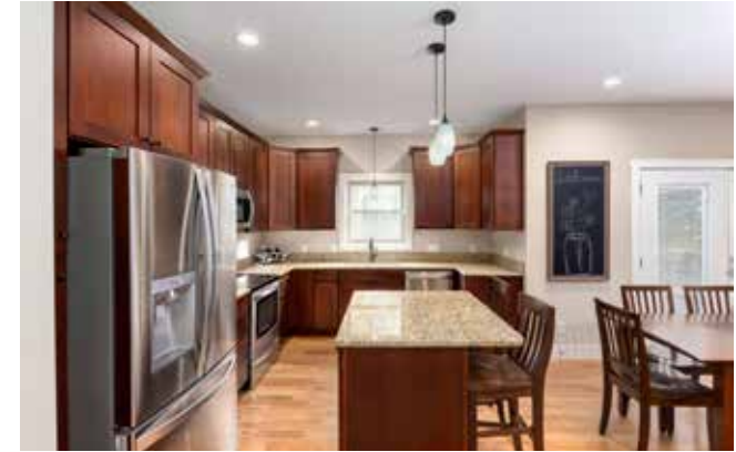
Breakfast Bar Connects Kitchen with Dining Area