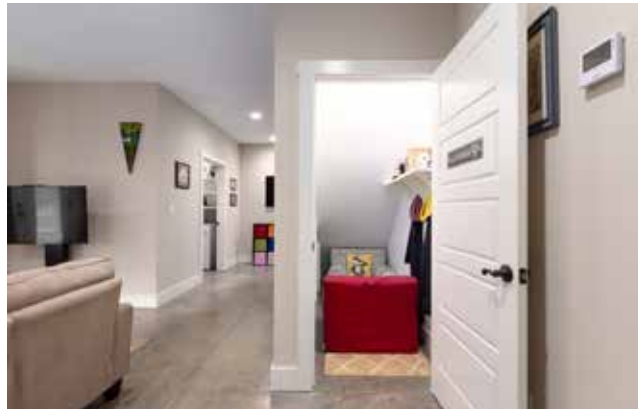
Extra Storage Under Basement Stairs (Harry Potter Closet!)