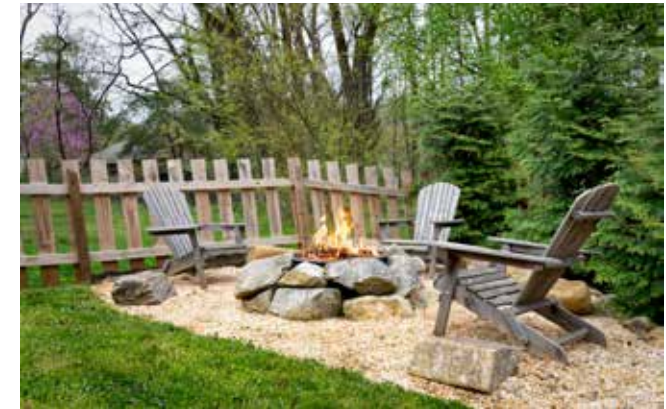
Stone Firepit in Back Yard