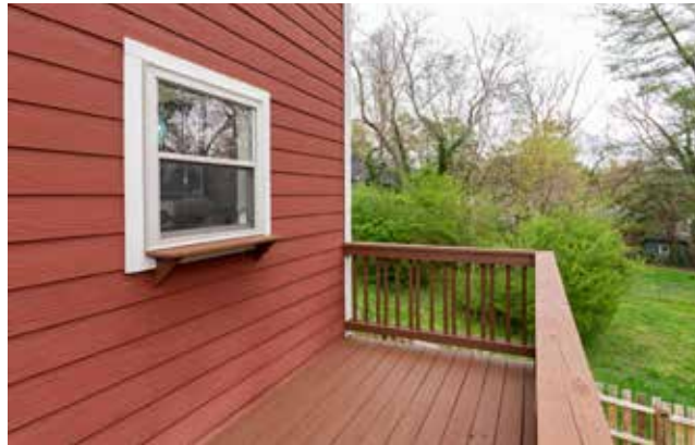
Pass-Through Window Connects Side Deck with Kitchen