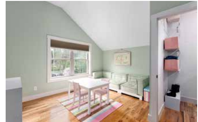
Jack-and-Jill Walk-in Closet Connects Bedrooms 2 and 3