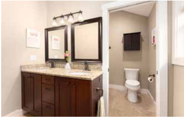
Full Bathroom on Second Level