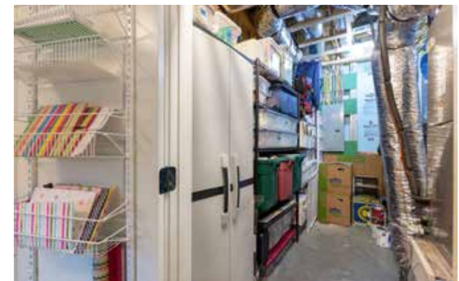
Lots of Extra Storage in Basement Utility Room