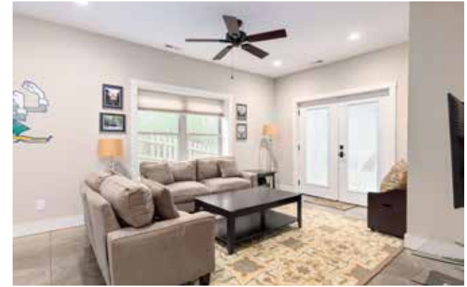
Living Room in Basement with Separate Exterior Entrance