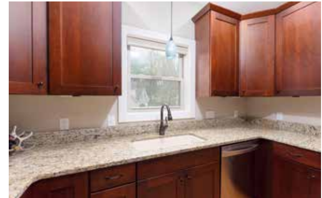
Neighborhood Views from Kitchen