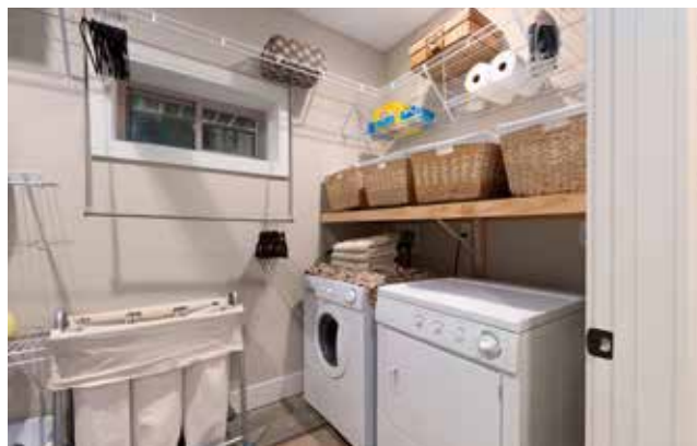
Laundry Room in Basement with Storage Shelves