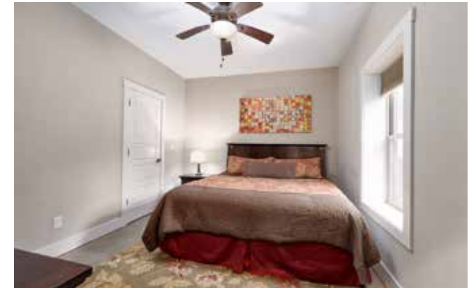
Bedroom in Basement Gets Great Natural Light