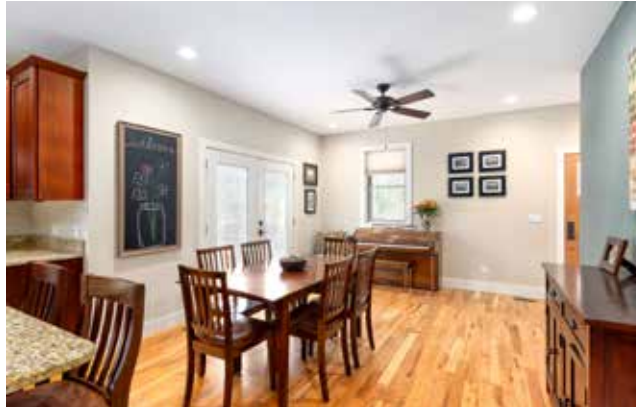
French Doors in Dining Area Open to Sunny Side Deck