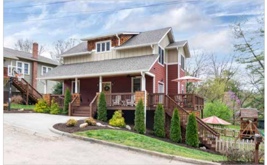
Stately Home on a Gently Sloped Lot

Virtual walkthrough: http://tiny.cc/70Madeline Also, LIVE virtual walkthroughs are available on request!