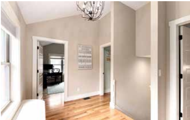
Tall Ceilings on Second Level