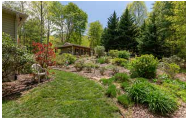
Amazing Yard and Gardens