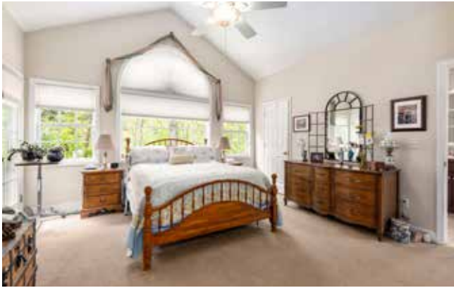
Light and Bright Master Bedroom