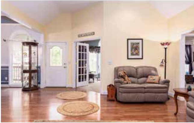
Wood Floors in Main Living Area