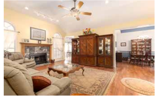
Living Room with Wood-Burning Fireplace