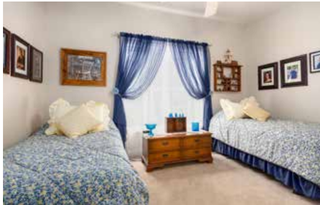
Bedrooms Have High Ceilings