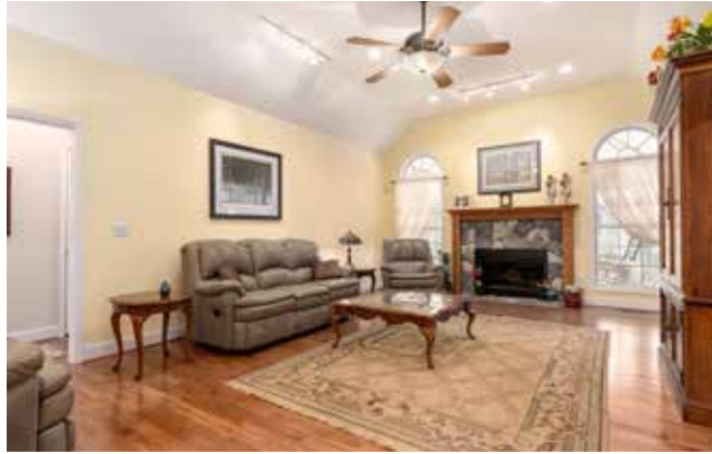
High Ceilings and Thoughtful Lighting