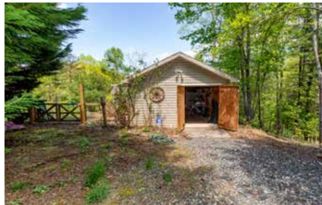
Parking Behind the Shed