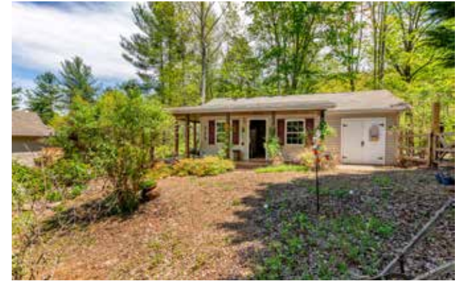
Adorable, Handy Shed