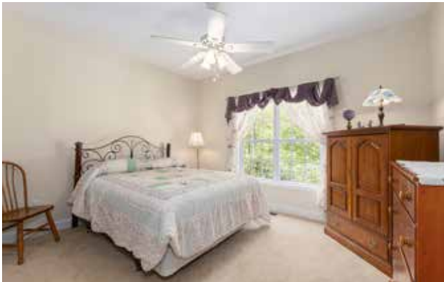
Cozy Guest Bedroom