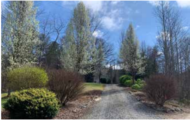
Country Road Takes You Home