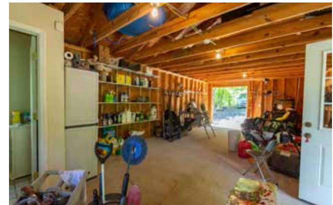
Bathroom and Electricity in Shed on Slab