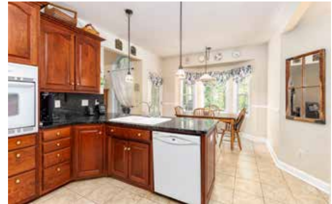
Bright and Sunny