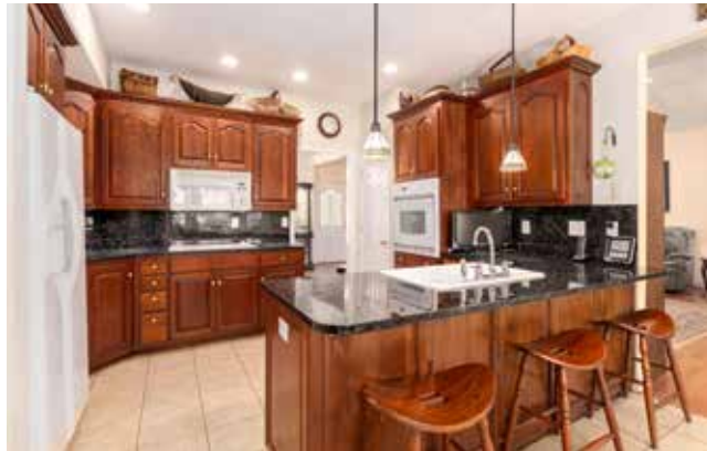
Functional, Spacious Kitchen