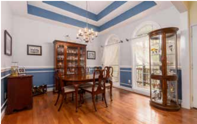
Stunning Dining Room