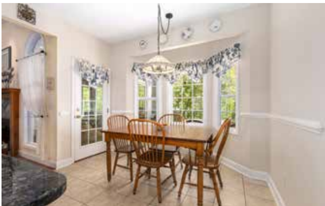
Sweet Breakfast Nook