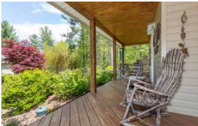
Wrap Around Porch on the Shed