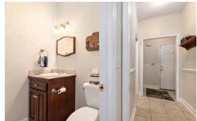
Half Bath on Main