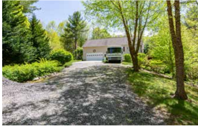
Concrete Pad and Two-Car Garage