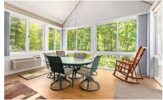
Great Birdwatching from the Sunroom