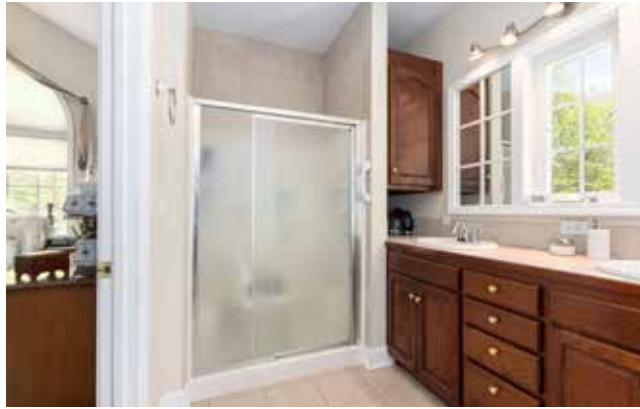
Walk-in Shower in Master Bath