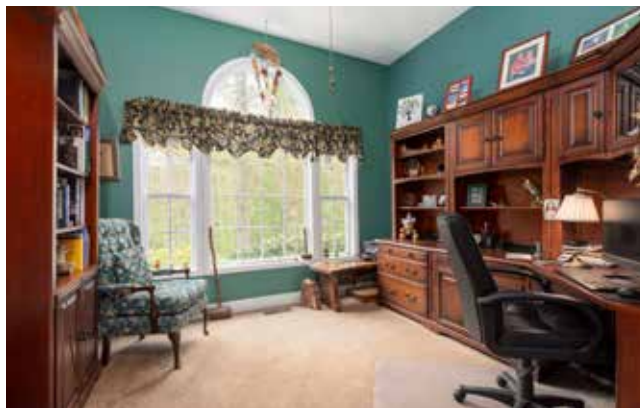
Office on Main Floor