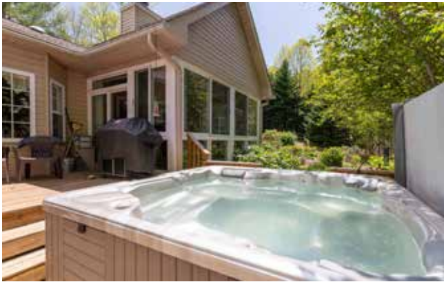
Relax in the Hot Tub