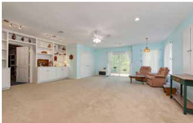
Finished Basement Bonus Room with Private Deck