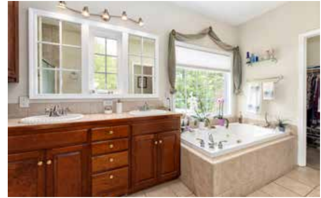
Jacuzzi Tub and Dual Vanity