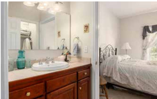
Personal Sinks for Each Bedroom