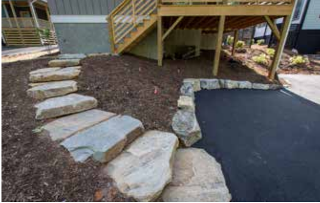
Stone Steps Highlight Professionally Landscaped Yard