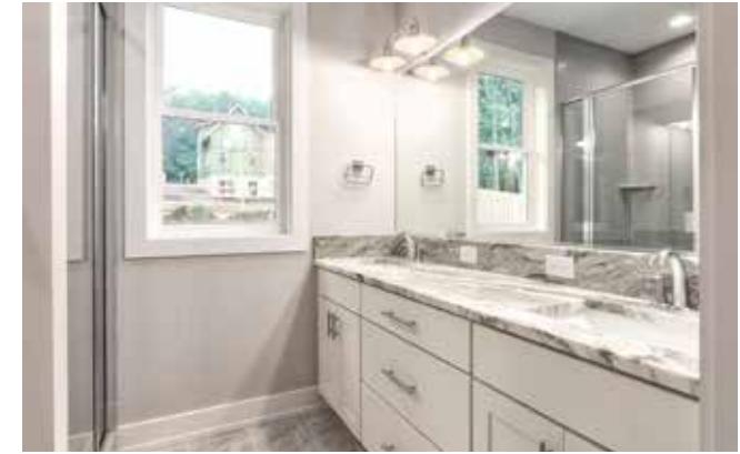
Ensuite Master Bathroom with Dual Granite Vanity