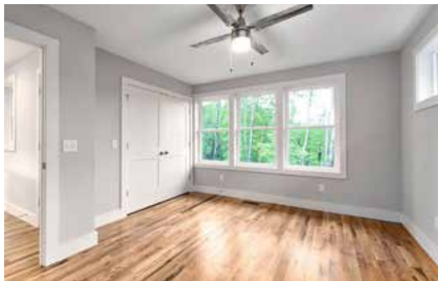
Treetop View from Second Level Bedroom