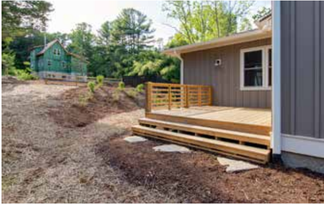
Sunny Back Deck Perfect for Relaxing