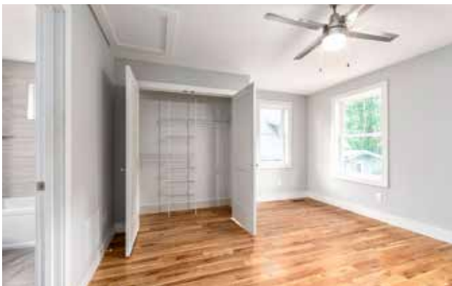
Bedroom #2 Upstairs with Large Closet and Desk Nook