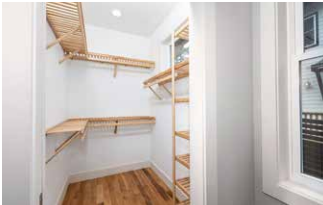
Custom Wood Shelving in Master Walk-In Closet