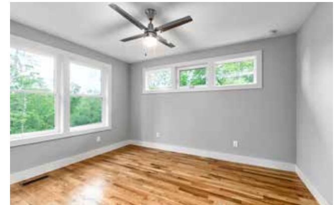
Bedroom #1 Upstairs with Clerestory Window