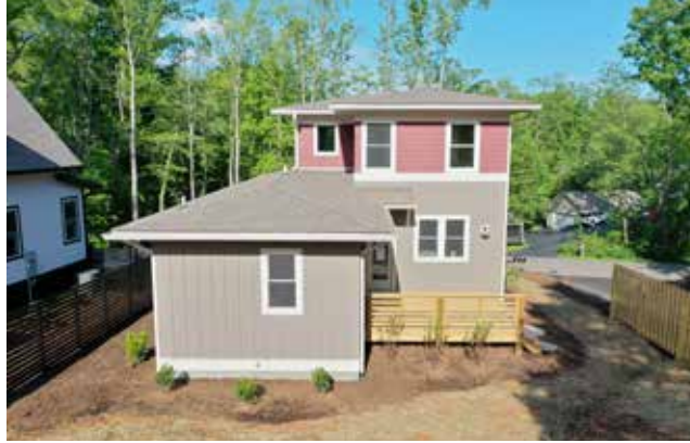
LP Smart Siding and a 30-Year Roof