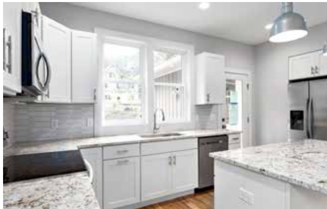
Dovetail Cabinets, Modern Fixtures, and Backyard View