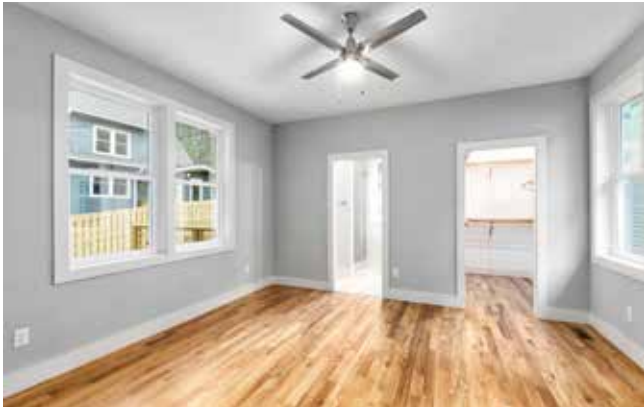
Master on Main Features Ensuite Bath and Walk-In Closet