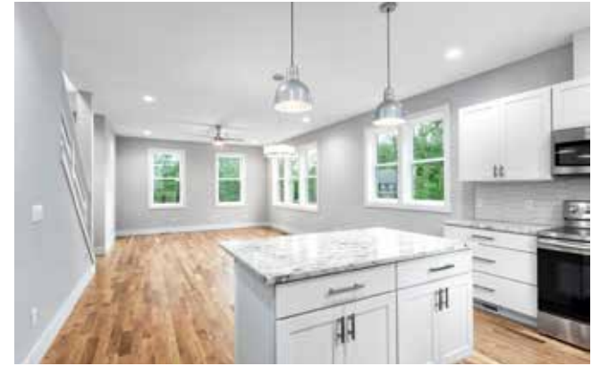
Open, Flowing Floor Plan