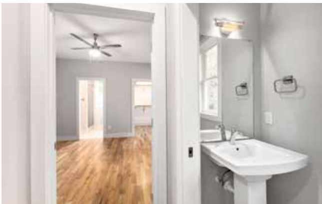
Powder Room on Main Level