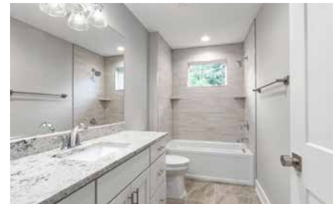
Full Bathroom on Second Level Features Granite Vanity