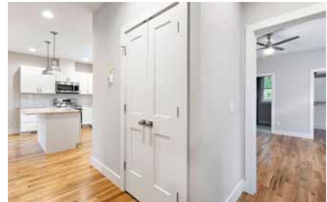
Large Pantry Off of Kitchen