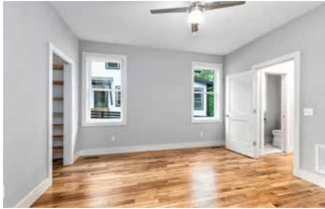
Hardwood Floors and Ceiling Fan in Master Bedroom