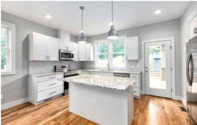
Kitchen has Granite Countertops and Stainless Appliances