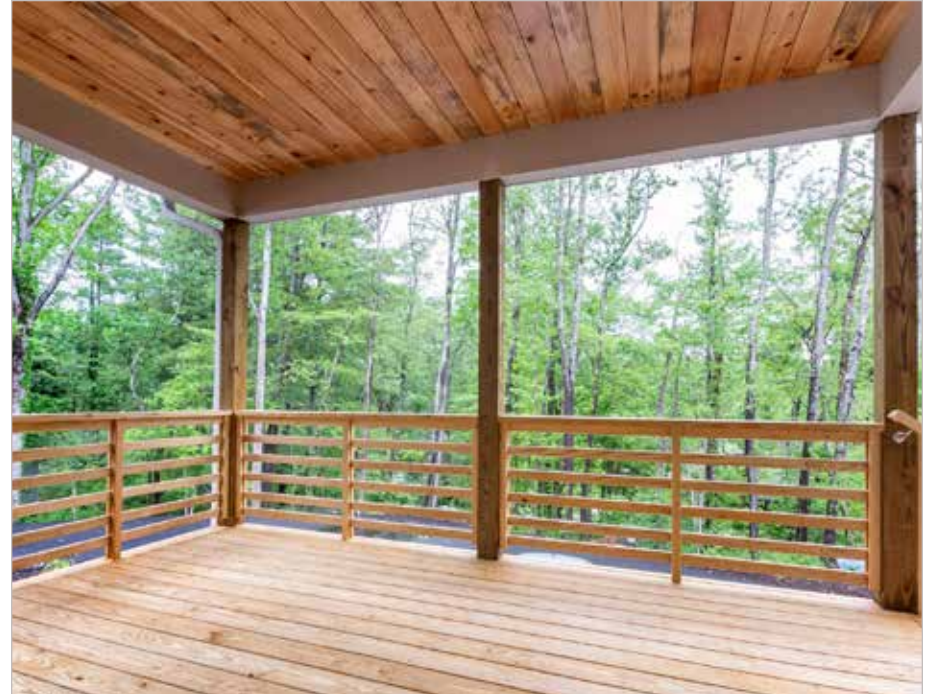
Wrap-Around Porch with Beautiful Tongue-and-Groove Ceiling