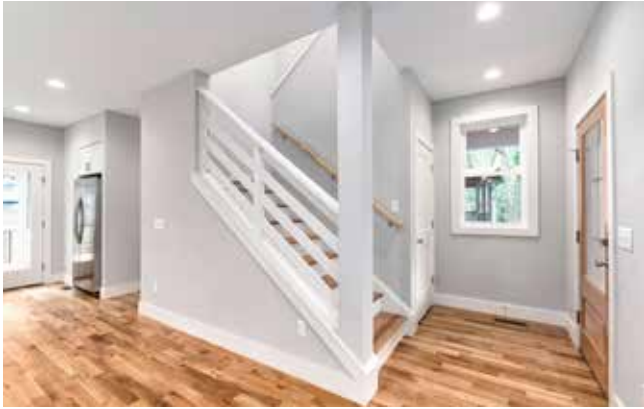
Inviting Entry with Coat Closet and Gorgeous Stairs