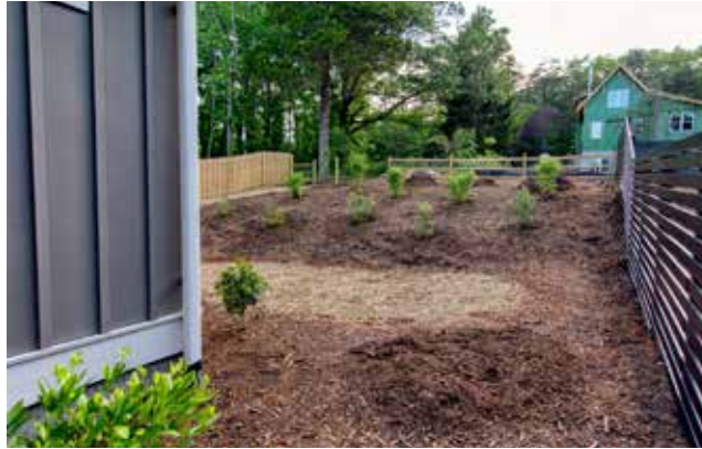
Privacy Fencing Lines Gently Rolling Yard

Beautiful new GreenBuilt and Energy Star home by JAG Construction in the established Haw Creek neighborhood in East Asheville. Open flowing floor plan with oversized windows for great natural light. Hardwood and tile floors throughout. Modern kitchen features granite counters, stainless steel appliances, tile backsplash and a pantry. Breakfast bar opens to dining area. Bright living room and a sunny back deck perfect for entertaining. Master on main features a walk-in closet and an ensuite bathroom that includes a double granite vanity and tiled walk-in shower. The second level includes two bedrooms and a modern bathroom. Outdoor living with a covered wrap-around front porch, spacious deck and fantastic yard. Low maintenance with durable materials including a 30-year roof and 50-year siding.