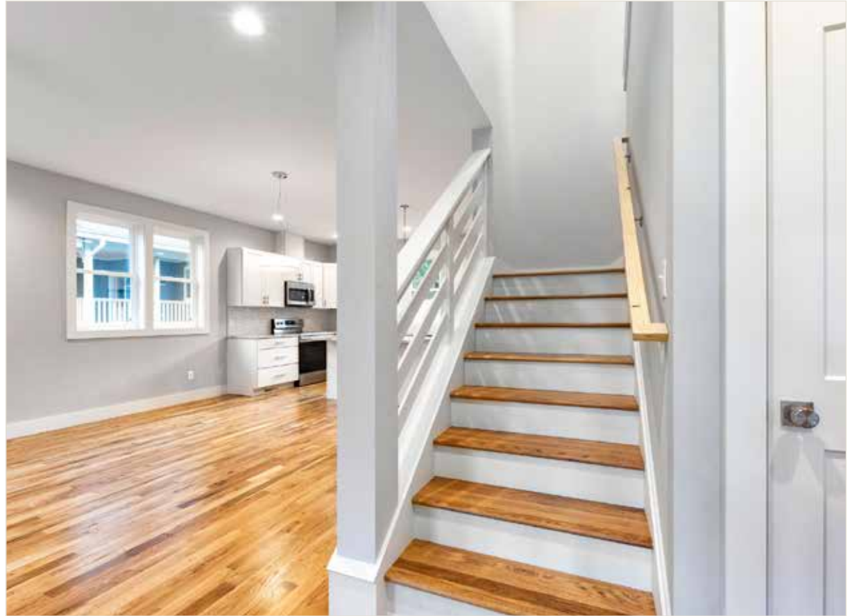
Efficient Design and Lots of Space