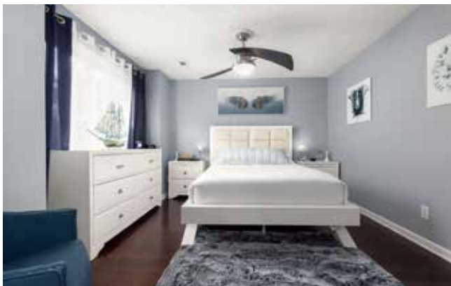
Light and Bright