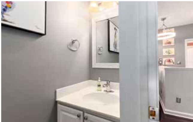
Powder Room off Entry