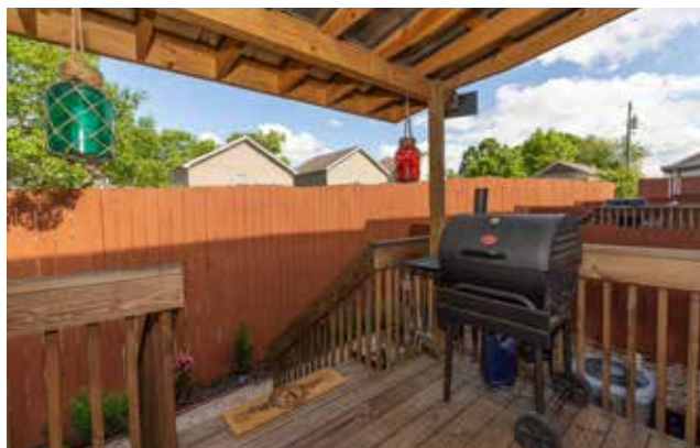
Covered Porch is Great for Grilling

67 NANCY ST. #D Beautifully Maintained Townhome Asheville, NC 28806