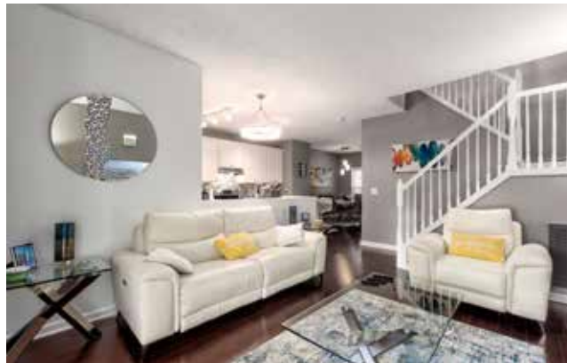
Wood Flooring Throughout