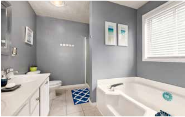
Dual Vanity with Soaking Tub and Separate Shower