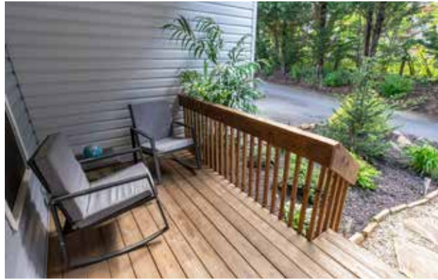
Welcoming Front Porch