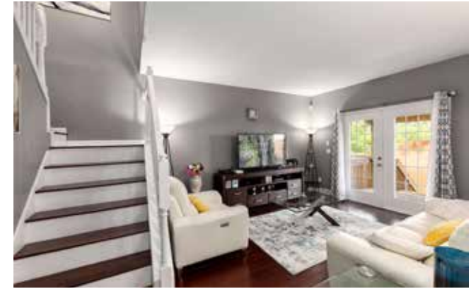
French Doors to Back Porch and Patio