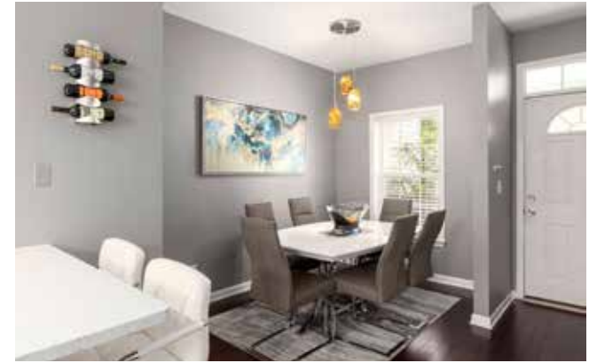
Great Spot for Dining or Office Nook