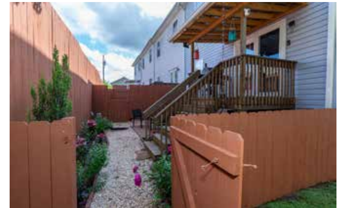
Lovely Private Patio and Covered Porch