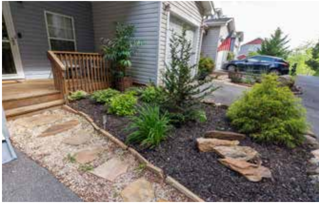
Inviting Front Entry