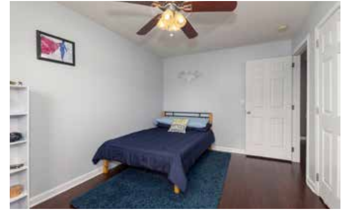
Guest Bedroom Two