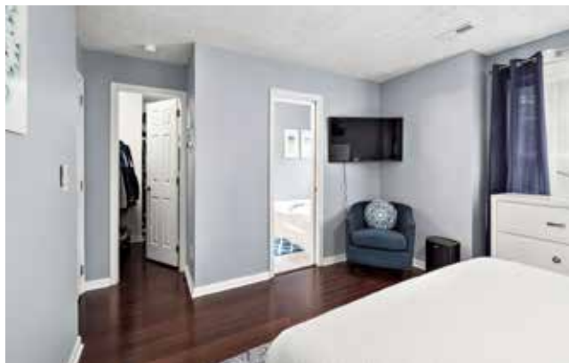
Master Opens to Walk-in Closet and Bath

67 NANCY ST. #D Beautifully Maintained Townhome Asheville, NC 28806