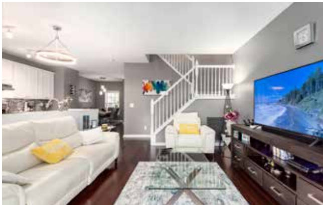
Plenty of Space for Entertaining