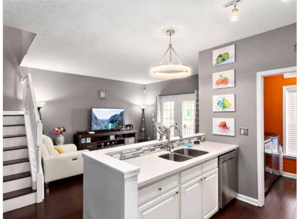
Open and Bright