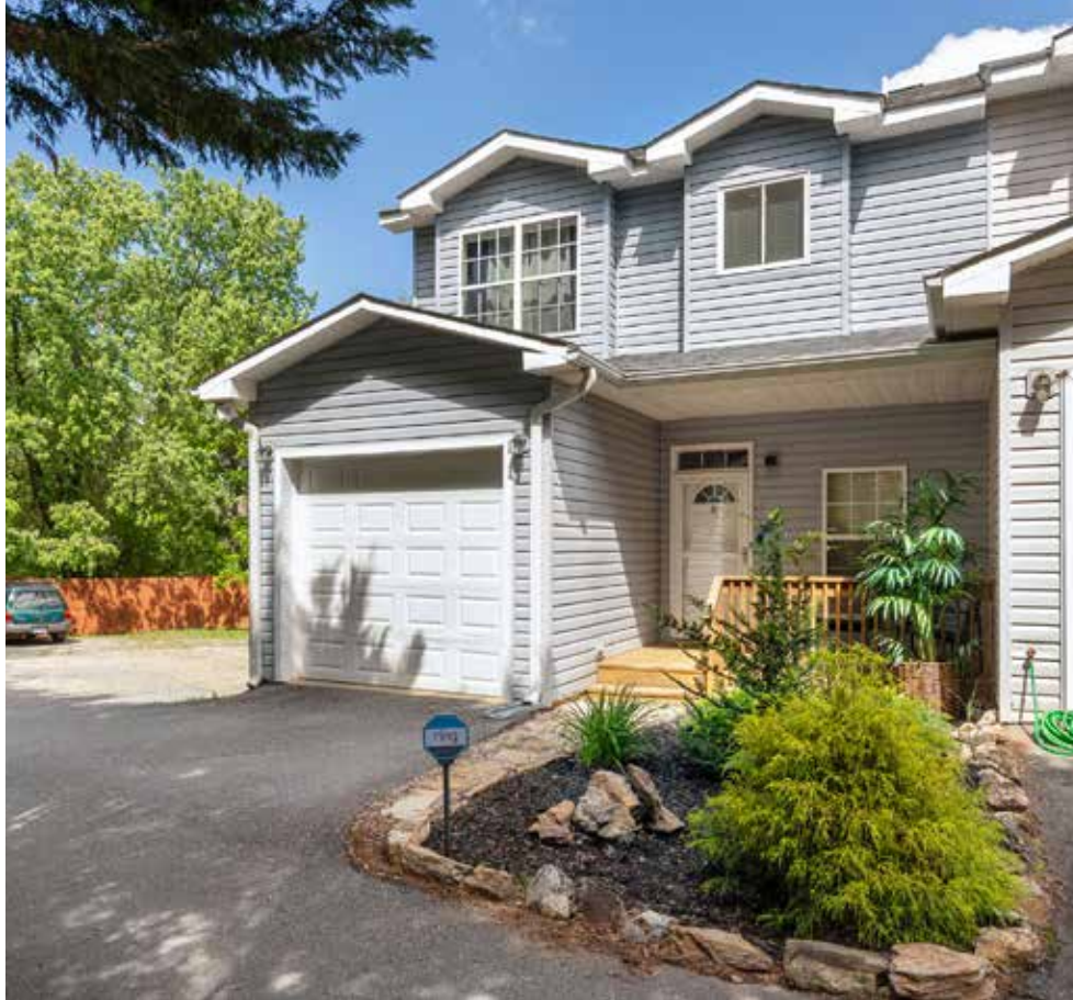
One-Car Garage with Ample Guest Parking