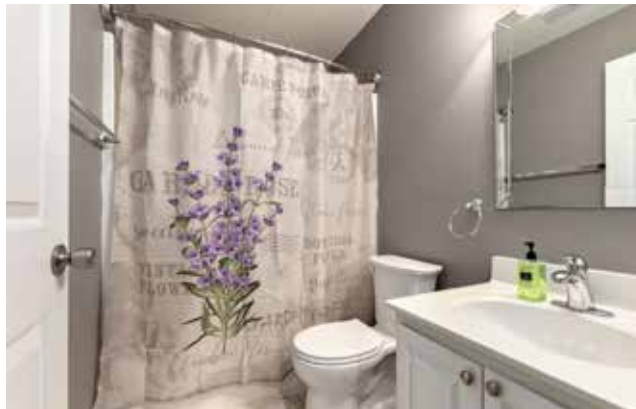
Freshly Painted Guest Bath