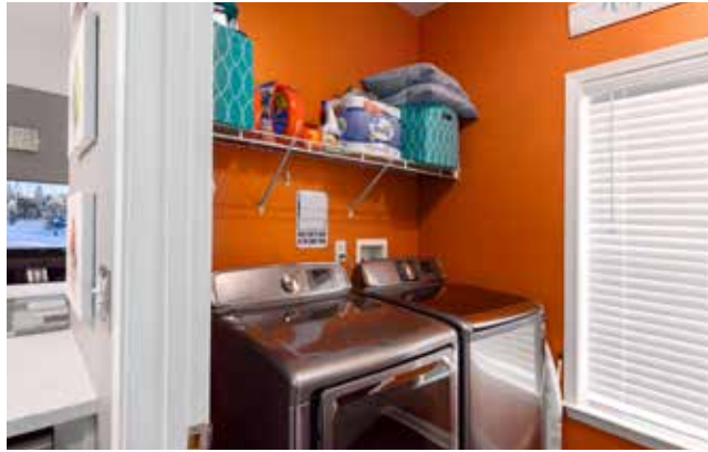
Bright and Cheerful Laundry Room