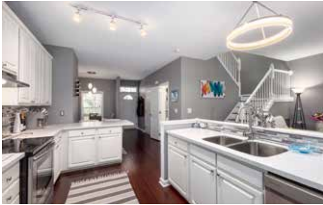
Solid Surface Countertops