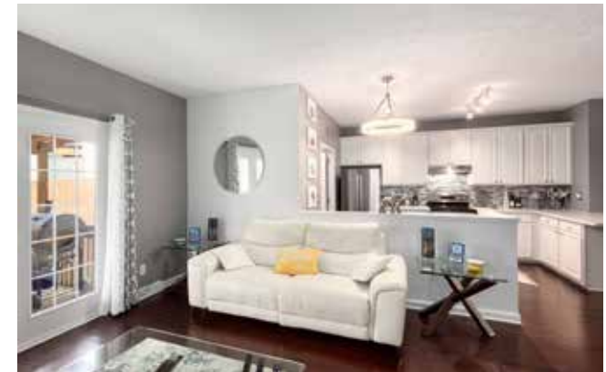
Kitchen Opens to Living Room