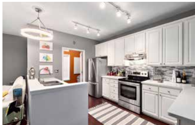
Open Kitchen with Plenty of Counterspace