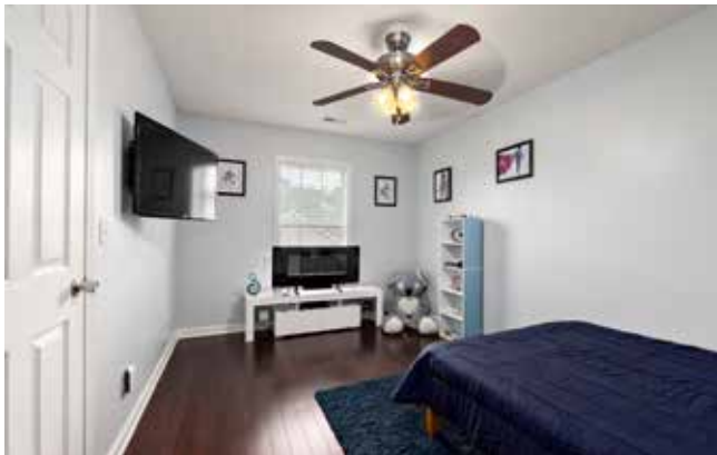
Guest Bedroom Two - View Towards Window