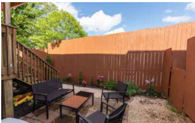
Perfect for Coffee or Cocktails