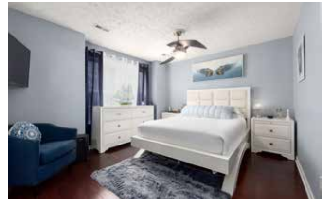
Serene Master Bedroom