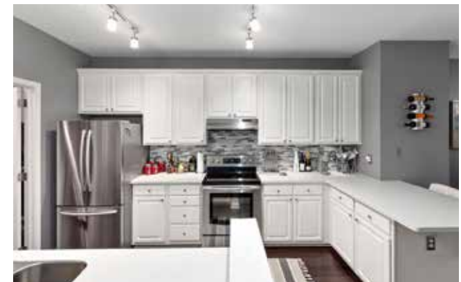
Stainless Steel Appliances