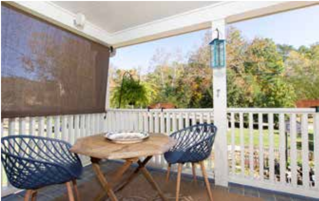
Private Master Balcony