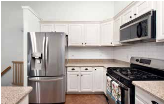
New Stainless Steel Appliances