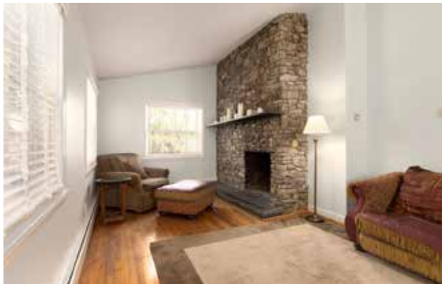
Gorgeous Stone Fireplace