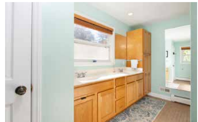
Dual Master Vanity