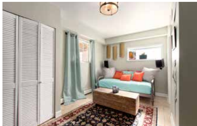
Lower Level Bedroom