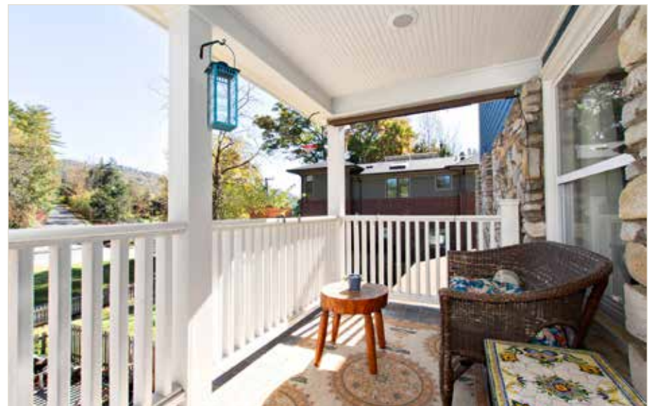
Views of Grove Park Property