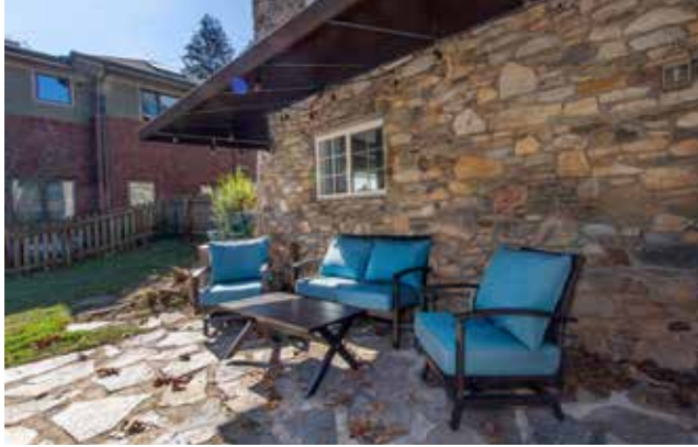
Rear Flagstone Patio