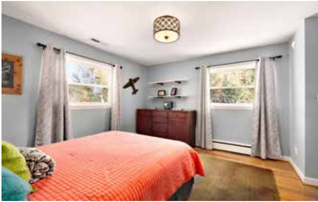
Upstairs Bedroom (1)