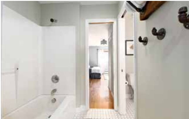
Upstairs Shared Bathroom