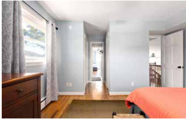
Jack-and-Jill Bathroom Upstairs