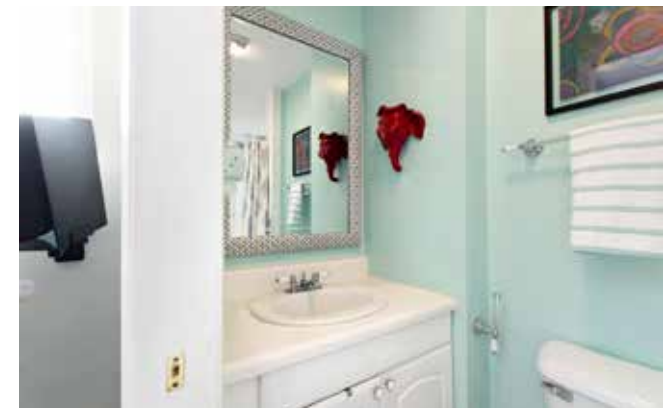
Lower Level Bathroom Vanity