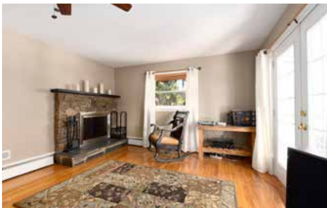
Master Bedroom with a Fireplace!