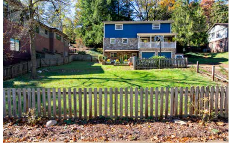
Fenced-In Back Yard