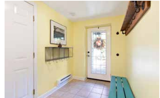
Lower Level Entry