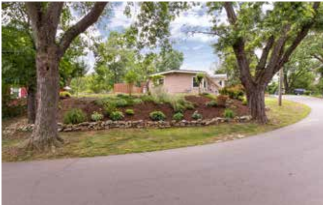
Huge Corner Lot with Excellent Curb Appeal

Completely renovated mid-century ranch home in desirable West Asheville. Huge corner lot just a quick stroll from lively Haywood Road, and just minutes to downtown Asheville. This home boasts a chef's kitchen ready to entertain, vaulted ceilings, gorgeous hardwood floors, ample storage, and a sunny back patio perfect for gatherings. Three bedrooms and two full bathrooms on the main level, including a master bedroom suite with a large walk-in closet. Lots of outdoor living, with a fully fenced back yard, level side yard, and established garden beds. Oversized one-car garage with plenty of extra storage. This home was completely rebuilt in 2014 with all new systems (HVAC and ducts, plumbing, electrical, etc.), the addition of a second full bathroom, insulation, drywall, metal roof, windows/doors, fiber cement siding, plumbing fixtures, and lighting fixtures. See video for details.