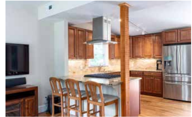
Breakfast Bar Connects Living Room to Kitchen