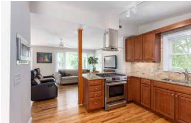
Open Floor Plan Makes Entertaining Easy