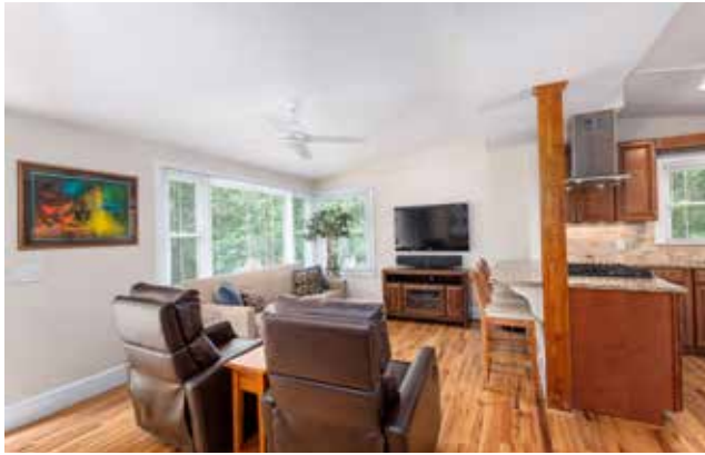
Living Room with Large Windows for Great Natural Light