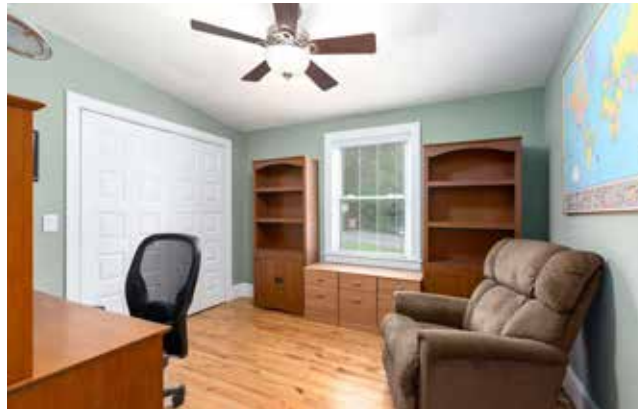
Versatile Third Bedroom, Perfect for Home Office