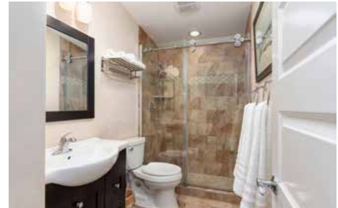
Second Bath with Walk-in Shower/Sliding Glass Door