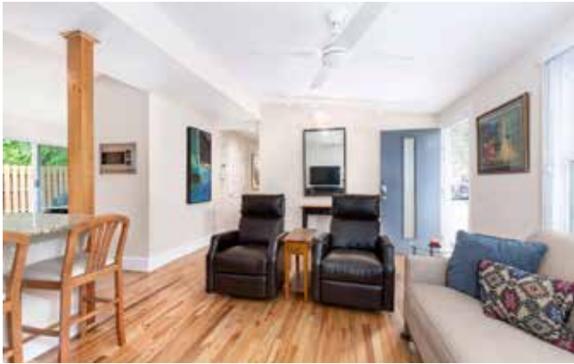
Vaulted Ceiling at Inviting Entry