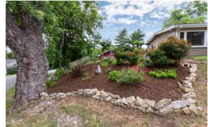
Established Garden Beds and Mature Trees