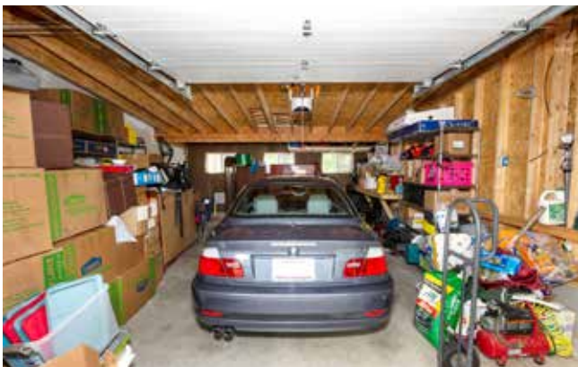
Oversized One-Car Garage with Plenty of Extra Storage