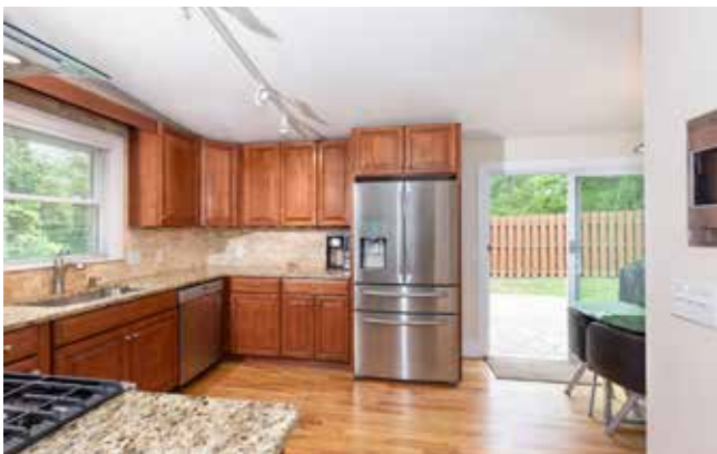
Great Flow through the Home