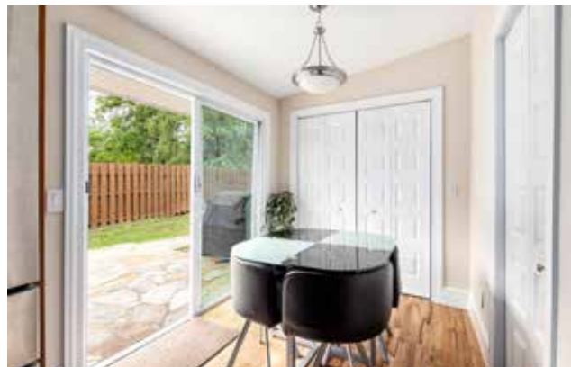
Large Sliding Door Connects Dining Area and Back Patio