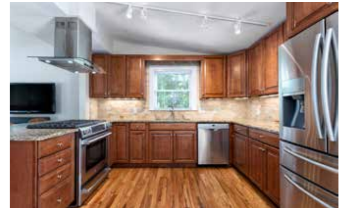
Dovetail Cabinets and Lots of Counter Space