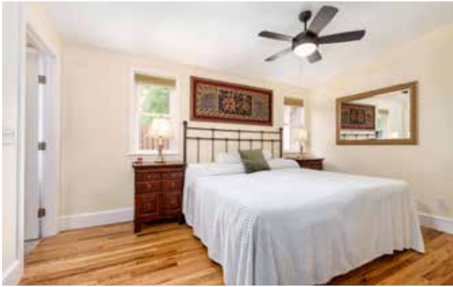
Master Bedroom with Vaulted Ceiling and Private Views