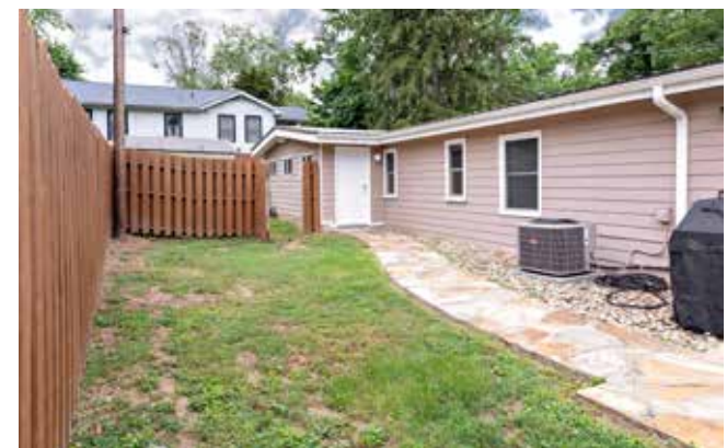
Fully Fenced Back Yard for Four-Legged Friends