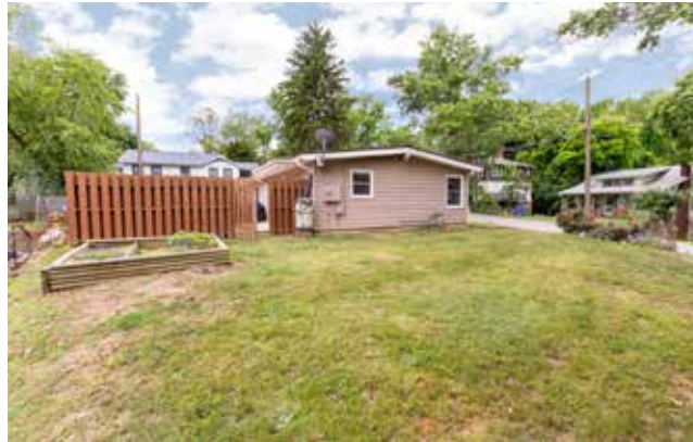
Level Side Yard with Room to Play and Plant