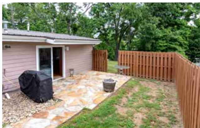
Sunny Back Patio, Ready for Outside Gatherings