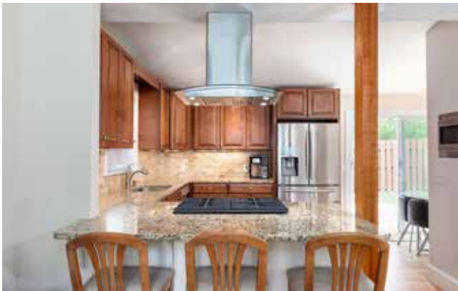
Granite Counters • Stainless Appliances • Drop-Down Hood