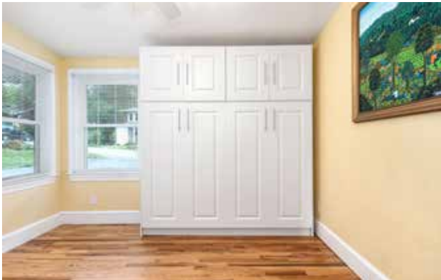
Murphy Bed in Stored Position Invokes Space to Create