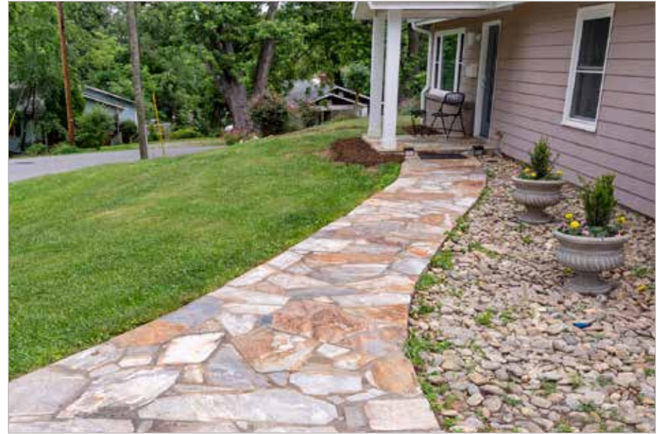
Beautiful Laid-Stone Path