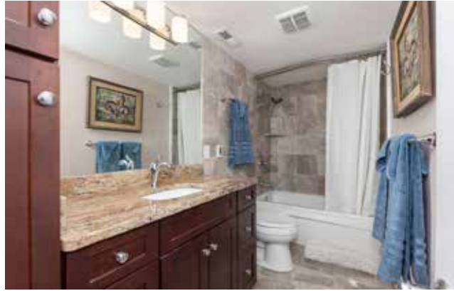
Ensuite Bath with Granite Vanity, Tiled Shower, Storage