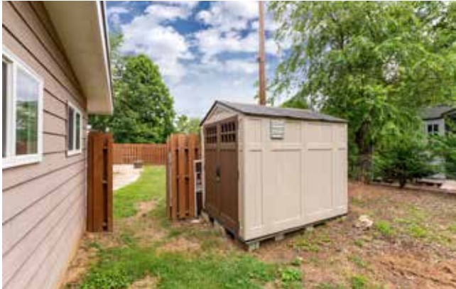
Storage Shed Is Perfect for Garden Tools