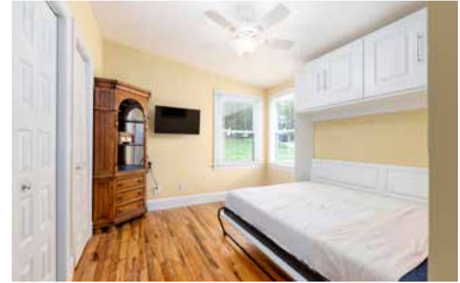
Second Bedroom Features a Built-in Murphy Bed