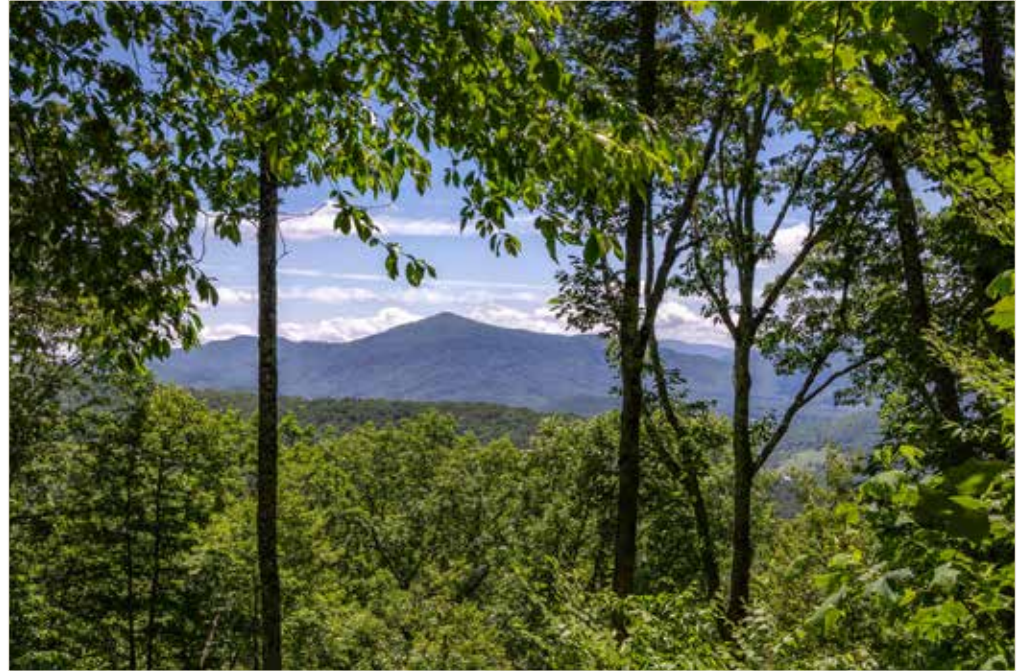
Year-Round Panoramic Mountain Views