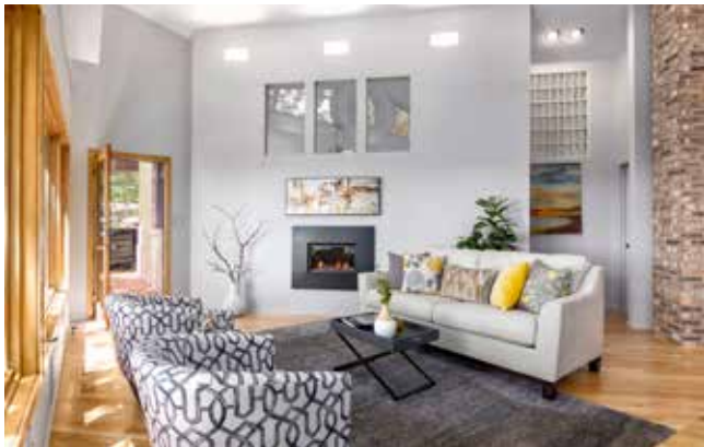
Contemporary Design and Architecture