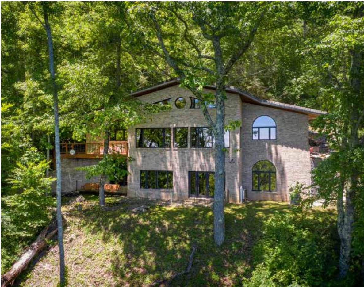
Lock-and-Go Passive Solar Masterpiece on 8.27 Acres in Fairview

Views, views, and more views! Come see this rare and highly sought-after passive solar, energy-efficient, modern mountain masterpiece! This custom-crafted home includes a 50-year concrete-tiled roof, Tulikivi soapstone thermal wood stove, HRV system, Generac generator, gas-efficient furnace, energy-efficient gas fireplace, and the list goes on. Enjoy this generous 8.27-acre lot amongst the old growth trees, mountain laurel and rhododendron. Enjoy the beautiful sunrises and sunsets while experiencing exceptionally low utility bills, thanks to the solar gain in the morning and the passive cooling from the shade trees in the afternoon. Low-maintenance exterior and gated driveway entrance makes this the ideal lock-and-go second home. Fairview Forest features 10 miles of paved roads, hiking trails, and a clubhouse. Enjoy Arrowhead Trail as it meanders alongside Trantham Creek under a canopy of shade trees. Conveniently located only 13 miles from downtown Asheville. No short-term rentals allowed. LIVE virtual walkthroughs are available on request!