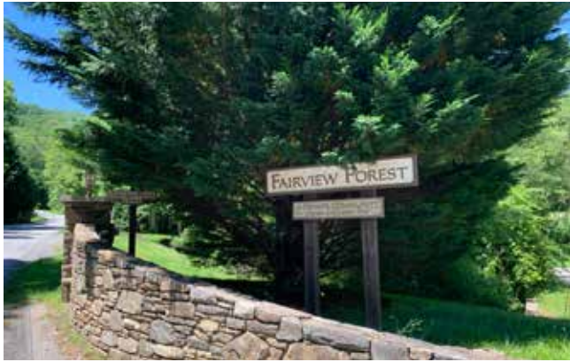
Welcome to Fairview Forest