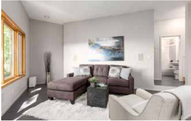
Cozy, Lower-Level Living Area