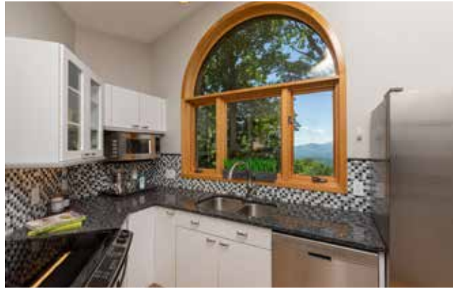
Under-Cabinet Lighting and Stainless Steel Appliances