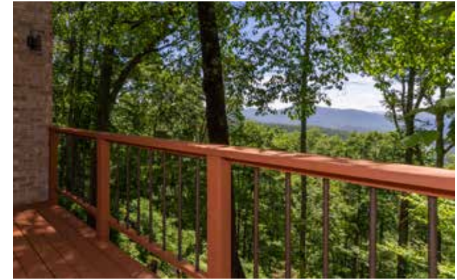
Views from Shaded Back Deck