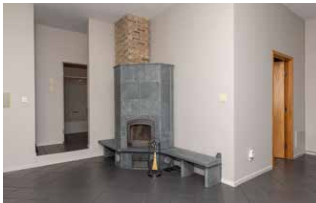
Tuliviki Finnish Soapstone Wood Stove