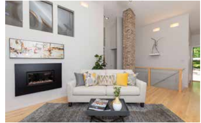
Sleek Gas Fireplace Is 95% Efficient