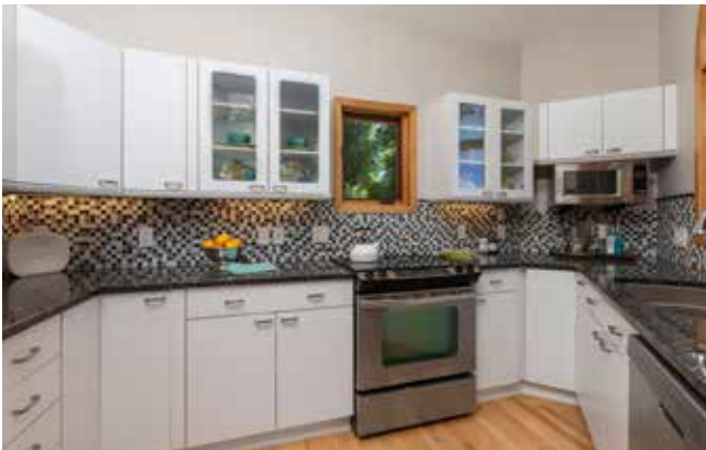
Beautiful Glass-Tiled Backsplash and Granite Countertops