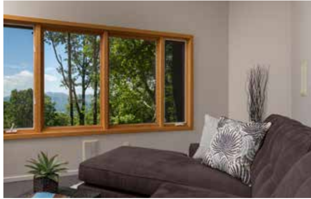
Beautiful Mountain Views Throughout