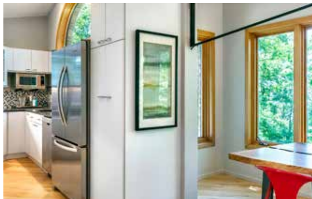
Interesting Lines and Angles