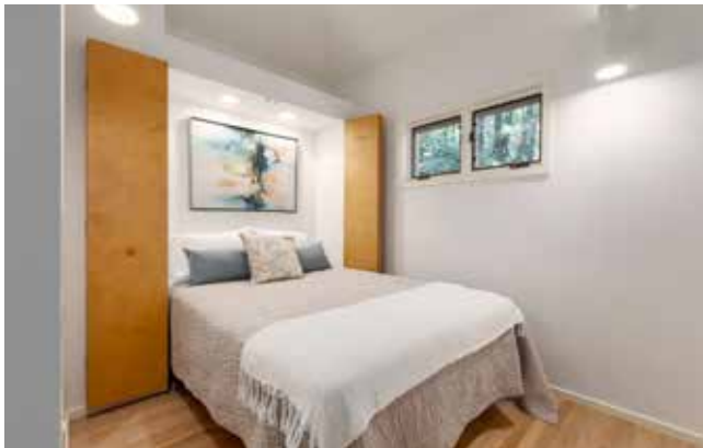
Efficient Use of Space for Guests