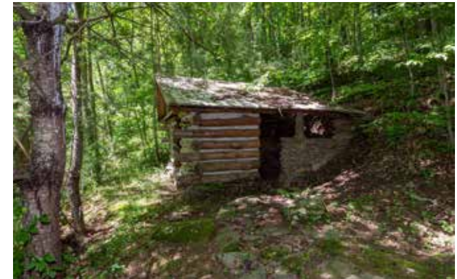
Log Cabin Storage Shelter