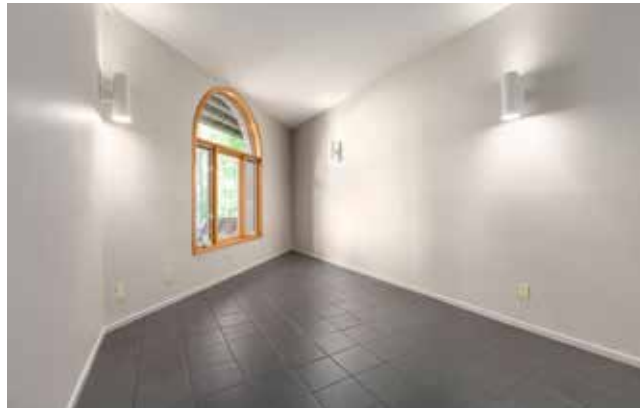
Lower-Level Third Bedroom