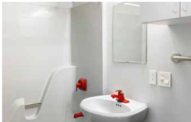
Lower-Level Bathroom with Custom Plumbing Fixtures

CHESTNUT FOREST Green-Built, Modern Mountain Masterpiece 212 Chestnut Forest Road Fairview, NC 28730