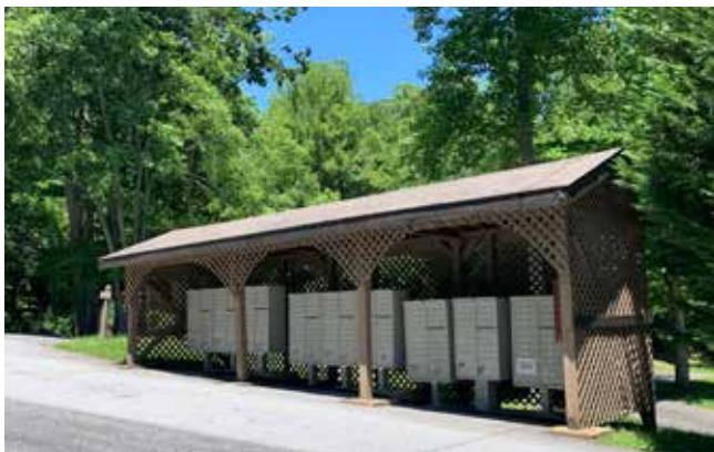
Community Mail Pick-Up