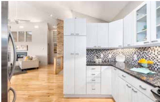
Generous Storage and Open-Floor Concept