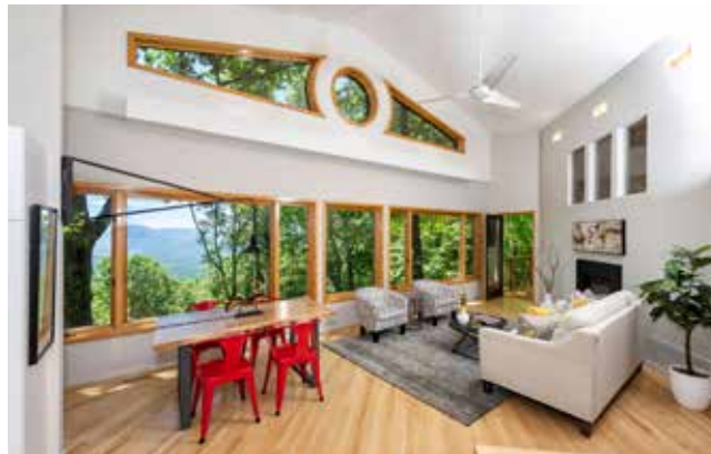
Custom, Low-E, Argon-Filled Marvin Windows - R4.5