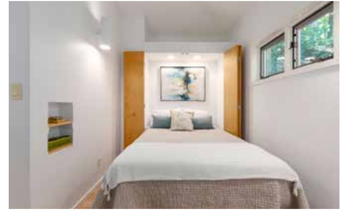
Murphy Bed Easily Converts Office to Guest Bedroom