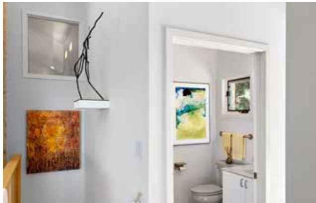
Main-Level Guest Bathroom