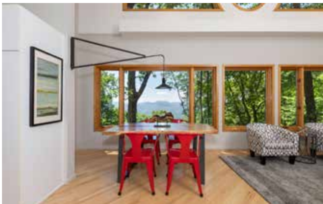
Solar-Powered Lighting over Dining Area