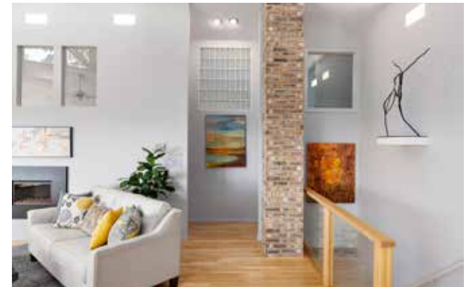
Main Level Access to Bedrooms and Stairs to Lower Level