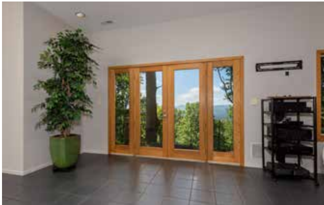
French Doors Lead to a Small Walkout Overlook