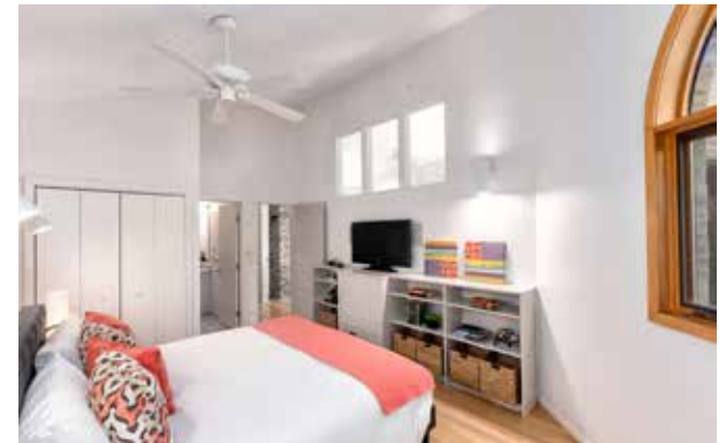
Master Bedroom with Interior Windows for Passive Lighting