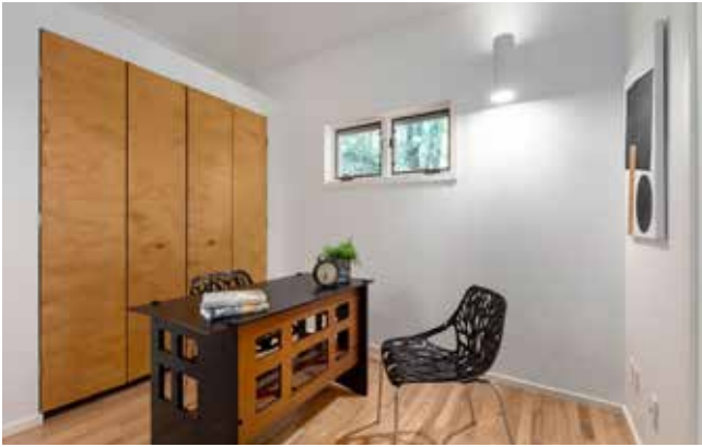
Main-Level Guest Bedroom/Office