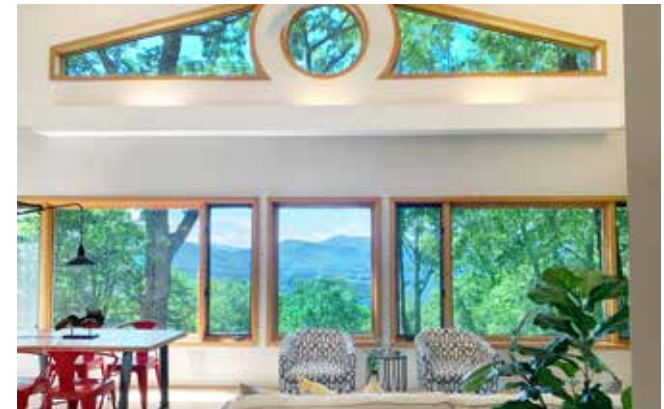
Stunning Passive Solar Design with Breathtaking Views