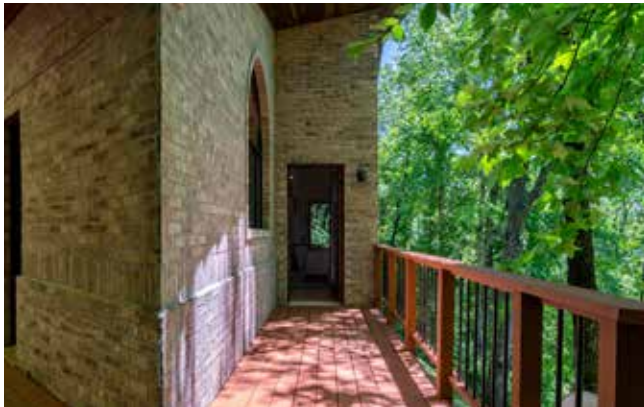
Eye-Catching Design and Architecture