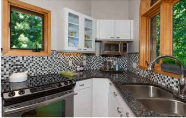
Custom Glass-Faced Shelves and Cabinets