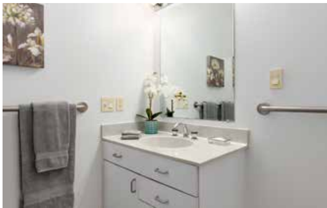
Ensuite Master Bathroom