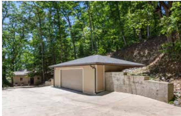
Oversized Two-Car Garage and Concrete Driveway