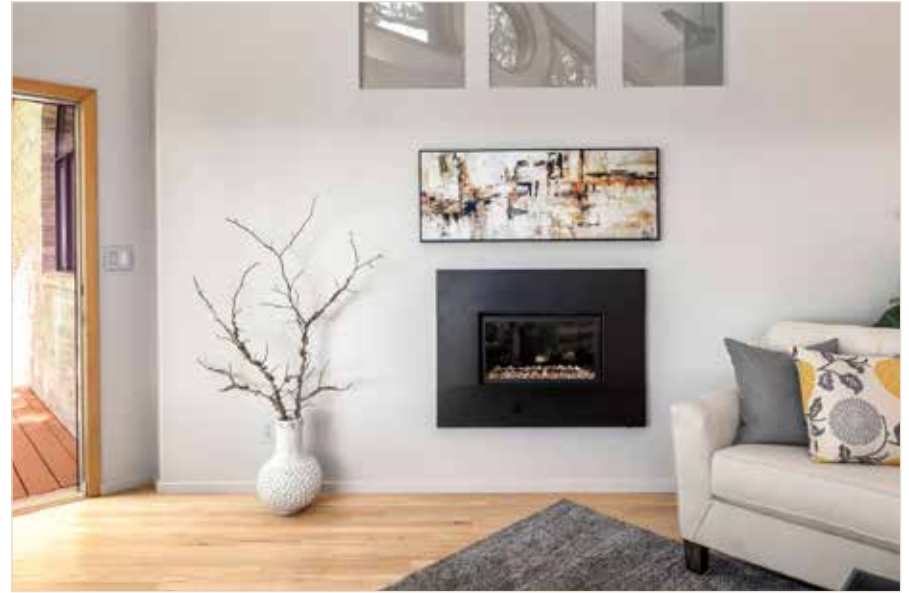
95% Energy- and Cost-Efficient Gas Fireplace Heats the Entire First Floor