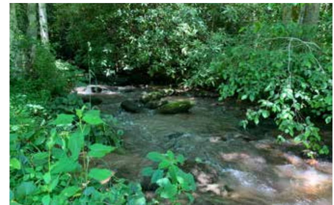
Creeks throughout the Community