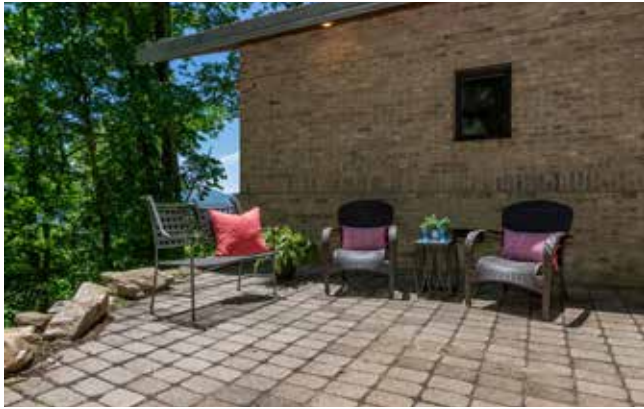
Enjoy Entertaining on the Front Cobblestone Courtyard