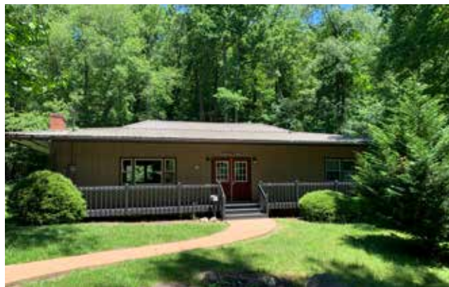
Fairview Forest Community Clubhouse