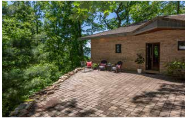
Brick Exterior, Stainless Gutters, and Concrete Shingles