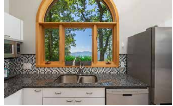
Mesmerizing Views from the Kitchen