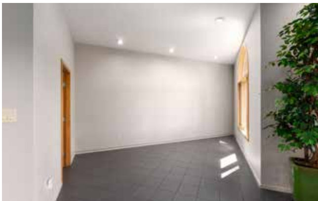
Additional Lower-Level Space • Future Fourth Bedroom