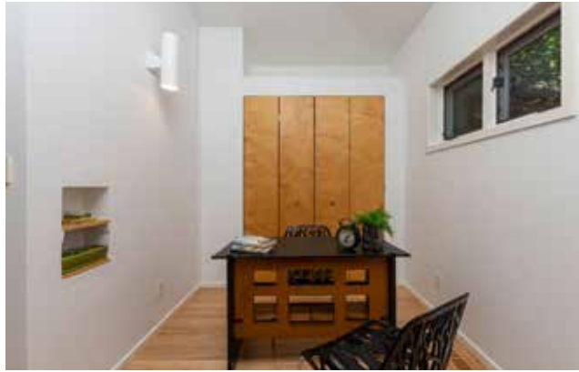
Built-ins, Low-E Windows, and Hideaway Murphy Bed