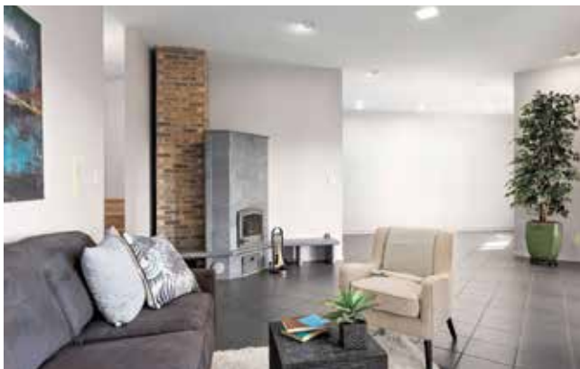
Lower Level with Wood Stove, Tile Floors, Recessed Lighting