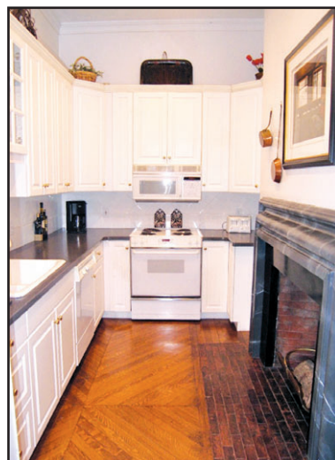
The kitchen of Unit 5 at 177 Commonwealth Avenue is notable for its herringbone oak floor and the original wood-burning fireplace.

Across the hallway from the living area is the bedroom – a massive suite, with a fireplace and a wall of windows. The bedroom also has all the detail of the living room – the wainscoting, ceiling decoration and elaborates craftsmanship. The wood-burning fireplace is framed