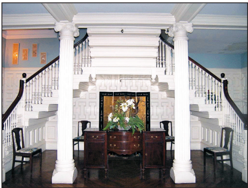
The entry of 177 Commonwealth Ave. is grand, with a wedding staircase and elaborate period details such as pillars and ceiling inlays.

Unit 5 at 177 Commonwealth Ave. includes direct access to a full parking space behind the building. There is central heat and air conditioning. All the electricity is included in the condo fee, which surely is a small price to pay to live in a quintessential historic building of the Back Bay.