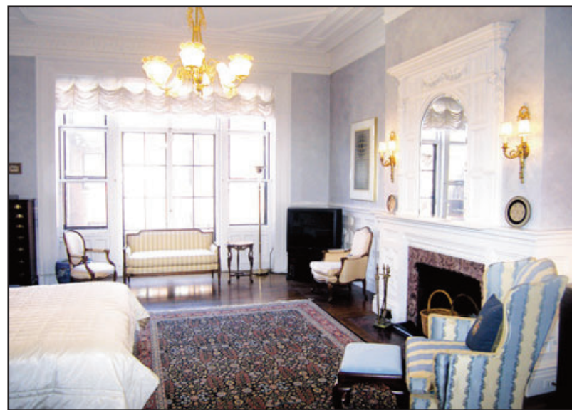
Back in its Victorian heyday, this condominium was a grand floor in a private mansion where every room was extravagant. Thus this bedroom is the size of a large studio apartment.

Like the parlor room, the bedroom is large enough to be divided into separate use areas – such as a study, dressing room and exercise space. There is a walk-in closet with shelving directly off the bedroom. There is also a bonus room, which could be used as a home office, a