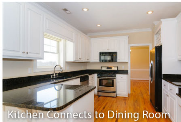
Kitchen Connects to Dining Room