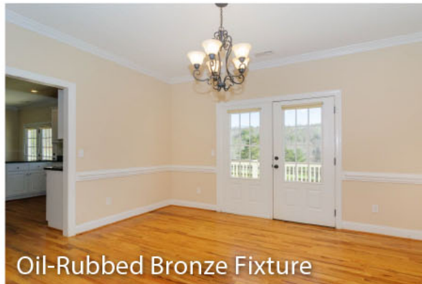
Oil-Rubbed Bronze Fixture