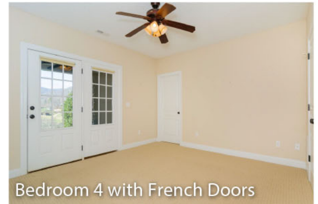
Bedroom 4 with French Doors