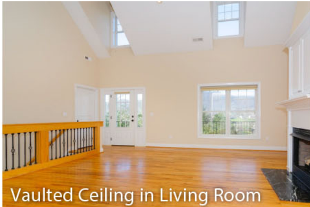
Vaulted Ceiling in Living Room