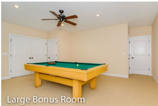
Large Bonus Room