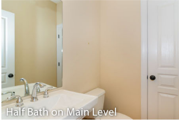
Half Bath on Main Level