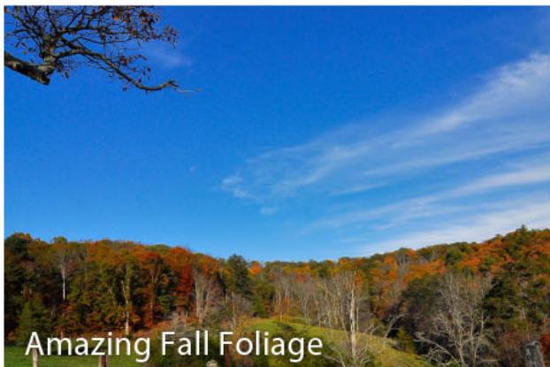
Amazing Fall Foliage