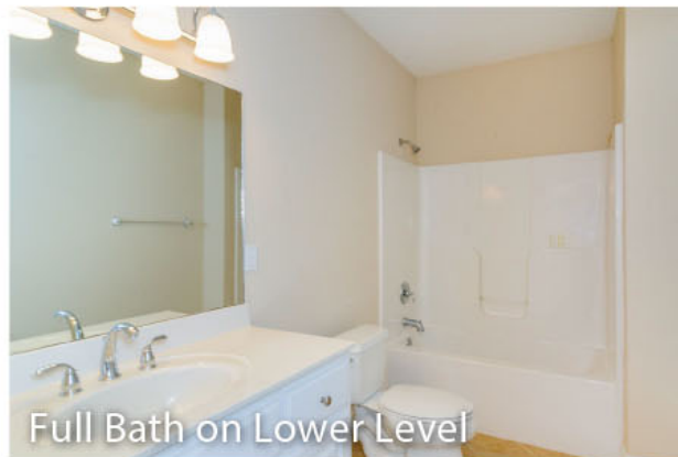
Full Bath on Lower Level