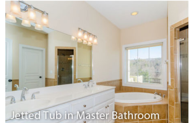
Jetted Tub in Master Bathroom