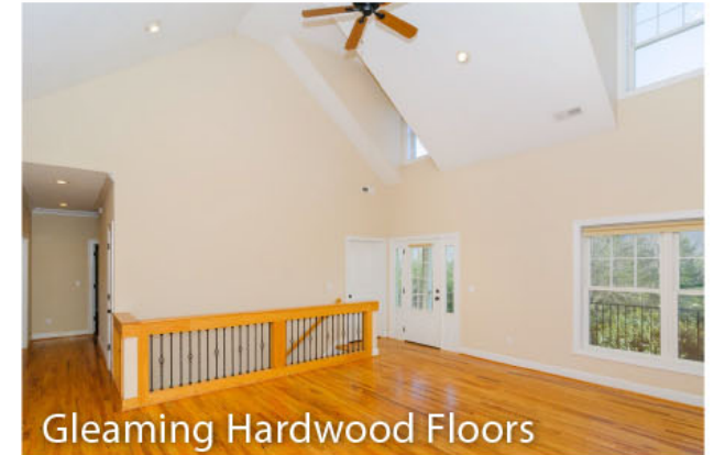
Gleaming Hardwood Floors