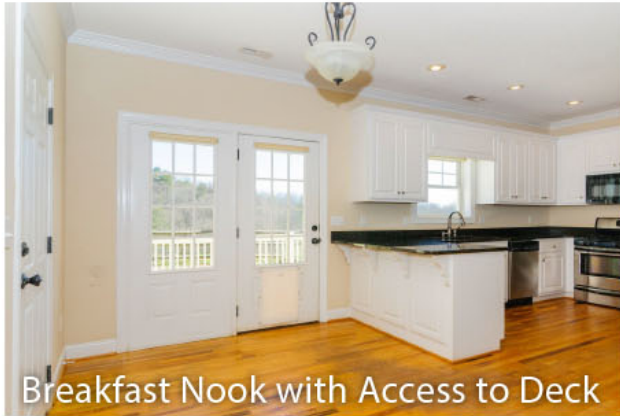
Breakfast Nook with Access to Deck