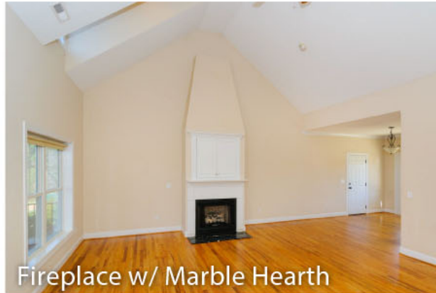
Fireplace w/ Marble Hearth