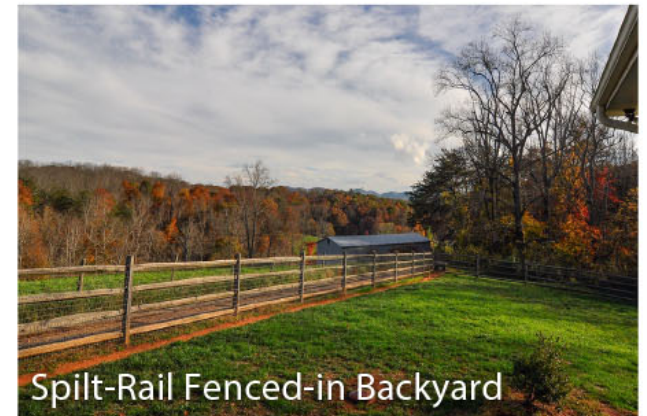
Spilt-Rail Fenced-in Backyard