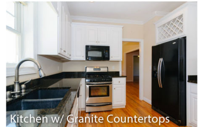
Kitchen w/ Granite Countertops