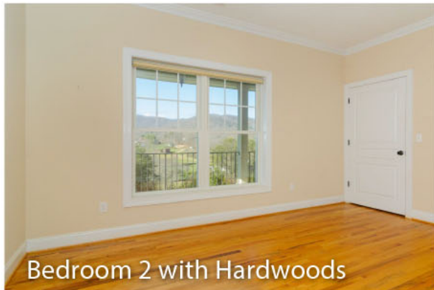
Bedroom 2 with Hardwoods