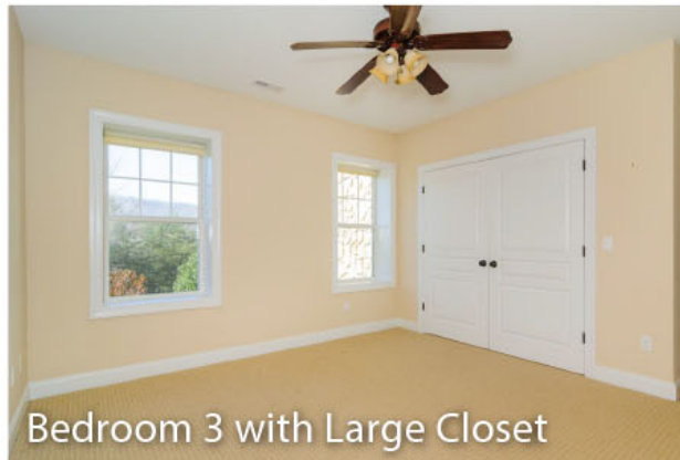
Bedroom 3 with Large Closet