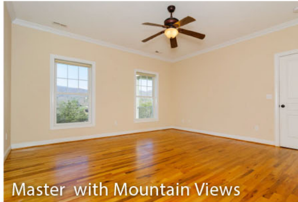
Master with Mountain Views