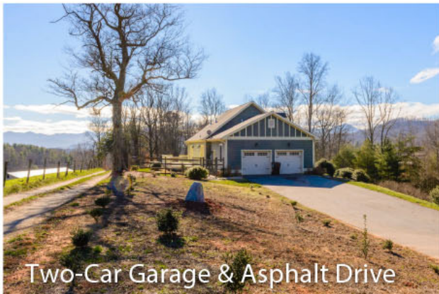
Two-Car Garage & Asphalt Drive