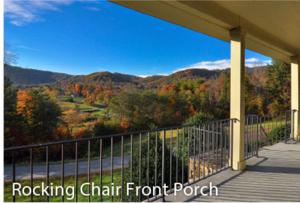
Rocking Chair Front Porch