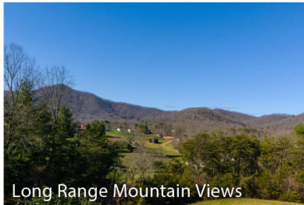
Long Range Mountain Views