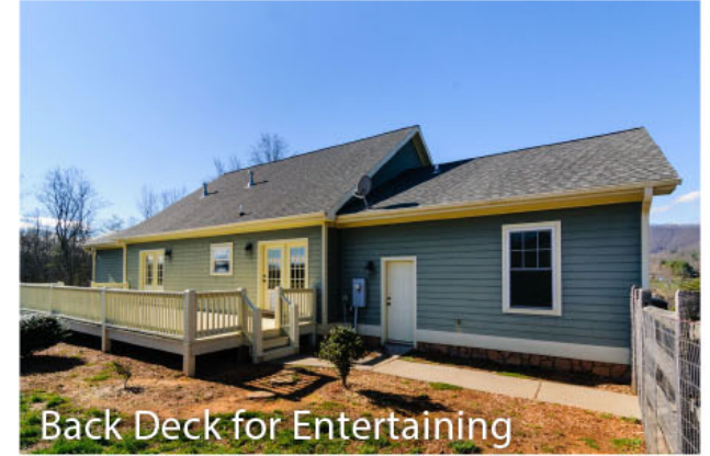
Back Deck for Entertaining