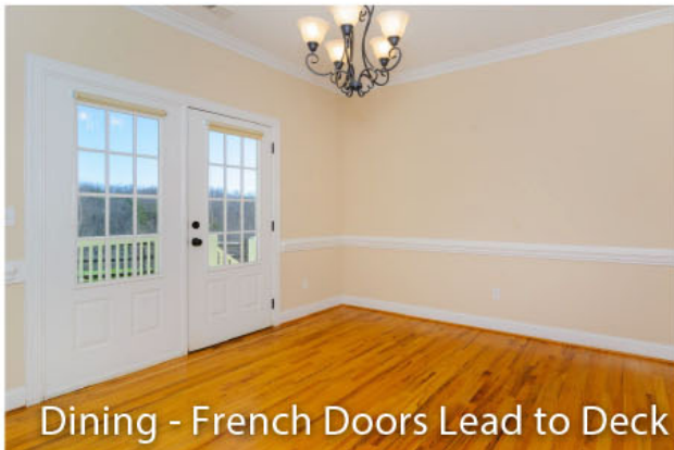
Dining - French Doors Lead to Deck