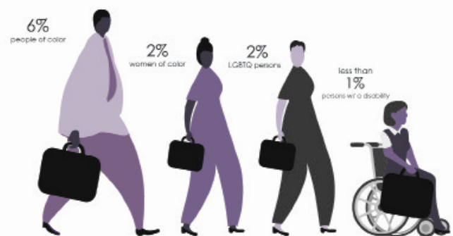
Percentage of Equity Partners