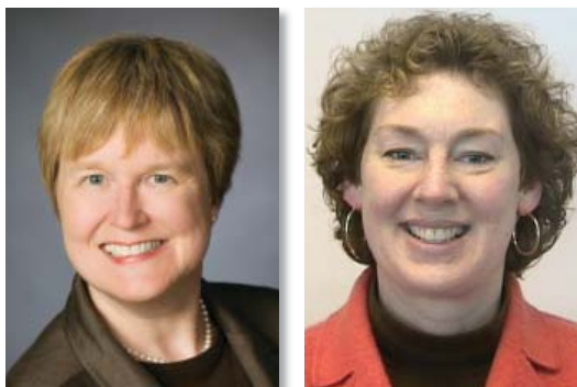
Cochairs, 2008 National Program Committee

"Just Do It!" and "Only Connect" at MLA '08 in Chicago. See you there!