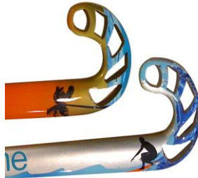
Beach Hockey Stick.