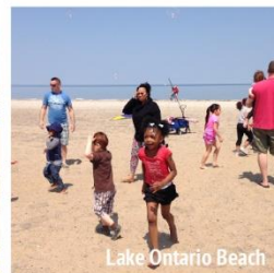
Lake Ontario Beach