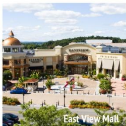
East View Mall