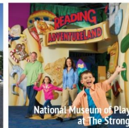
National Museum of Play at The Strong