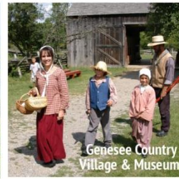
Genesee Country Village & Museum

ARTISANWORKS - 40,000 square ft. of a renovated factory building integrates arts of all kinds; promotes regional artists through an art incubator program. The collection includes more than half a million items.