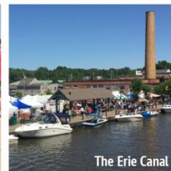
The Erie Canal