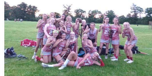
Congratulations Tribal U13 & U15 2017 Champions