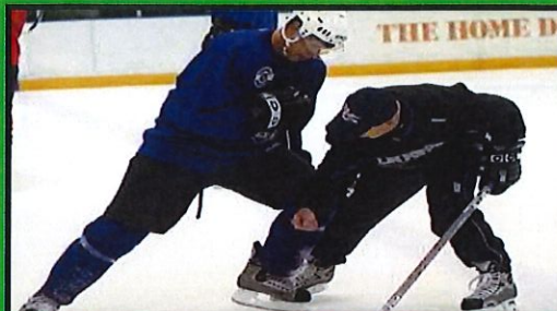
ABOVE: TEACHING NHL SUPERSTAR SIDNEY CROSBY

HURRY & SIGN-UP...THIS PROGRAM STARTS SOON! SKATING COACH TO THE NHL STARS!!!