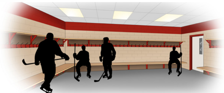
Updates to all locker rooms