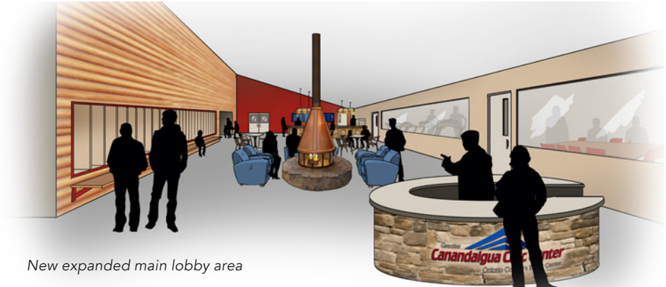
New expanded main lobby area