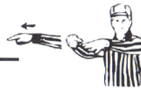
28. Illegal Equipment (Gloves)