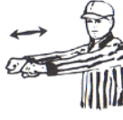
22. Cross Checking