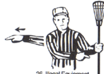
26. Illegal Equipment (Crosse)