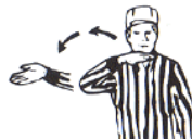
15. Re-entry of the Crease or Illegal Re-entry of the Defensive Zone