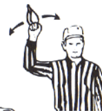
18. Disregard Flag