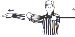
27. Deep Pockets