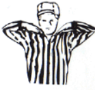
43. Illegal Touching of the Ball