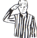
24. Unnecessary Roughness