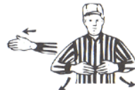
5. Alternate Possession