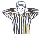
11. Simultaneous Fouls