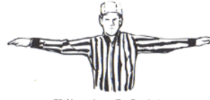
25. Unsportsmanlike Conduct