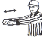
22. Cross Checking