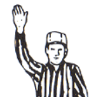
16. Play-On, Dead Ball or Dead Ball Followed by Appropriate Foul Signal