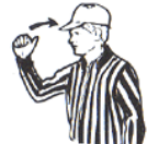
29. Expulsion Foul