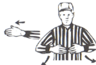
5. Alternate Possession