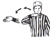
15. Re-entry of the Crease or Illegal Re-entry of the Defensive Zone