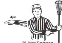
26. Illegal Equipment (Crosse)