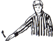
39. Crease Violation