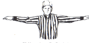
25. Unsportsmanlike Conduct