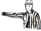
40. Conduct Foul