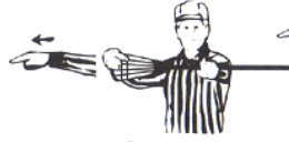
27. Deep Pockets