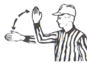
8. Out of Bounds Direction of Play