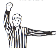
14. Stalling Warning