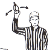
18. Disregard Flag