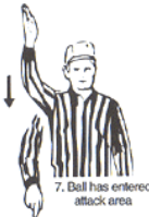
7. Ball has entered attack area