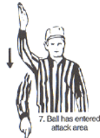
7. Ball has entered attack area