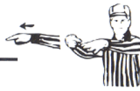
28. Illegal Equipment (Gloves)