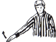
39. Crease Violation