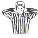
11. Simultaneous Fouls