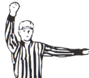
14. Stalling Warning