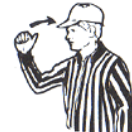
29. Expulsion Foul