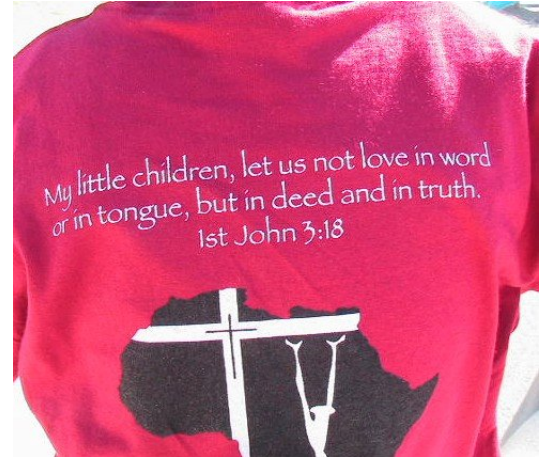
Back of our Prayer Walk Shirt