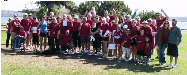
Prayer Walkers for Sudan

The prayer walk was not just a way to raise money for a critically needed medical center but also a time of intercessory prayer for our ministry and family. This past month has been very stressful with our family moving back from the USA to Africa. And the transition into the bush of Sudan has involved filling a 5 ton truck with food and medicine as well as 2 airplanes. In the midst of this chaos, packing, unpacking and repacking, we have had undeniable peace and our children have been amazing. We know the prayers of the Saints have been answered and we can't thank you enough for standing in the gap on our behalf during this critical time in our lives.