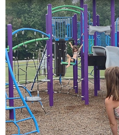
PHOTOS OF SAMPLE AMENITIES. ACTUAL AMENITIES MAY VARY IN APPEARANCE.