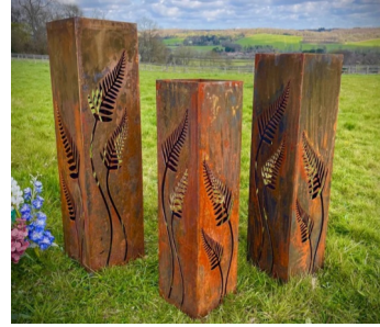
SAMPLE OUTDOOR ART SCULPTURE