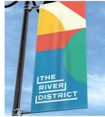
SAMPLE RIVER DISTRICT BANNER FROM ANOTHER COMMUNITY. EXACT SIGN FORMAT TO BE DESIGNED BY TOWN OF KNIGHTDALE STAFF AND PROVIDED TO DEVELOPER.