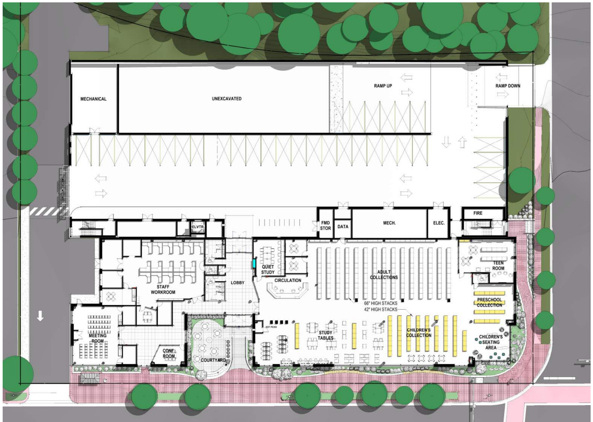
Building / Site Plan