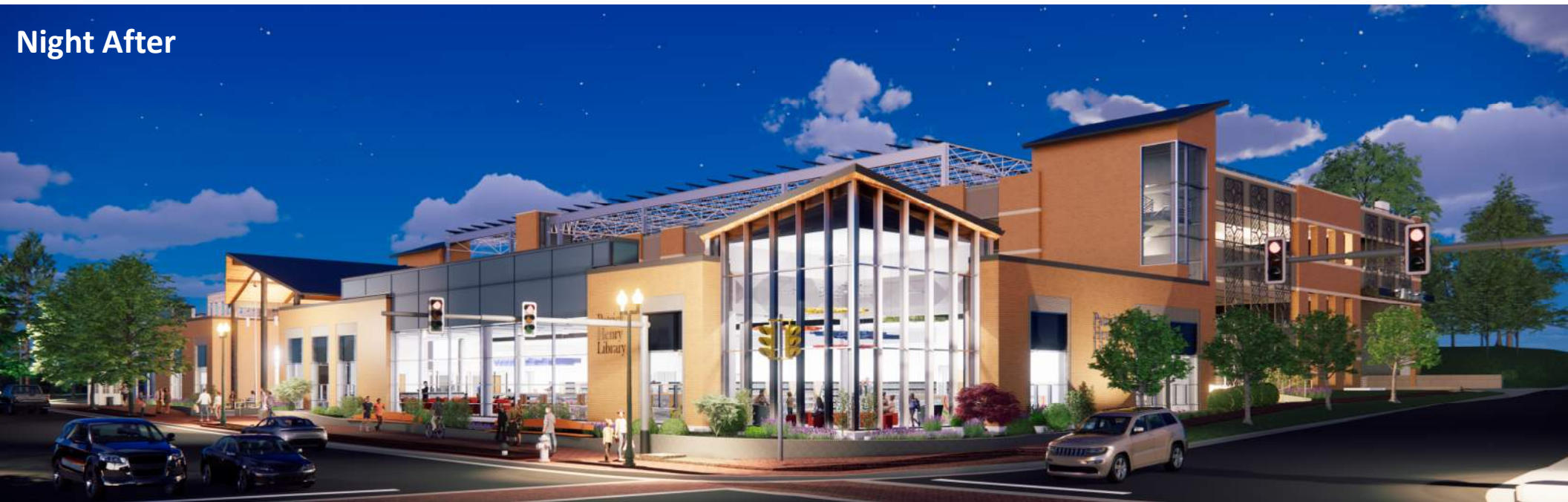
Corner View – Night