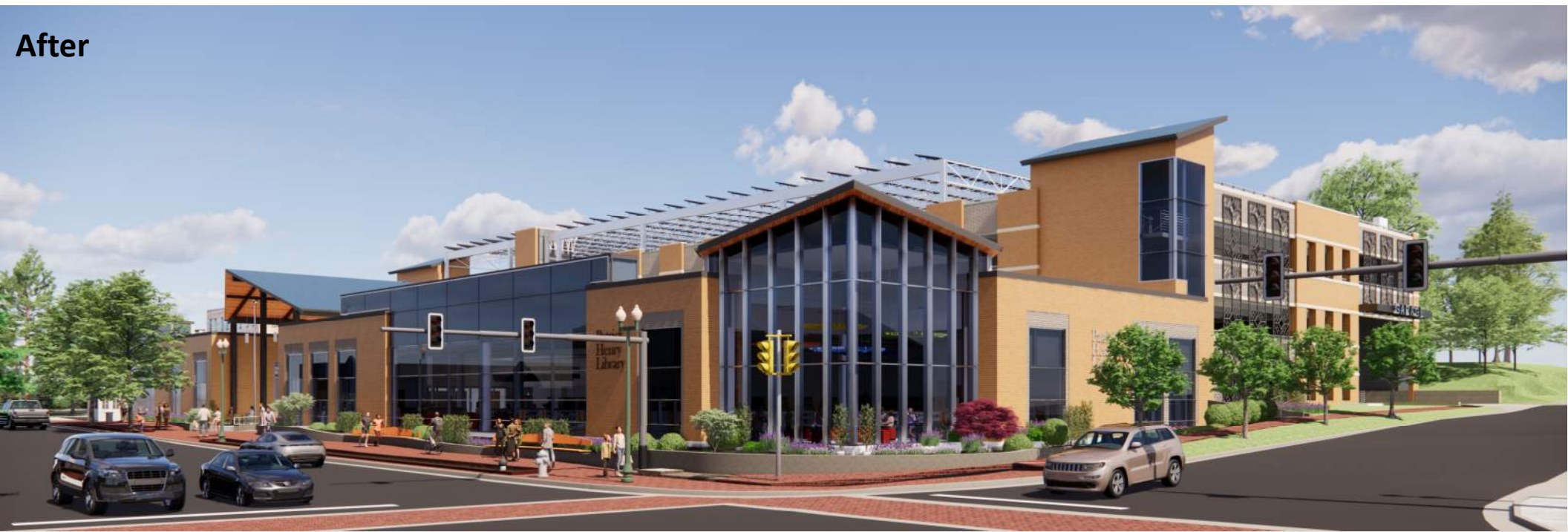
Corner View - Day