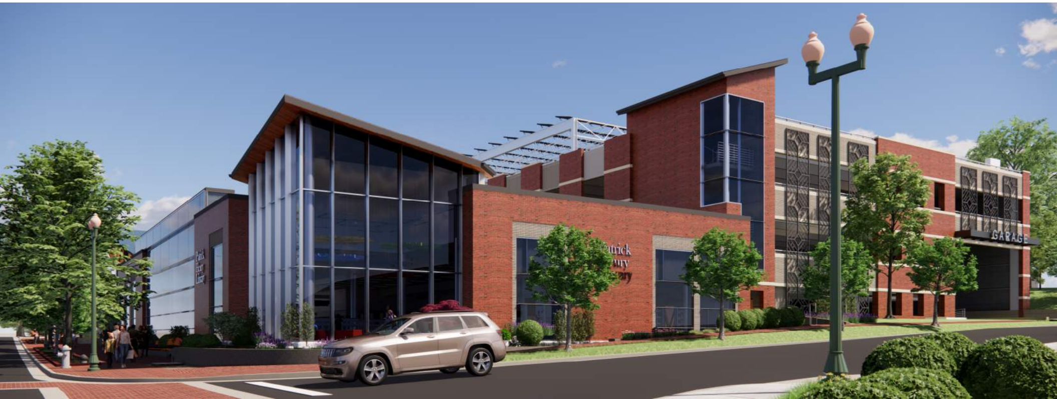
Brick – Old Lexington