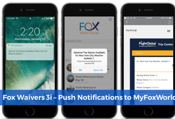
Fox Waivers 3i – Push Notifications to MyFoxWorld

Fox World Travel has continued to innovate its FoxWaivers 3i solution. To add further personalization for the traveler, Fox created custom e-mail messages and push notifications via the MyFoxWorld mobile app. Additionally, Fox implemented an intelligent alternative options feature, which allows travelers affected by a disruption in a connection city to choose an alternate option. Since launching the feature, 60-70 percent of travelers accept and rebook the recommended flight.