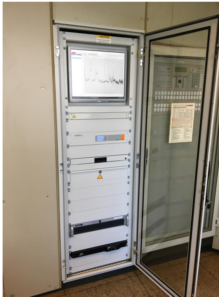
DTS Data Warehouse in Substation

The DTS, data warehouse, and PC with SmartVision™ software are located in a control room at the start of the pipeline for one project, and in a building at the end of the pipeline for the second one. One of two planned training sessions for these systems has taken place for pipeline personnel in the German language.