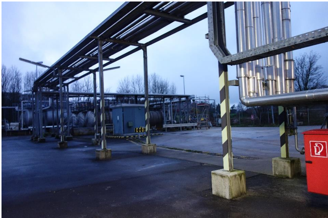
Pump station at end of pipeline

A leading energy company's pipeline began operating in December 2017, following the commissioning of an AP Sensing DTS. This pipeline is used to dispose of water leftover from production, which cannot be discarded above ground due to its natural, slight radioactivity. This radioactivity is a result of the depth below the earth's surface from which the water originated. Therefore, the reservoir water must be pumped back into the ground.