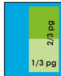
2/3 page 4-5/8" x 9-1/4" 1/3 page 4-5/8" x 4-3/4"