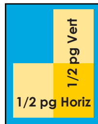
1/2 page Horizontal 7-1/8" x 4-3/4" Vertical 3-1/2" x 9-1/4"