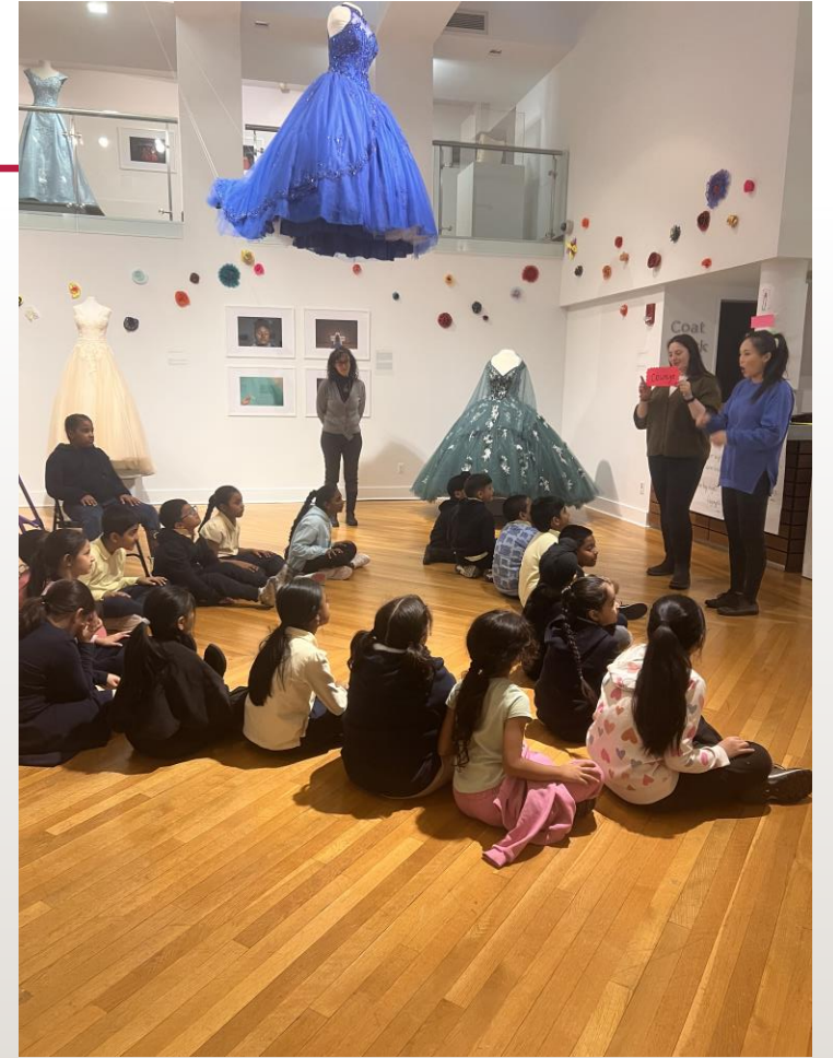
3 rd Grade- PS 62Q