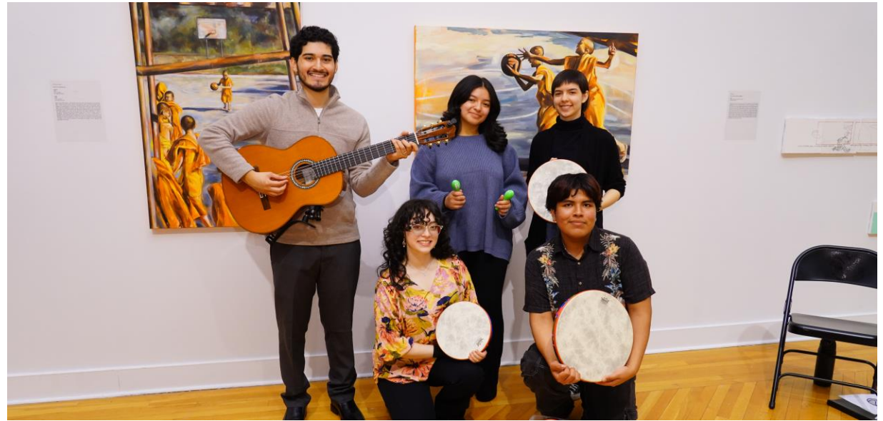
Family Day, April 19, 2026