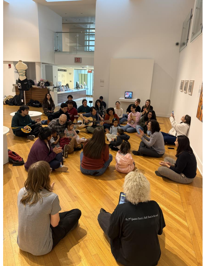
Pre-K; Child Development Center at QC