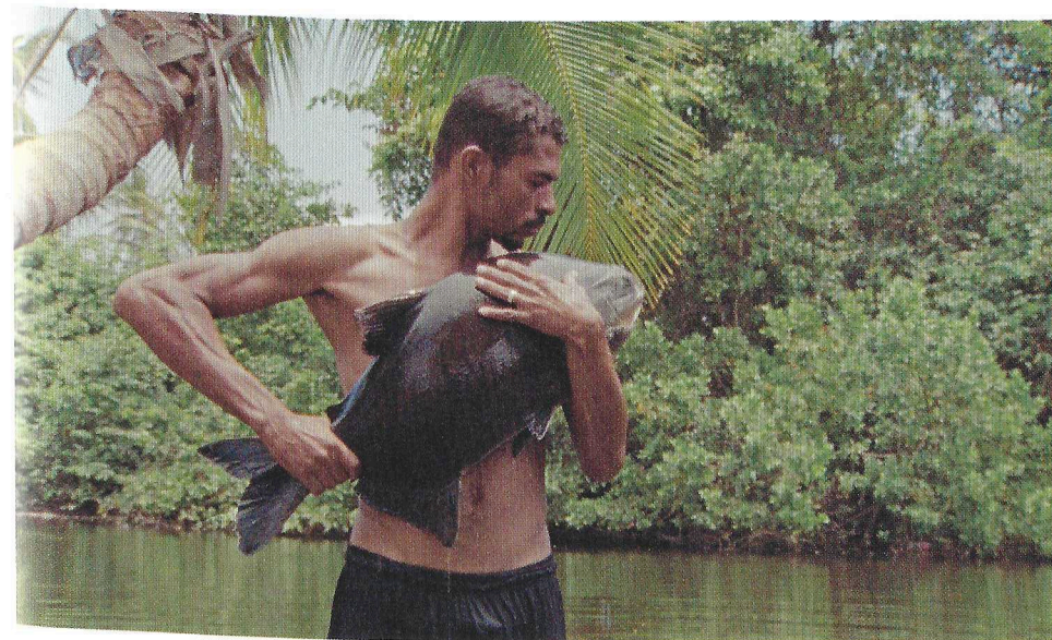
106 Jonathas de Andrade, O Peixe (The Fish) , 2016

106 Brazilian artist Jonathas de Andrade's film O Peixe (The Fish) (2016) is made up of repetitive sequences in which Amazonian fishermen go through the process of catching a fish, which they then gently caress and hold firmly to their bare chest until it dies. Although shot in the style of an ethnographic documentary about Amazonian tribes, the tender-cruel ritual performed on the asphyxiating fish was invented by the artist. Exposing the voyeurism of Western anthropologists' fascination with indigenous practices of ritual slaughter, the film suggested a correlation between the ethnographer's power