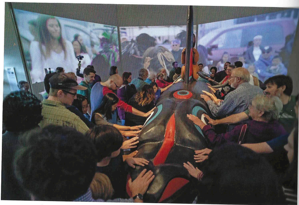
102 A totem pole blessing ceremony led by members of the Lummi Nation at the opening of 'Whale People: Protectors of the Sea', 2018

extractivist economy, The Natural History Museum advocates for a radical and transformative approach to museological representation at a time of ecological crisis.