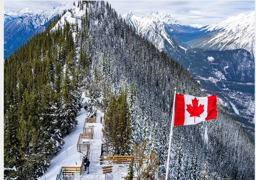
Exchange student #2