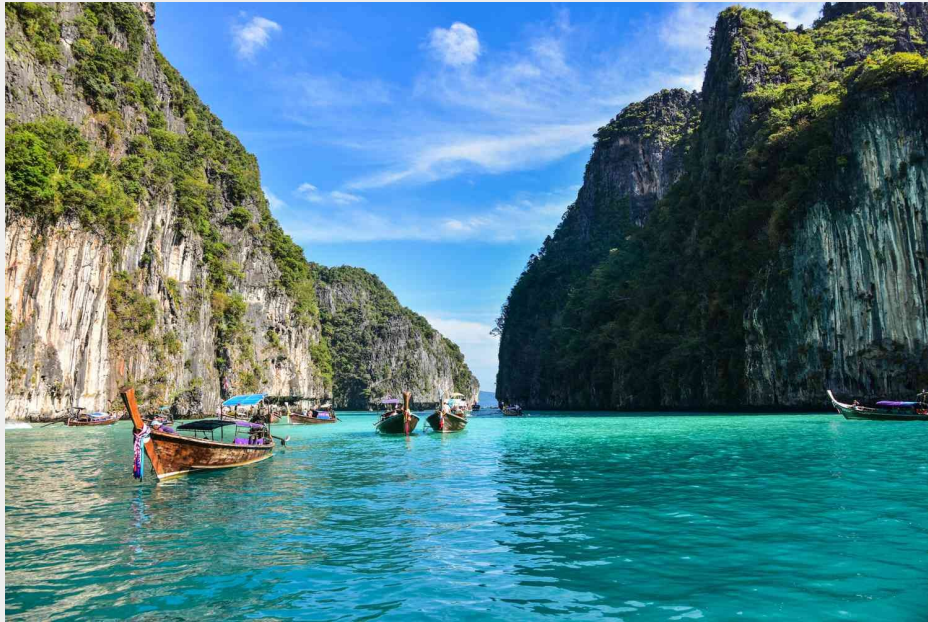
Exchange student #1

A similar situation is presented in the musical, “Snow” by By Tidtaya Sinutoke & Ty Defoe with two exchange students