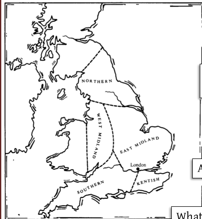
BRITAIN IN MIDDLE ENGLISH TIMES

Which dialect formed the literary standard for Old English?