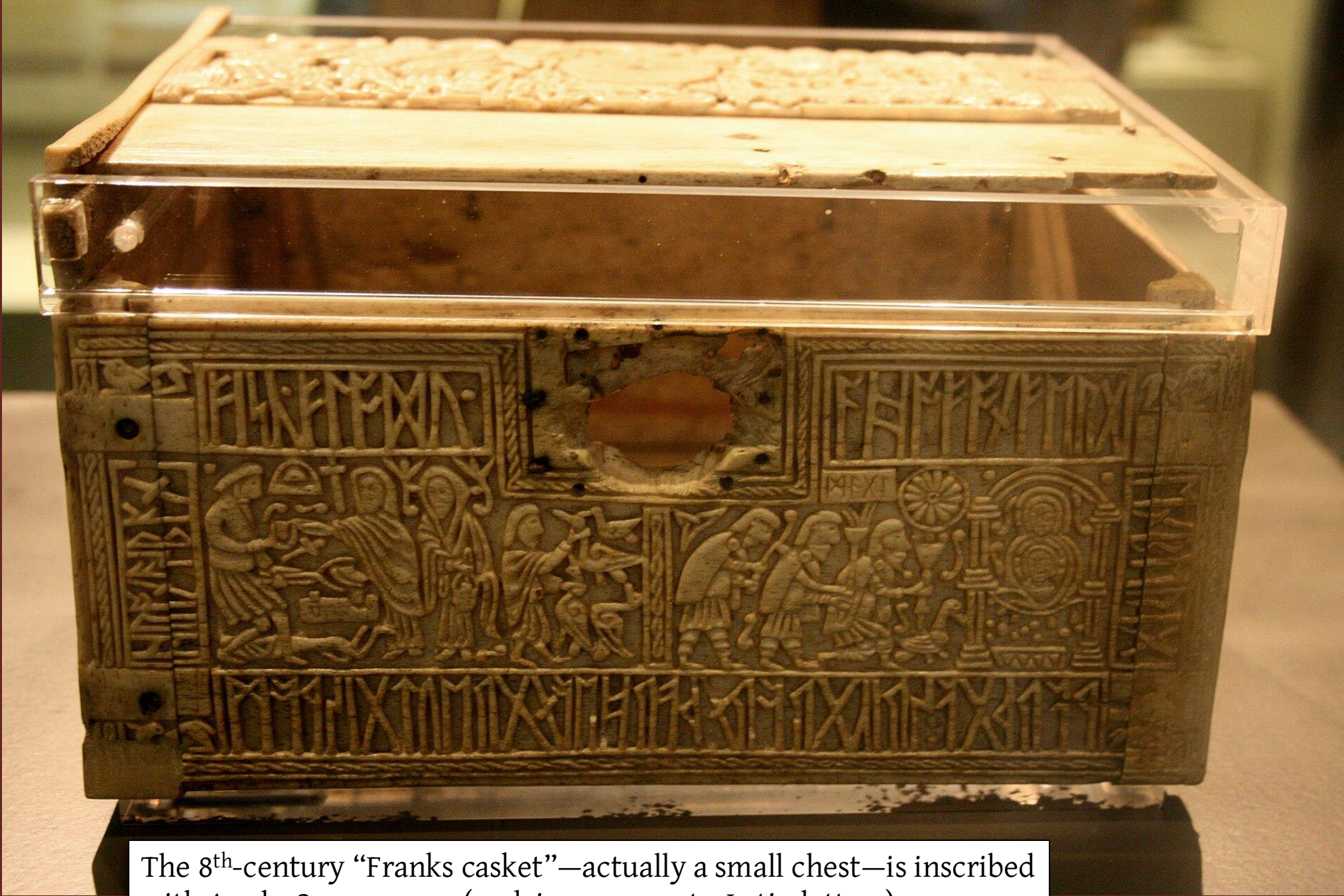
The 8 th -century “Franks casket”—actually a small chest—is inscribed with Anglo-Saxon runes (and, in some parts, Latin letters).