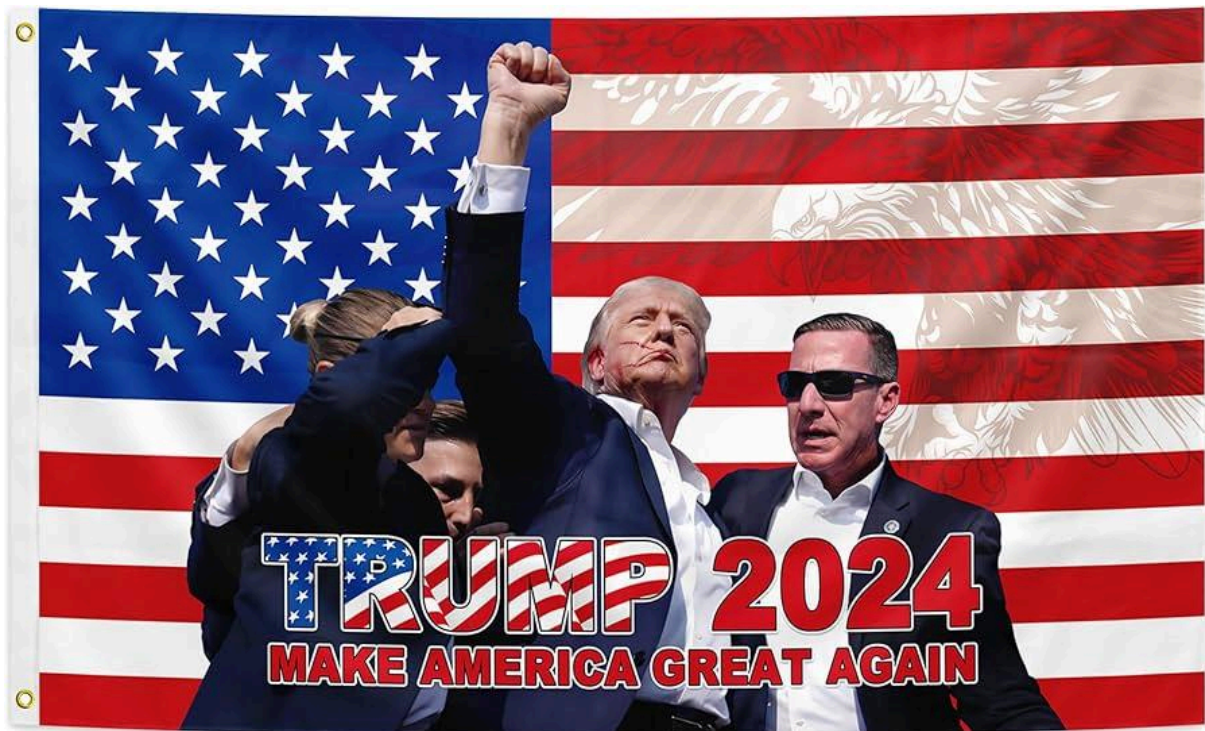
Figure 1: "I felt then and believe even more so now that my life was saved for a reason: I was saved by God to make America great again."

Figure 1 demonstrates Trump looking at the sky after he was shot.