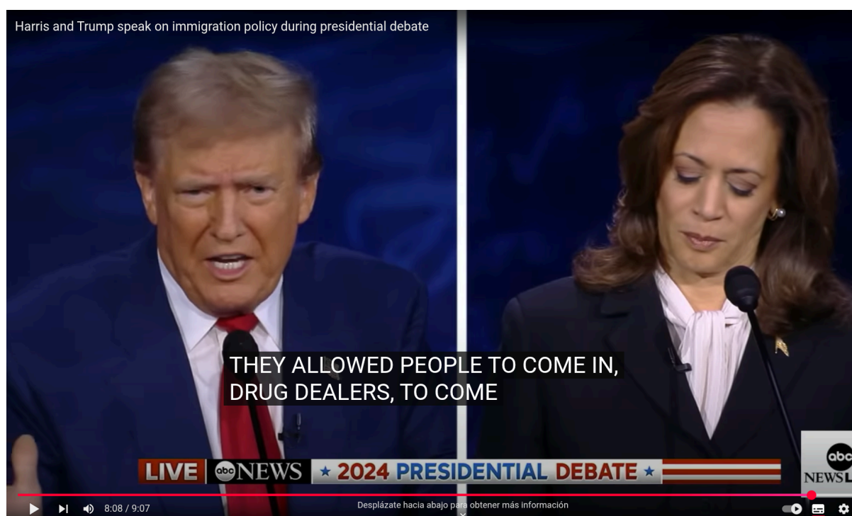
Figure 2 demonstrates Harris and Trump speak on immigration policy during presidential debate in Philadelphia. September 10, 2024

Figure 2: In the September 10, 2024, presidential debate in Philadelphia, former President Donald Trump and Vice President Kamala Harris presented sharply contrasting views on immigration policy.