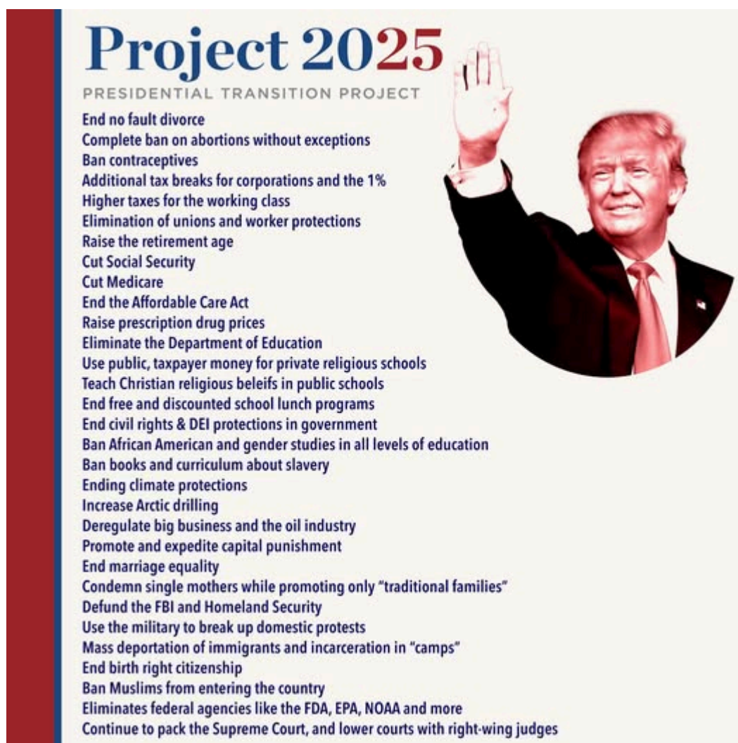
Figure 3: Project 2025, new changes under Donald Trump presidency.

policies. He outlined the largest deportation program in U.S. history, attempting to deport over 11 million illegal immigrants, even if it meant overcoming legal and logistical obstacles. He again promised to complete the border wall and deploy the U.S. military to the southern border. Additionally, he vowed to re-establish travel bans on Muslim countries and eliminate birthright citizenship for offspring of unlawful immigrants. Trump's claims about migrants committing crimes, such as pet thefts in Ohio, were refuted by fact-checkers. His stance is an escalation of his previous enforcement immigration policy, and it elicited severe political and public controversy.