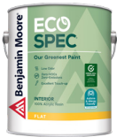
Benjamin Moore Eco Spec Interior Paint Janovic Paint & Decorating Center