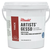
Utrecht Artists Acrylic Gesso or Utrecht Professional Acrylic Gesso Dick Blick