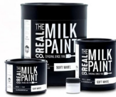
The Real Milk Paint Tools For Woodworking, realmilkpaint.com