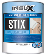
INSL-X STIX Waterborne Bonding Primer Janovic Paint & Decorating Center