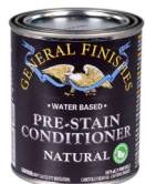
General Finishes Water Based Pre Stain Conditioner Janovic Paint & Decorating Center, Rockler.com