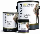
Golden PaintWorks Metallic Paint Janovic Paint & Decorating Center