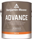
Benjamin Moore Advance Janovic Paint & Decorating Center