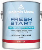
Benjamin Moore Fresh Start High-Hiding All-Purpose Primer Janovic Paint & Decorating Center