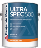
Benjamin Moore Ultra Spec 500 Interior Paint Janovic Paint & Decorating Center