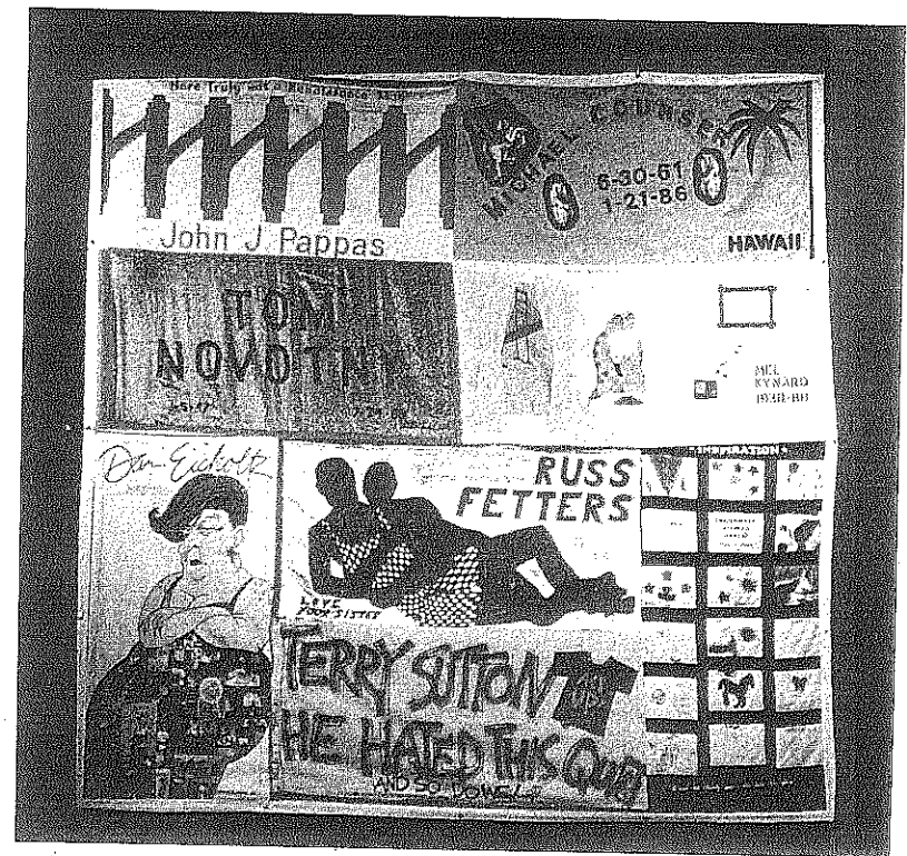
Figure 19. Twelve-by-twelve-foot section of the AIDS Memorial Quilt.

Naming has particular significance in the context of the AIDS epidemic. Communities affected by AIDS have struggled with battles over language, metaphor, and representation. In the context of the quilt, naming is often seen as equivalent to coming out, in particular for the families of gay men; a fear of or refusal to name in the quilt often reflects families' fear of acquiring by association the stigma of homosexuality. Panels cannot be altered by anyone but their makers once they have arrived at the NAMES Project and been catalogued. Hence, battles over naming in the quilt take place at the time of panelmaking, often as conflicts between families and lovers. These