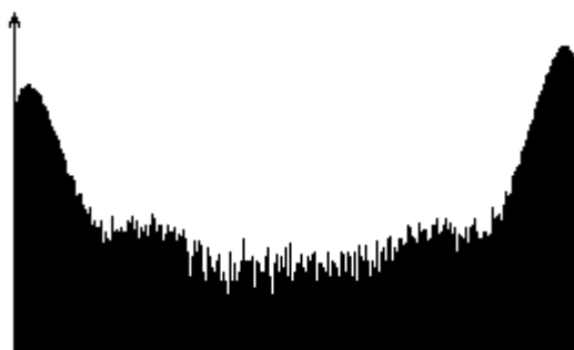
Figure 2: Bimodal noisy distribution

country or if middle incomes are very rare. But nowadays the distributions are often not unimodal (as the Gaussian distribution). Figure 2 shows a bimodal distribution. The already mentioned scientist Quételet made even a study about average human which caused vehement debates. This concept is problematic, among other things, because the averages of single characteristics (as height and weight) do not correspond. Other people even claimed the average is the source of beauty.