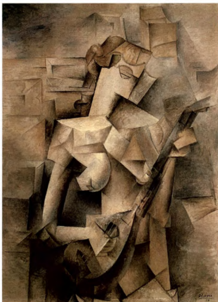
4 • Pablo Picasso, Girl with a Mandolin (Fanny Tellier), Spring 1910 Oil on canvas, 100.3 × 73.6 (39% × 29%)

allying them with the frontal picture surface—and yet, in total contradiction, to be precipitously plunging downward through the full-blown spatial chasm opened between the houses, it is not flatness that is at issue but quite another matter. This could be called the rupture between visual and tactile experience, something that had obsessed nineteenth-century psychology with the problem of how the separate pieces of sensory information could be unified into a single perceptual manifold.