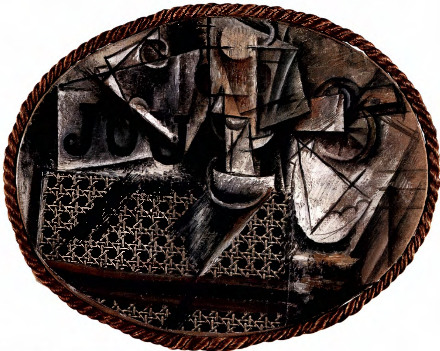
5 • Pablo Picasso, Still Life with Chair Caning , 1912 Oil and pasted oilcloth on canvas, surrounded with rope, 27 × 34.9 (10% × 13%)

And nowhere is this disjunction between the visual and the tactile as absolute and as economically stated than in the Still Life with Chair Caning [5] that Picasso painted in the spring of 1912, near the very end of Analytical Cubism. Affixing a length of rope around the edge of an oval canvas, Picasso creates a little still life that appears both to be set within the carved frame of a normal painting, and thus arranged in relation to the vertical field of our plane of vision, and to be laid out on the surface of an oval table, the carved edge of which is presented by the same rope and the covering for which is given literally by a glued-on section of printed oilcloth. Like the downward plunge at Horta, the table-top view is presented as one alternative here, a horizontal in direct opposition to the “diaphane’s” vertical, a bodily perspective declaring the tactile as separate from the visual.