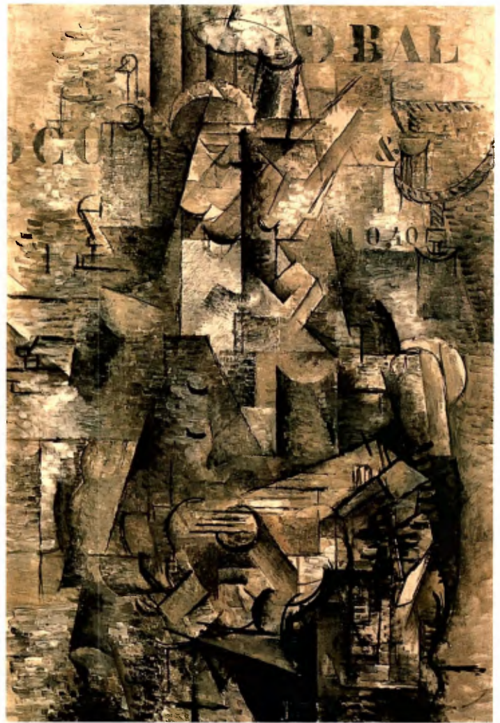
2 • Georges Braque, The Portuguese (The Emigrant) , Fall 1911–early 1912 Oil on canvas, 114.6 × 81.6 (45 1/8 × 32 1/4)

In pointing to the fact that Braque adopted these devices earlier than Picasso—not only the stenciled lettering and the nails illusionistically tacking the whole canvas to the studio wall but also the wood-graining patterns employed by house painters—Greenberg set up an internal competition between the two artists, thereby rupturing their “cordée,” or self-proclaimed posture of having been roped together like mountaineers as they explored their new pictorial terrain (their collaboration was so shared that they often did not sign their own paintings). This vision of a race toward flatness was further enhanced by the question of which of the two first