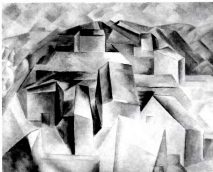
3 • Pablo Picasso, Houses on the Hill, Horta de Ebro, Summer 1909 Oil on canvas, 65 × 81.5 (25% × 31%)