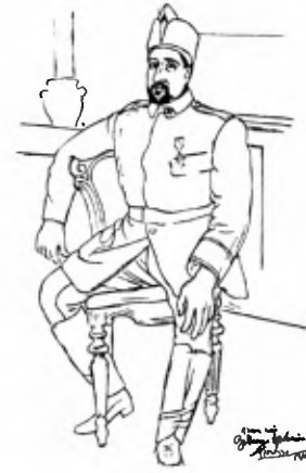
Guillaume Apollinaire (1880–1918)

Arguing that Cubism was exclusively concerned with bringing about the unity of the pictorial object, The Rise of Cubism defines this unity as the necessary fusion of two seemingly irreconcilable opposites: the depicted volumes of “real” objects and the flatness of the painter’s own physical object (just as “real” as anything in the world before the artist), which is the canvas plane of the picture. Reasoning that the pictorial tool to represent volume had always