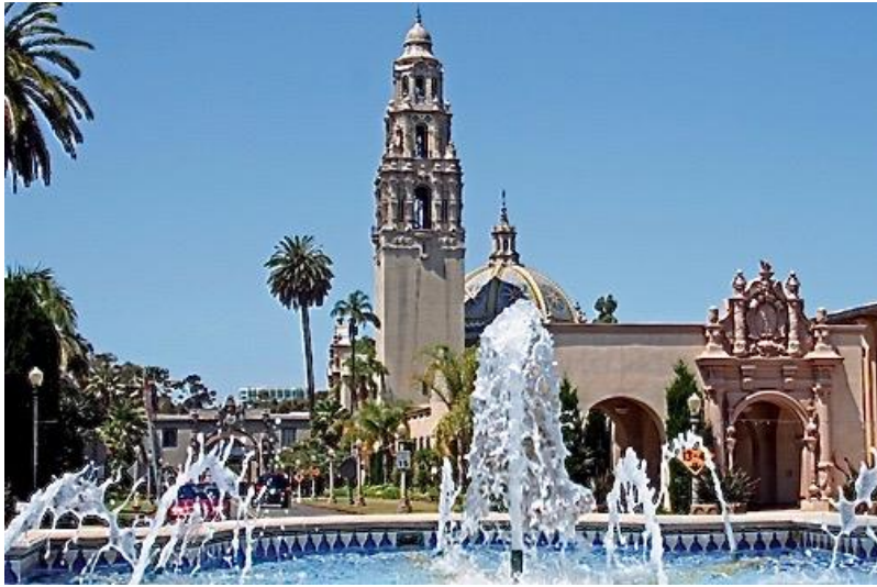
Photo of Balboa Park fountain

Spring is in the air in the northern hemisphere, which means flowers are blooming, people are planning family gatherings outdoors (covid-19 restrictions permitting), and the semester is drawing to a close in some parts of the world.