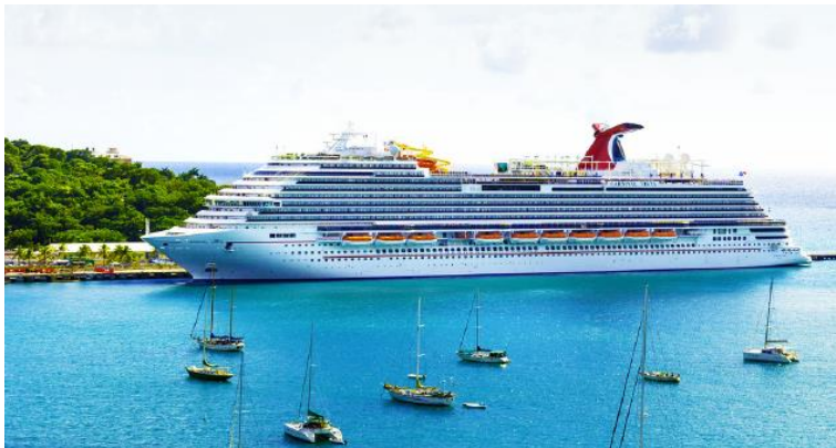
©2019 Carnival Corporation. Carnival® and the Carnival logos are trademarks of Carnival Corporation.

The registration for the ABC Western region Baja cruise conference on March 1-5, 2020 is now underway. If you have not submitted a proposal for the Western ABC Conference but are interested in attending the conference, please register by October 15 to secure early bird discounted registration fees: https://www.businesscommunication.org/page/2020-abc-western-u.s.-conference#Registration .