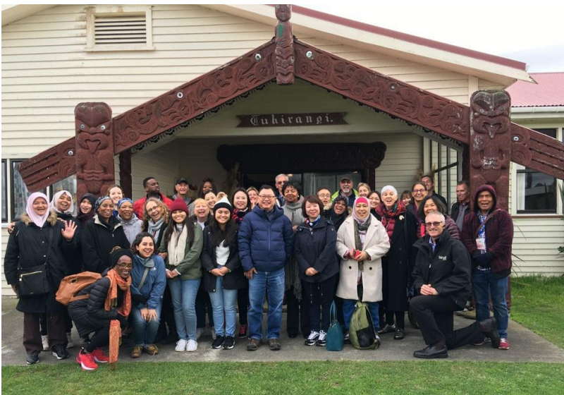
Conference participants outside a traditional Maori Marae (Meeting Ground) on a cold July day