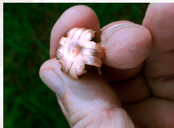
VOR-TX® 35 Whelen 180 GR Tipped TSX, recovered from a hog

Barnes all-copper bullets expand rapidly, dump more energy and penetrate deeper than any lead-core bullet available. The Barnes all-copper bullets expand into four, five or six cutting petals that tear through tissue, bone and vital organs allowing for deeper penetration and maximum terminal performance.